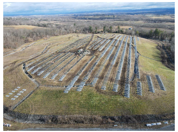
Site Overview(drone shot)