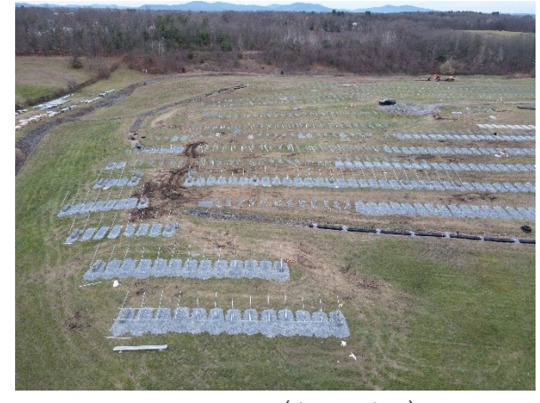
Site Overview(drone shot)