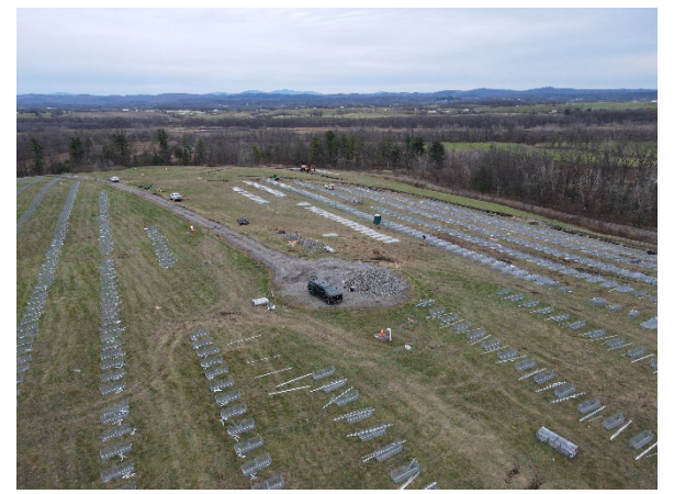
Site Overview(drone shot)