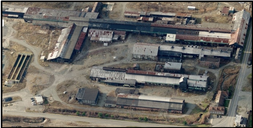
Figure 1: Northern Portion of the AL Tech Specialty Steel Main Plant Area (OU-01)

The New York State Department of Environmental Conservation (DEC) has taken over the site-wide investigation activities at the Al Tech Specialty Steel site ("site") located at Spring Street and along Lincoln Avenue in Colonie, Albany County. Please see the included map for the site location. Documents related to the investigation and cleanup of this site can be found at the document repositories identified below under "Where to Find Information."