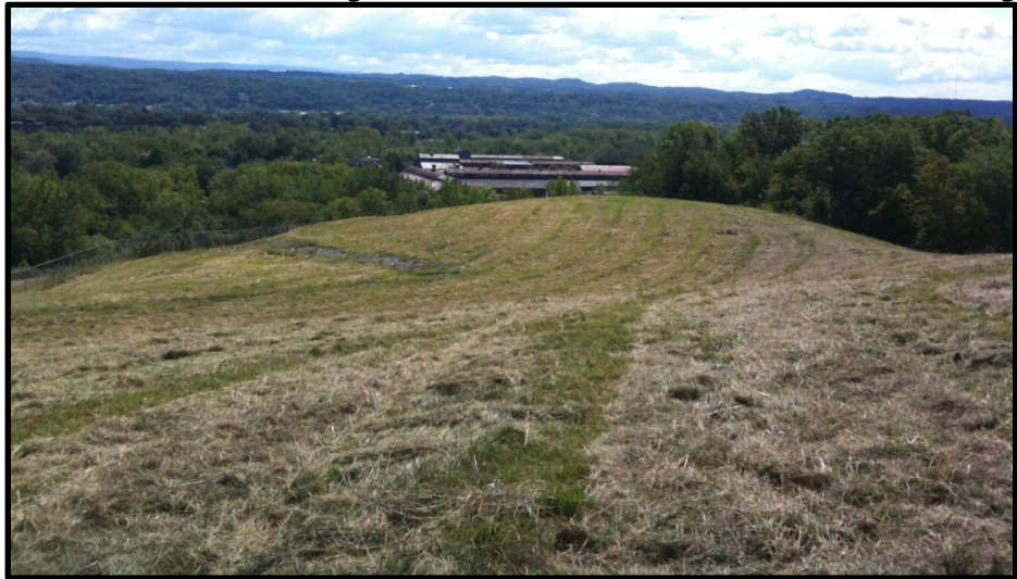
Figure 2: AL Tech Specialty Steel Waste Management Area (OU-02) After Mowing

LOCATION: The Al Tech Specialty Steel site lies in a Suburban area in the Town of Colonie, NY. The Al Tech Main Plant Area