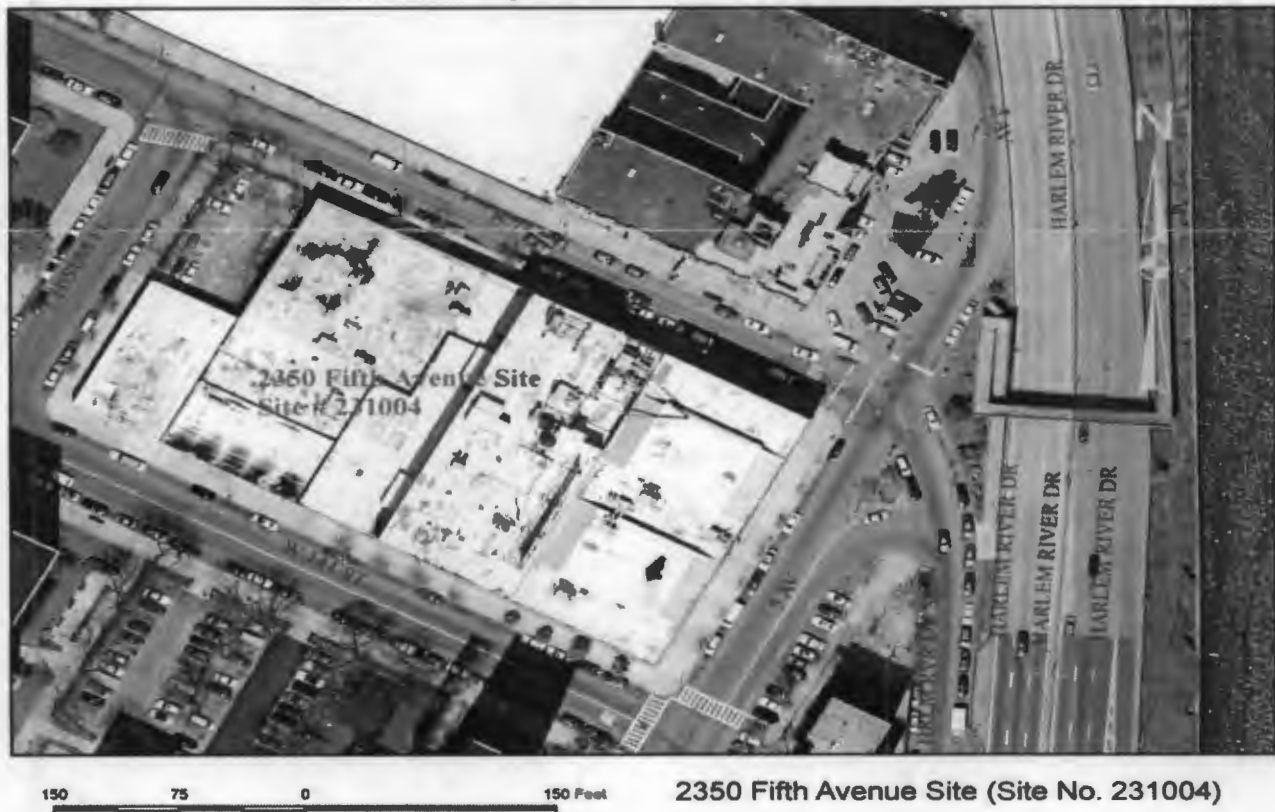
2350 Fifth Avenue Site (Site No. 231004)