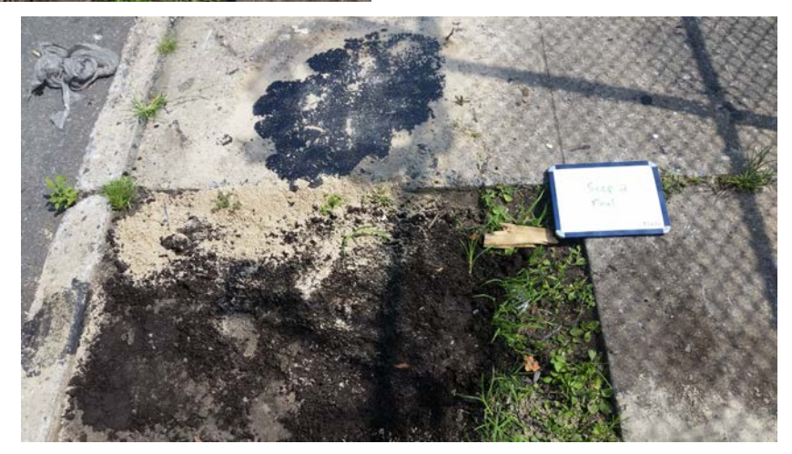
Post-removal w/ sand/stone dust and top soil