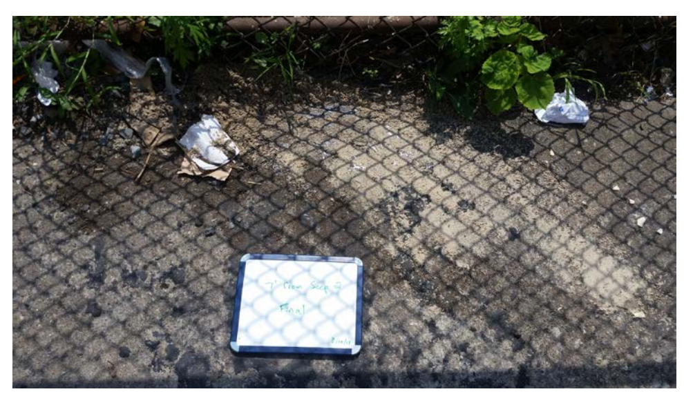
Post-removal w / sand/stone dust