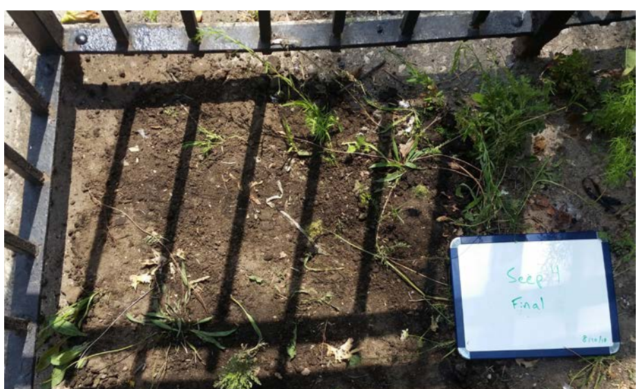
Post-removal w / topsoil