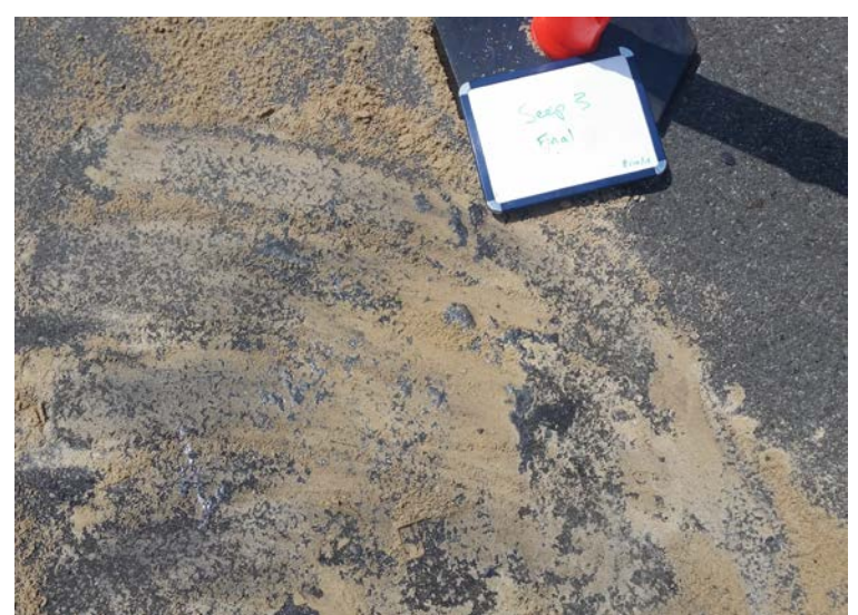
Post-removal w/ sand/stone dust