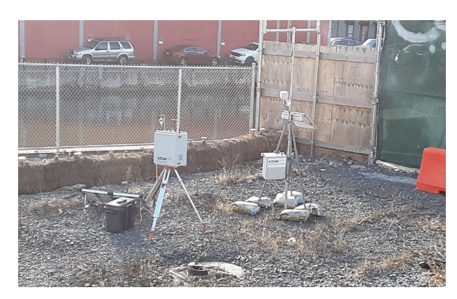
Community Air Monitoring Station