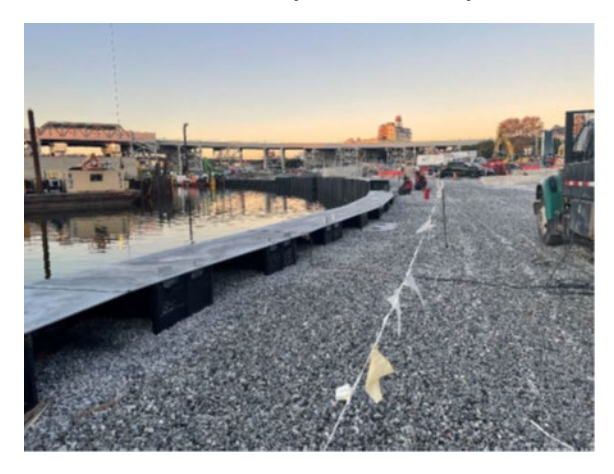
Site Restoration Activities – Temporary Cover and Bulkhead Cap