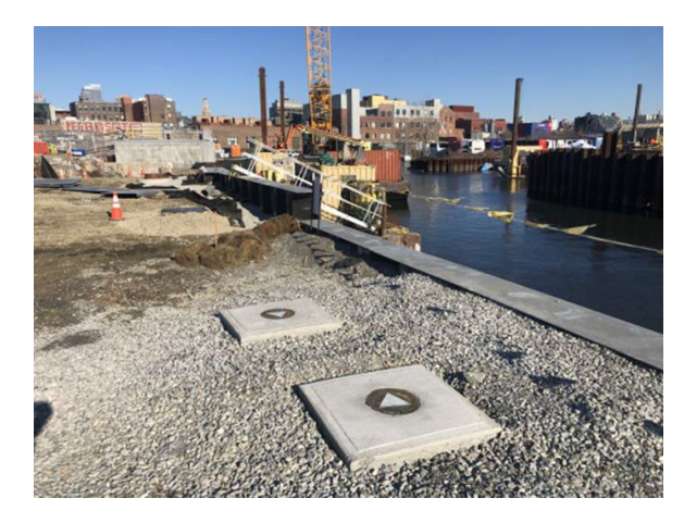
Newly-Installed Recovery Wells