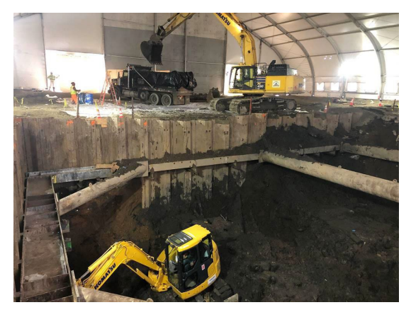
Excavation within the temporary fabric structure