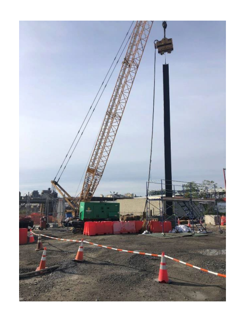
Bulkhead Installation Activities