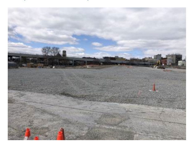
Site Restoration Activities – Temporary Cover and Bulkhead Cap