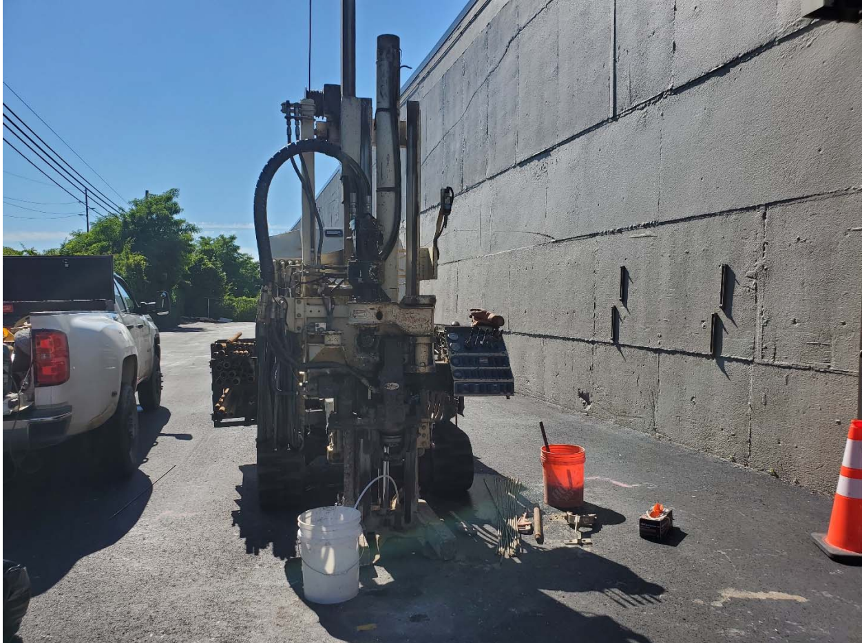
SPC-01 Northern edge of the building