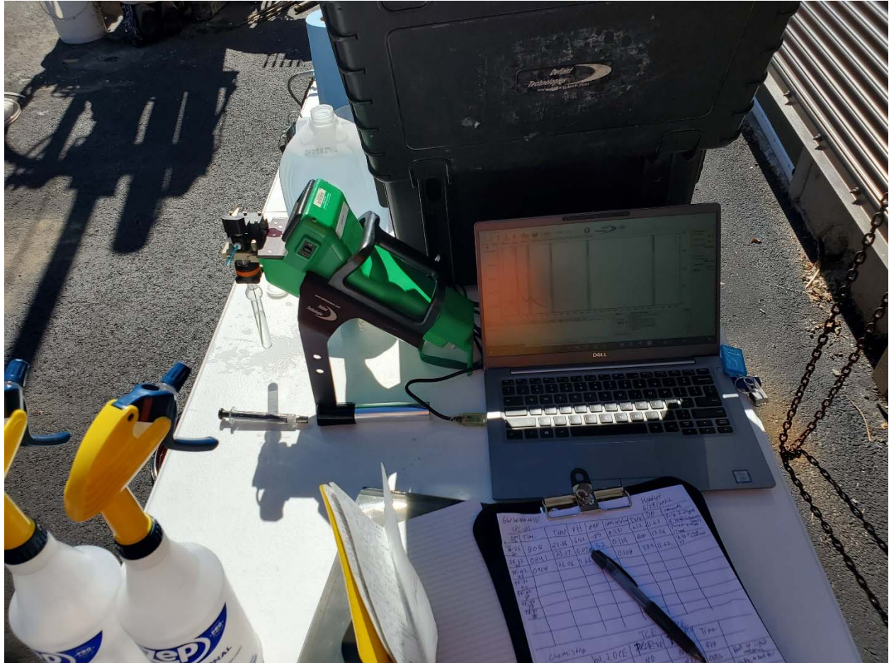
FROG-5000 set-up at SPC-01