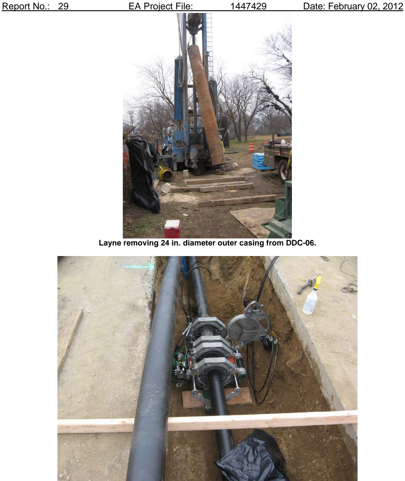
Posillico performing heat fusion weld in trench.