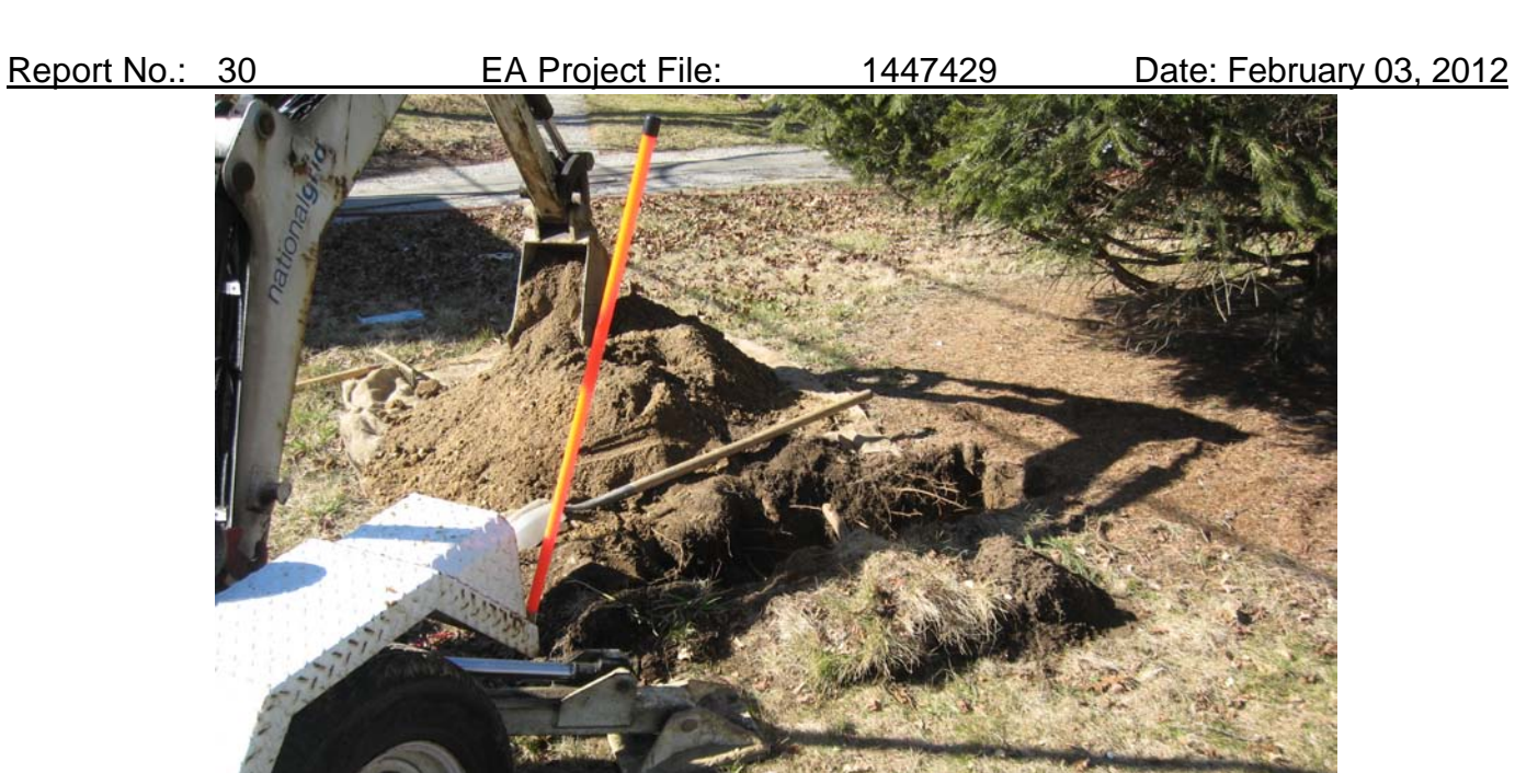
View of excavation area at 6 Benjoe Dr.