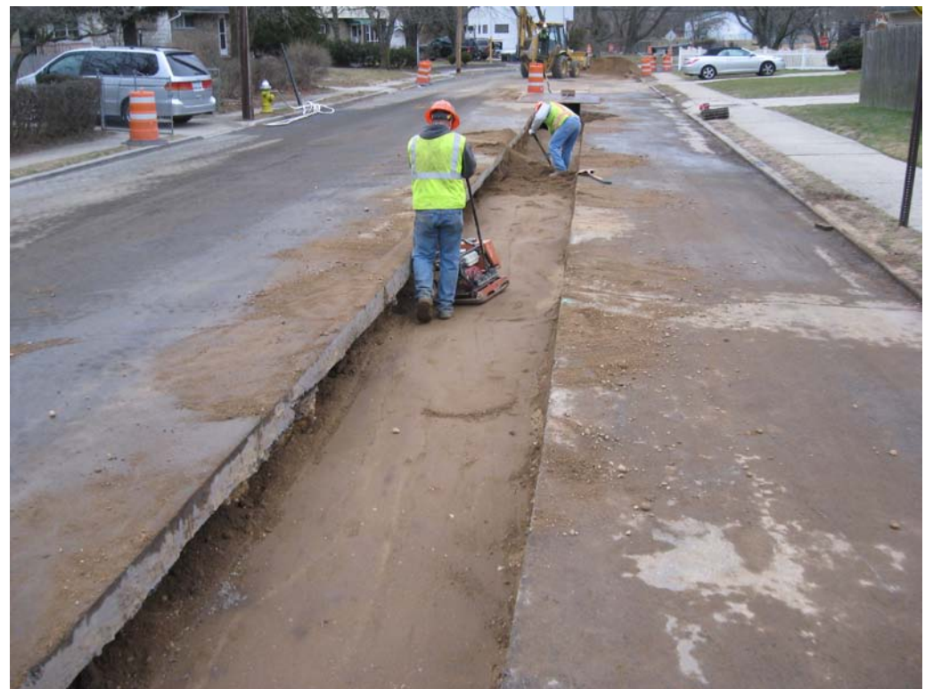
Posillico compacting backfill, looking east.

HDPE air lines extending through trench line, at DDC-07 looking west.