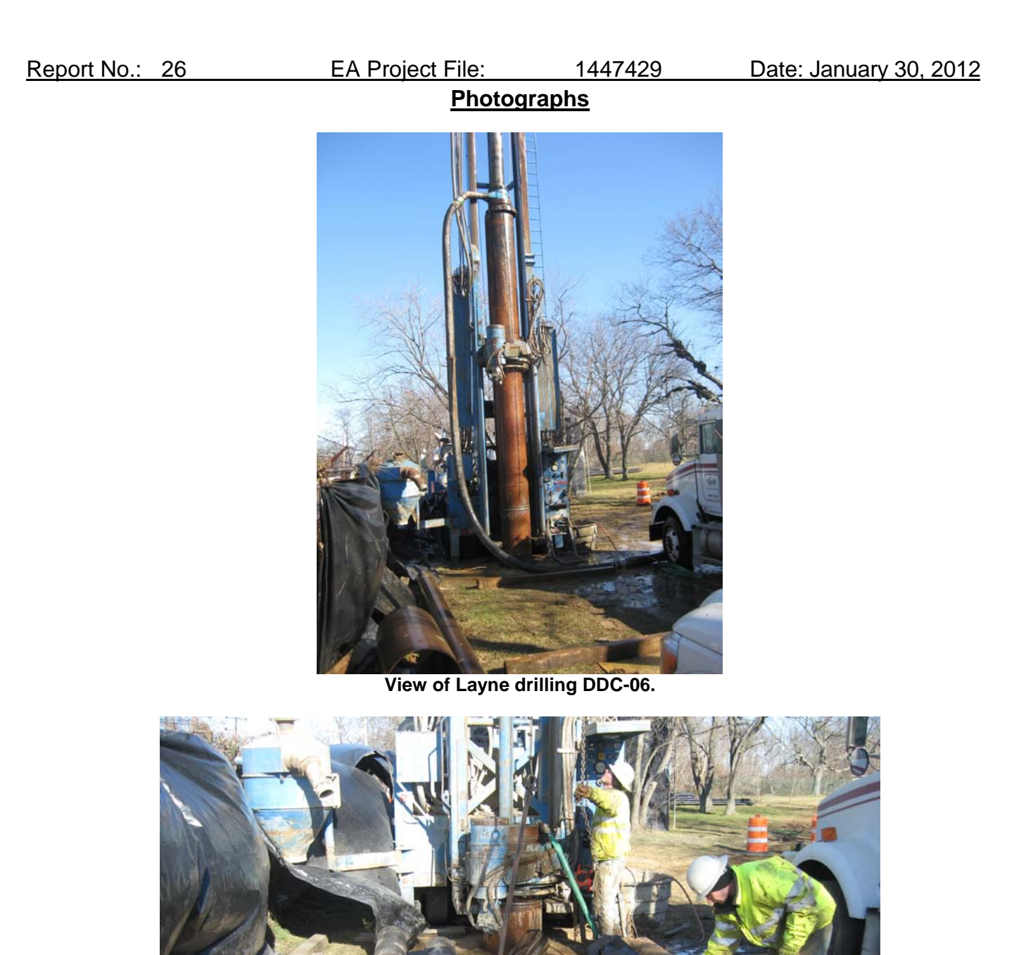
Layne using 6-in. diameter bailer to remove sands.