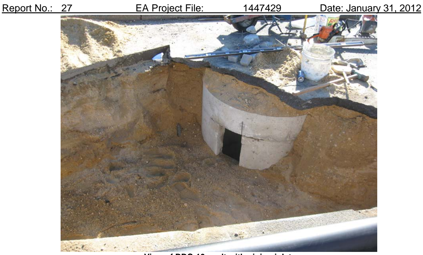
View of DDC-10 vault with piping inlet.