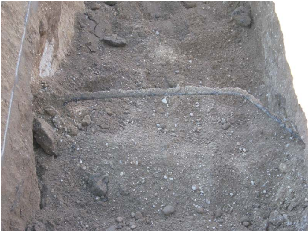
View of damaged gas line.