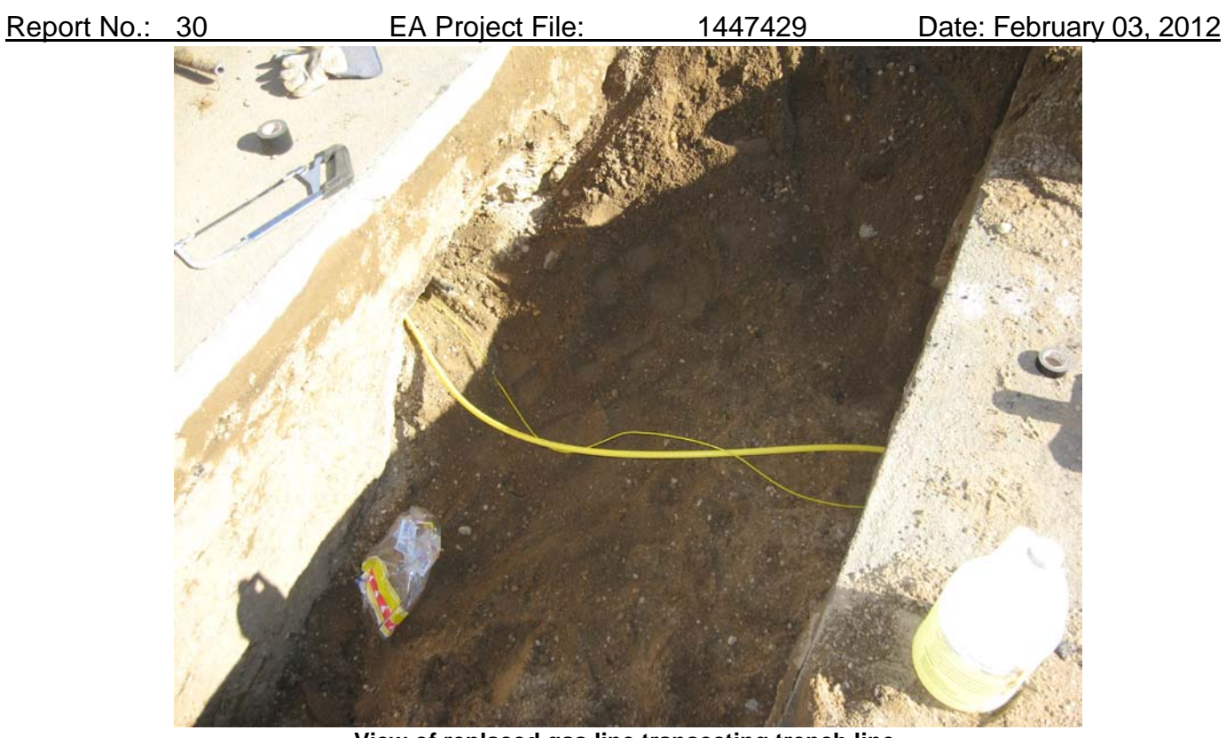
View of replaced gas line transecting trench line.