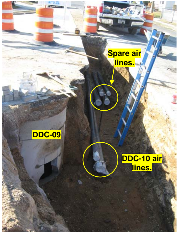
View of DDC-09 vault and air lines from DDC-10 and spares.