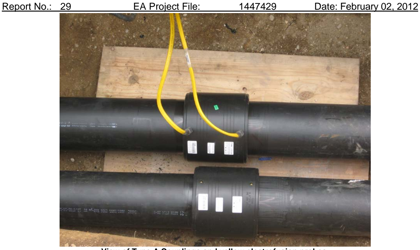
View of Type A Couplings and yellow electrofusion probes.