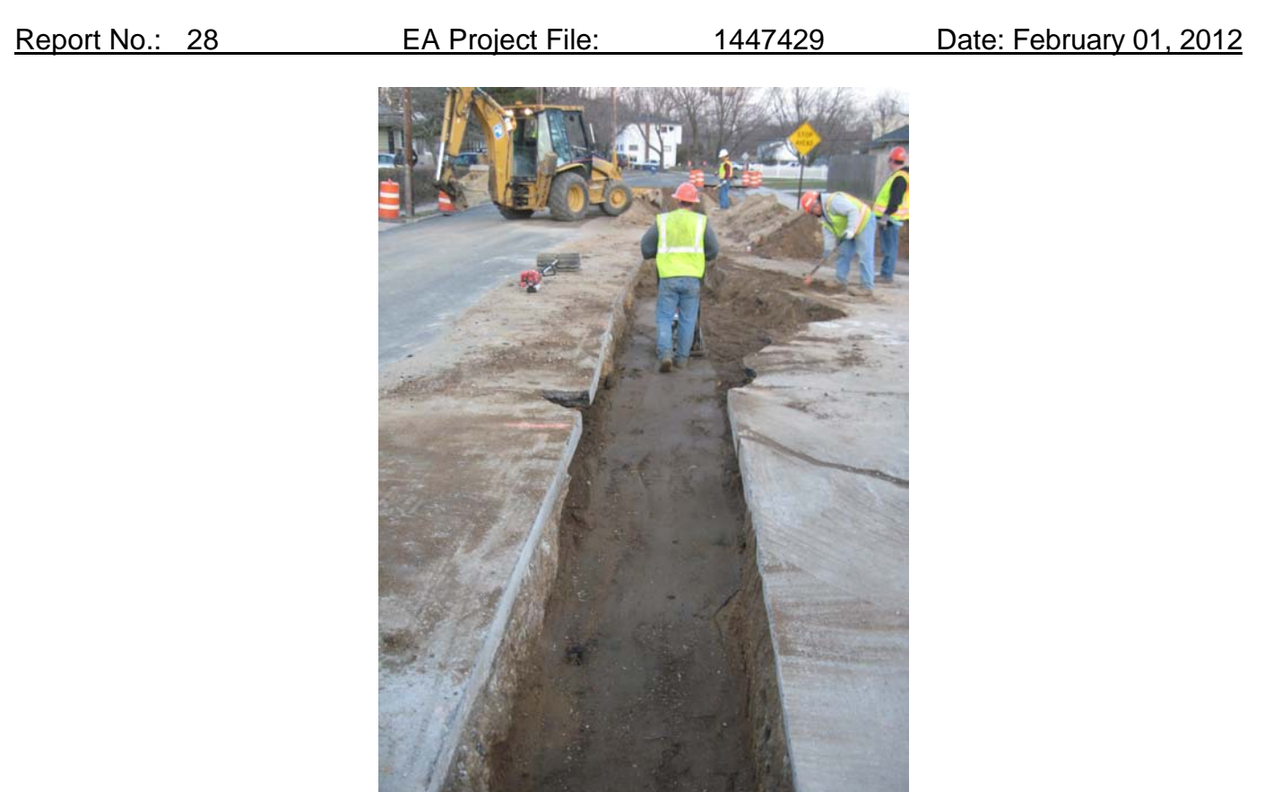
Posillico compacting backfill, at DDC-09 looking east.