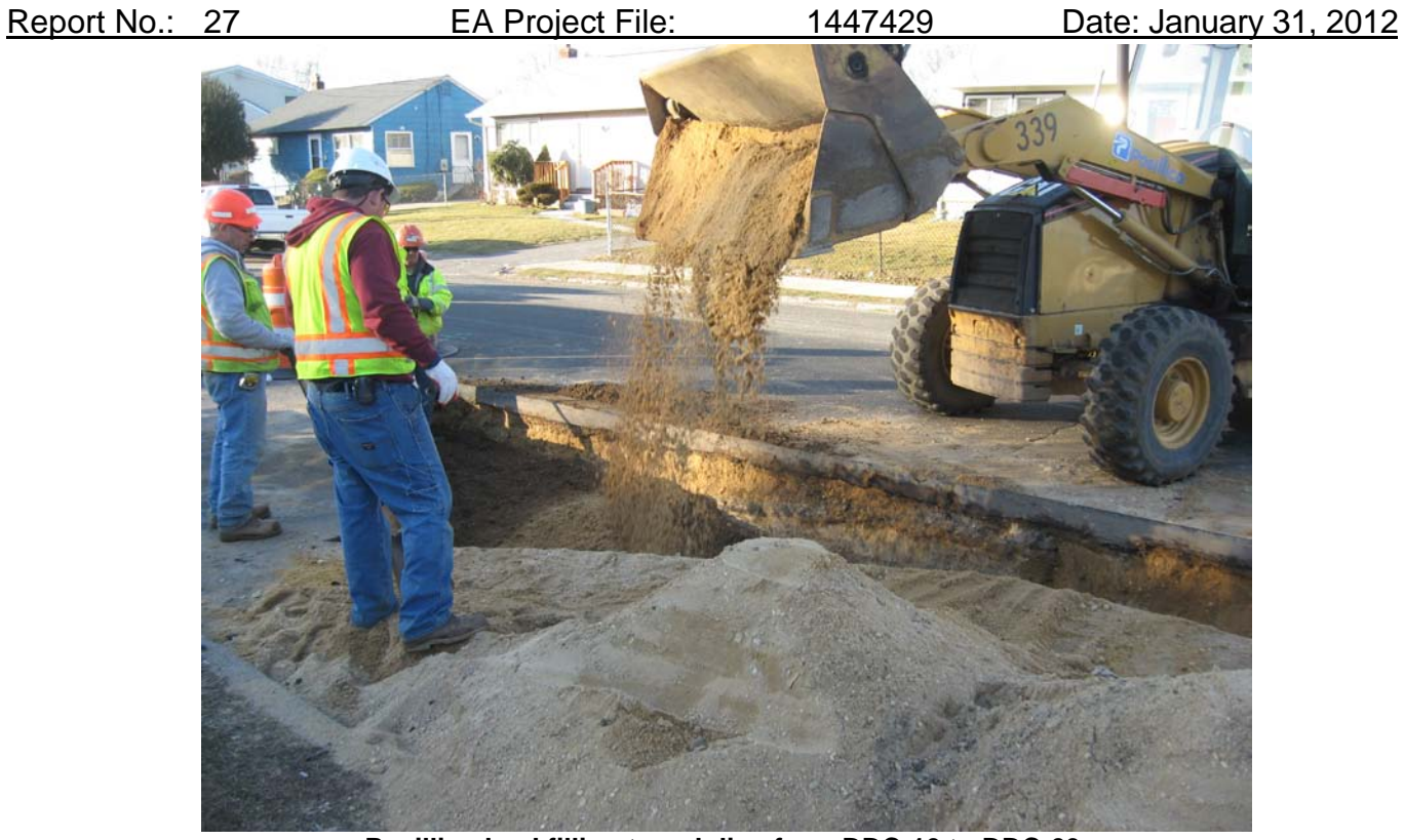
Posillico backfilling trench line from DDC-10 to DDC-09.