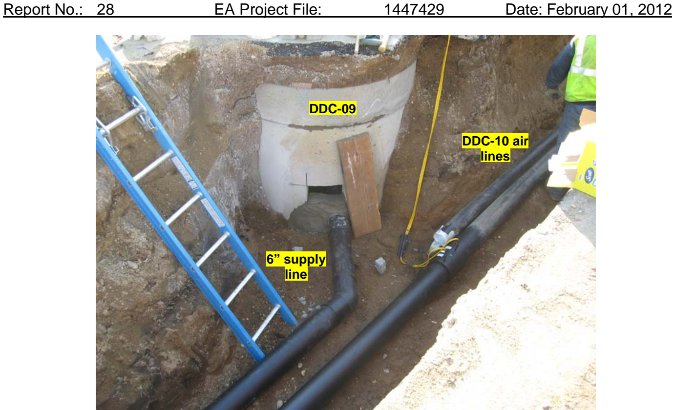
View of 6 in. air supply line inserted into DDC-09 vault.