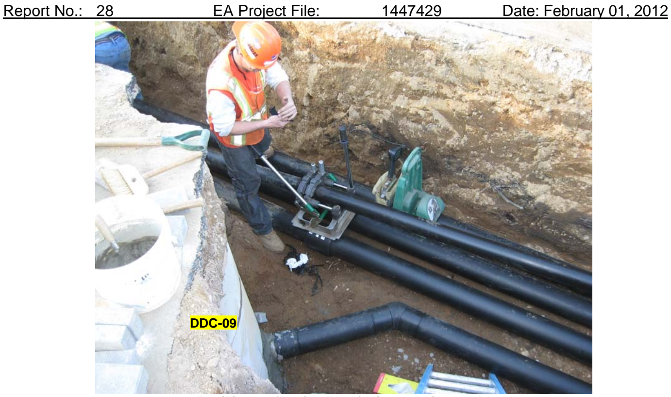
Posillico performing heat fusion weld in trench.