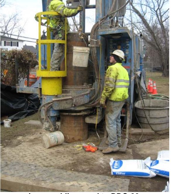
Layne adding sand to DDC-06.