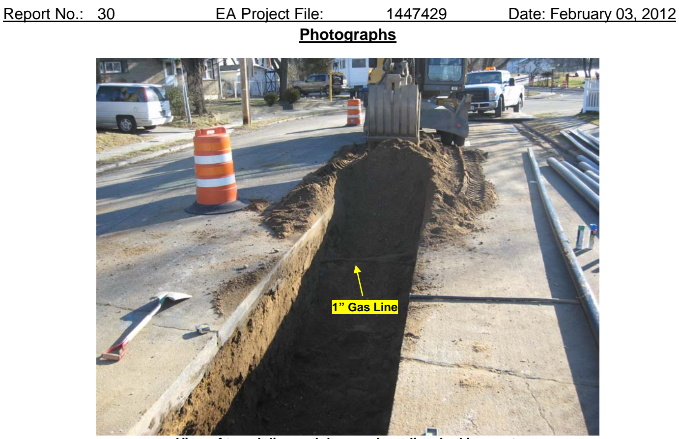
View of trench line and damaged gas line, looking east.