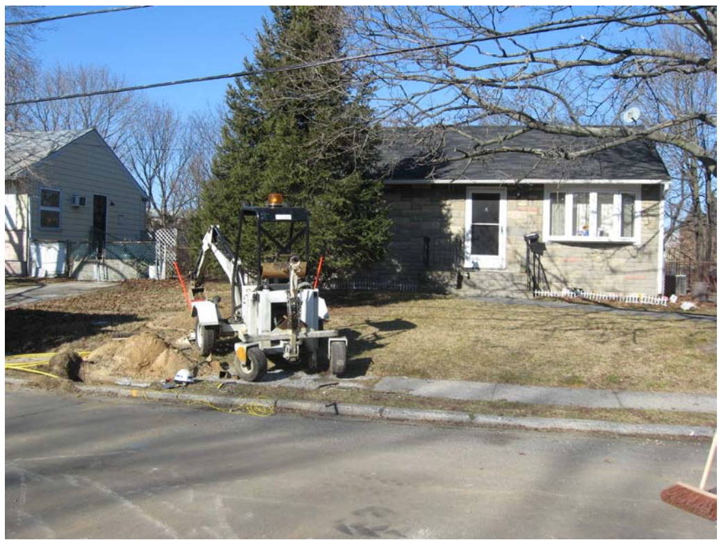
National Grid excavating point of separation at 6 Benjoe Dr., looking north.