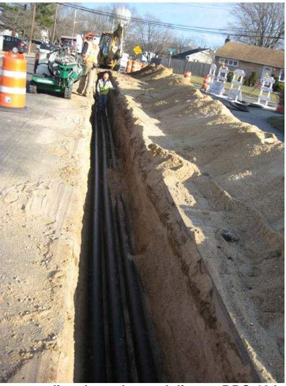
HDPE piping extending through trench line, at DDC-10 looking east.