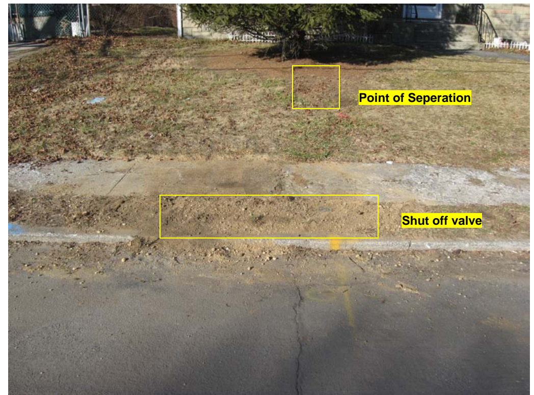
Backfilled point of separation and shut off valve excavation areas, looking north at 6 Benjoe Dr.