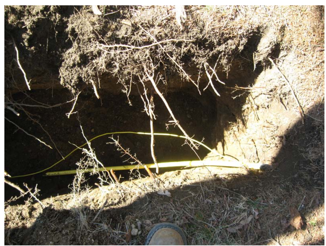
View of replaced gas line at point of separation.