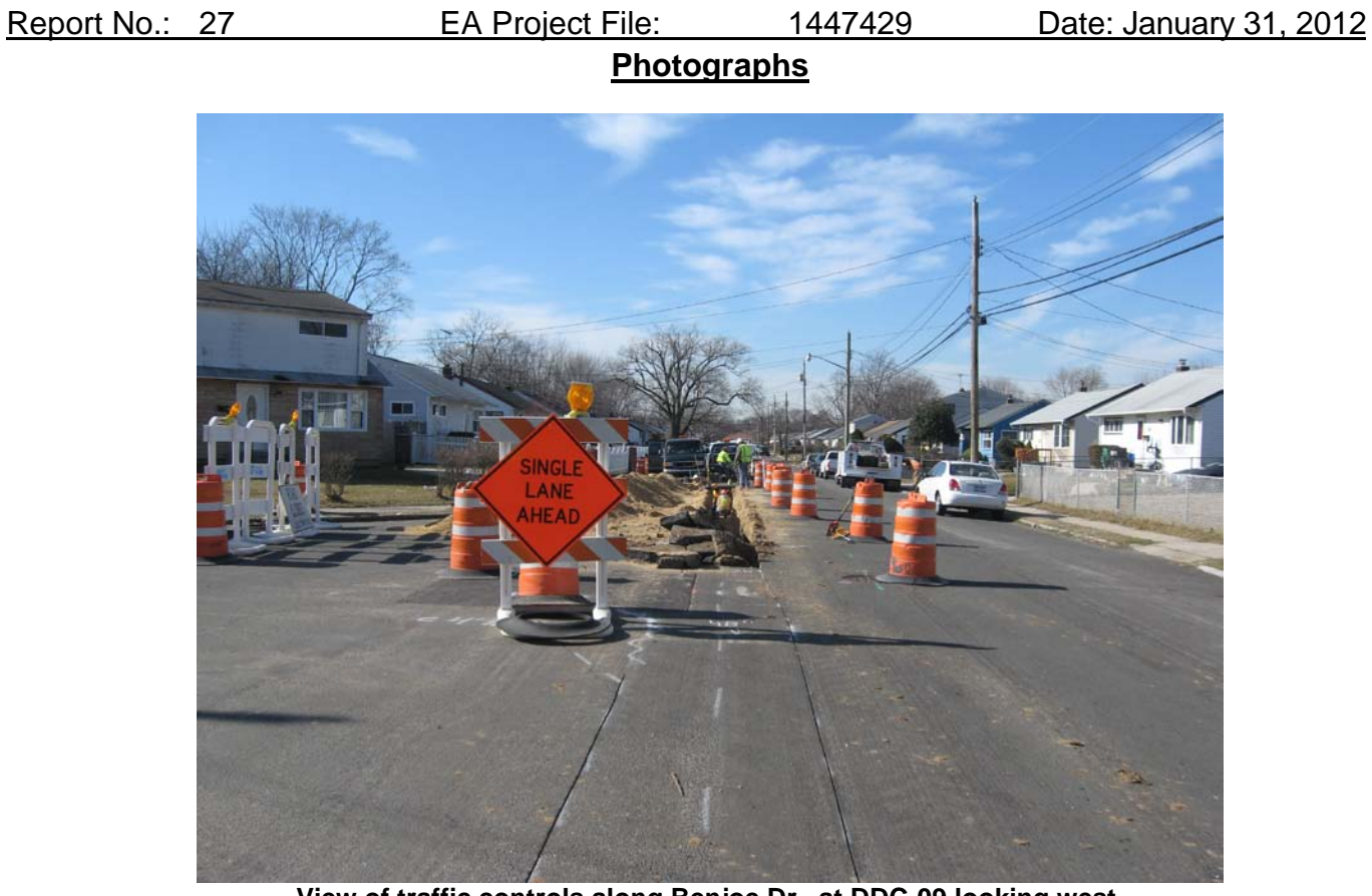
View of traffic controls along Benjoe Dr., at DDC-09 looking west.