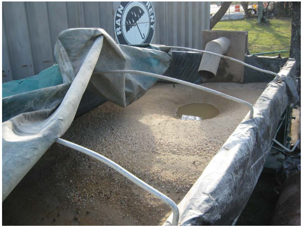
View of drill cuttings from DDC-06.