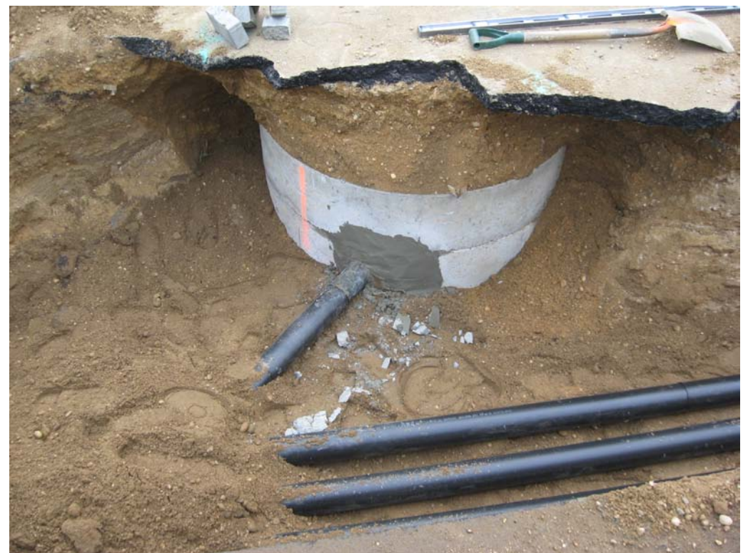
View of 4" air line attached to DDC-08 vault.