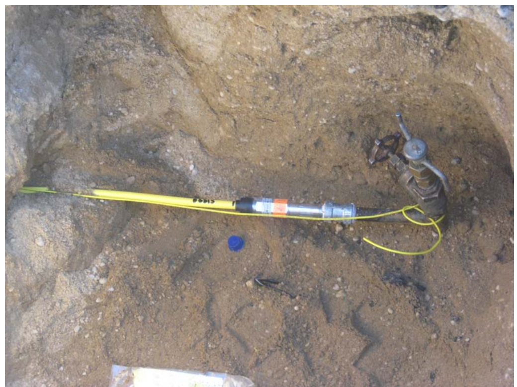
View of replaced 1 in. gas line at 4 in. main connection point.