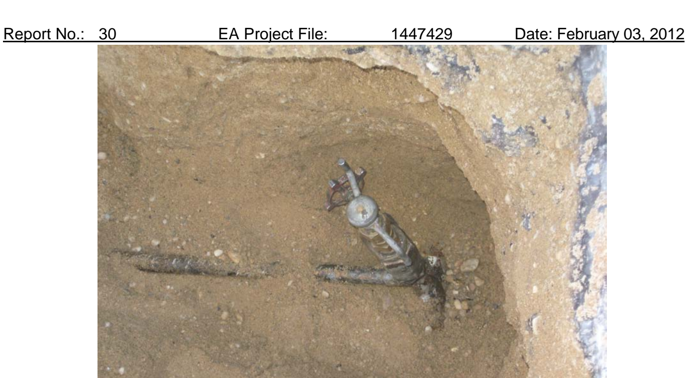
View of 1 and 4 in. gas line connection points with shut off valve.