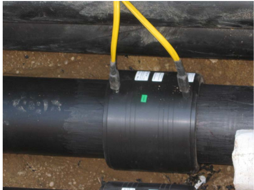
View of Type A Coupling and yellow electrofusion probes.