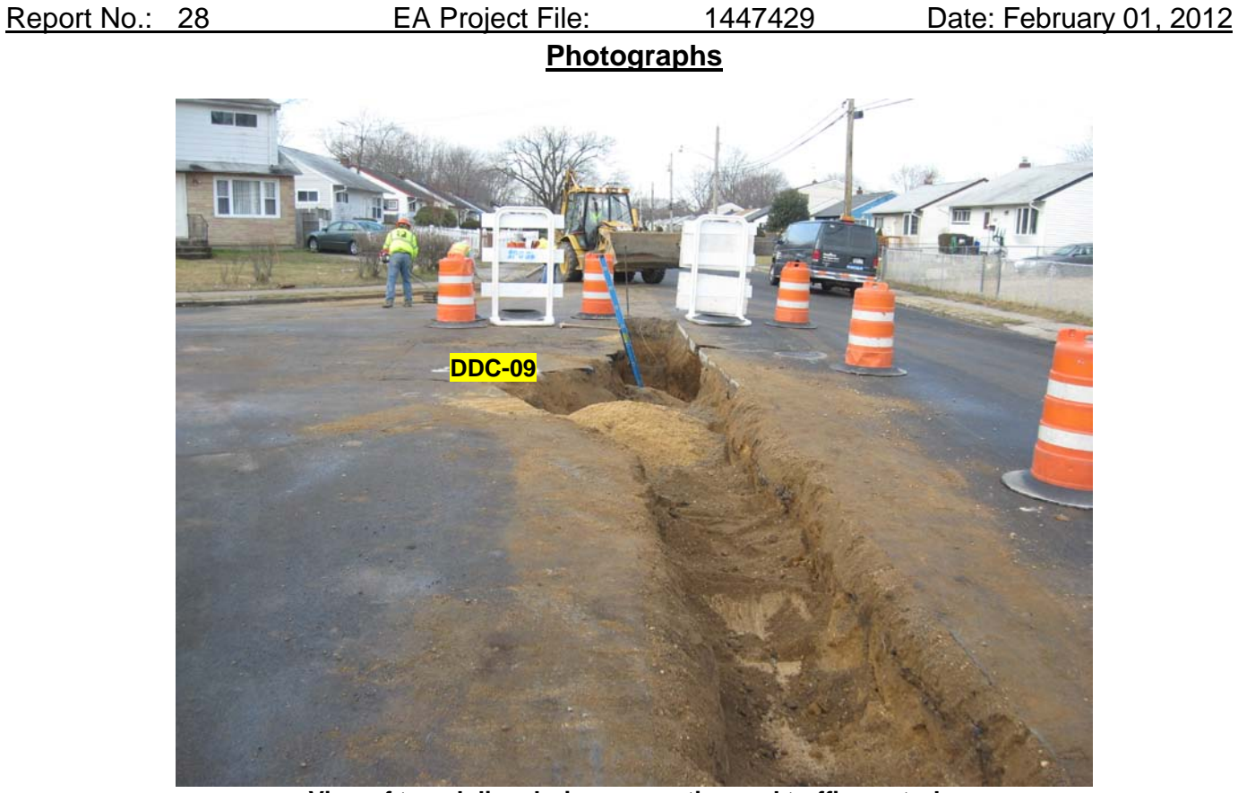
View of trench line during excavation and traffic controls.