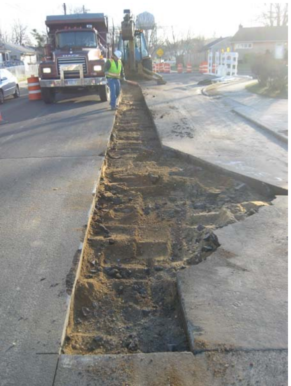
Posillico removing asphalt from trench line, at DDC-10 looking east.