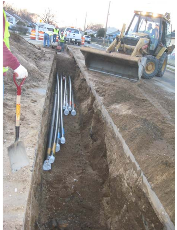
HDPE air lines extending through trench line, at DDC-08 looking west.