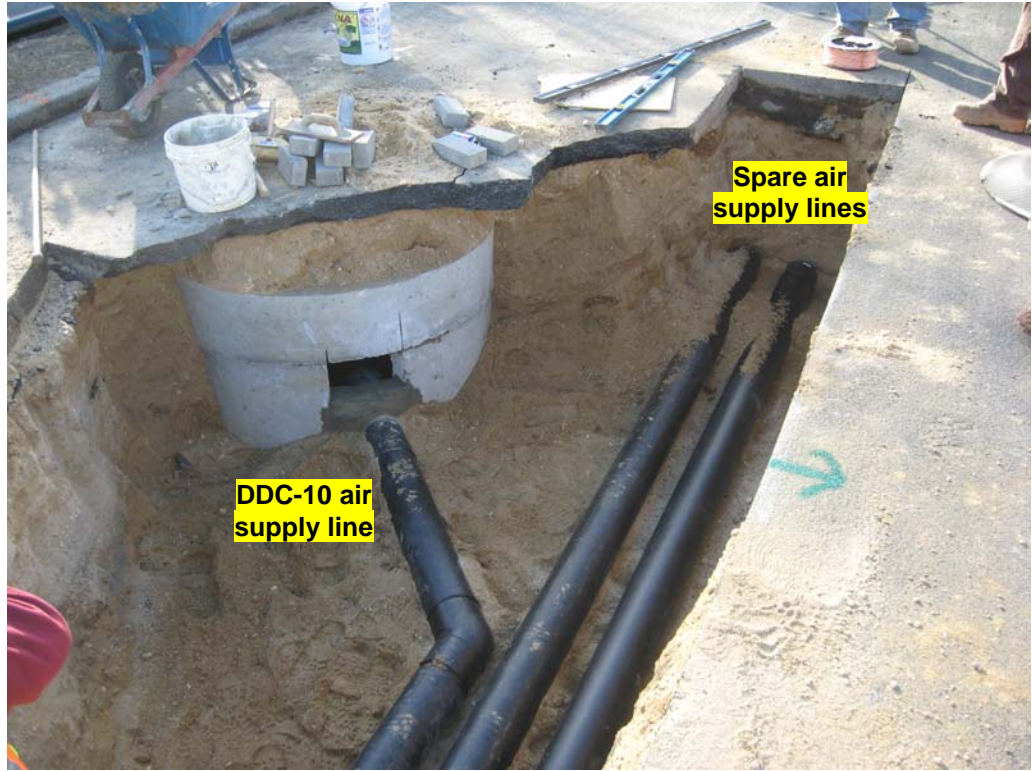
View of 6 in. supply lines at DDC-10 (one at DDC-10, two spares).