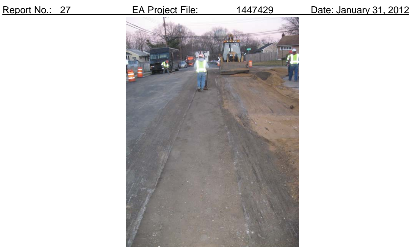
Posillico compacting crushed concrete at grade for road use.