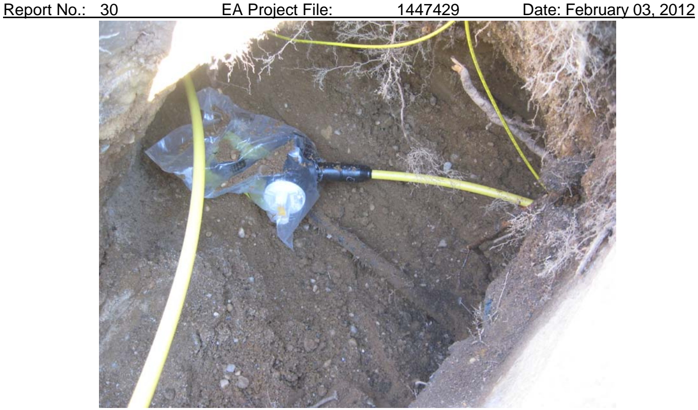
View of restored shut off valve on north side of Benjoe Dr.