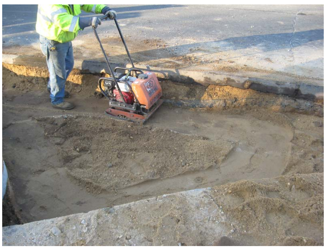
Posillico compacting native material near DDC-10.