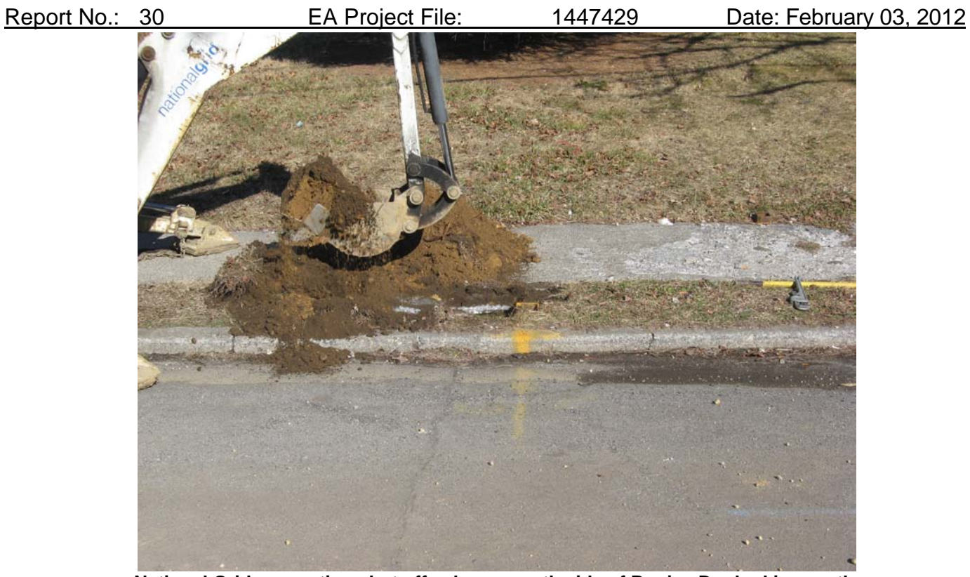
National Grid excavating shut off valve on north side of Benjoe Dr., looking north.