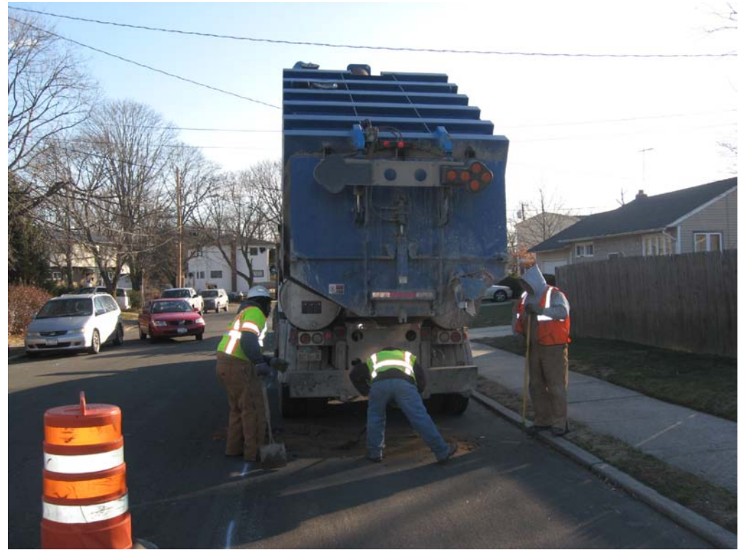
Posillico backfilling test hole via vacuum truck.

Test hole markouts (white circles) and 6-in. supply/return line markouts (white dash).