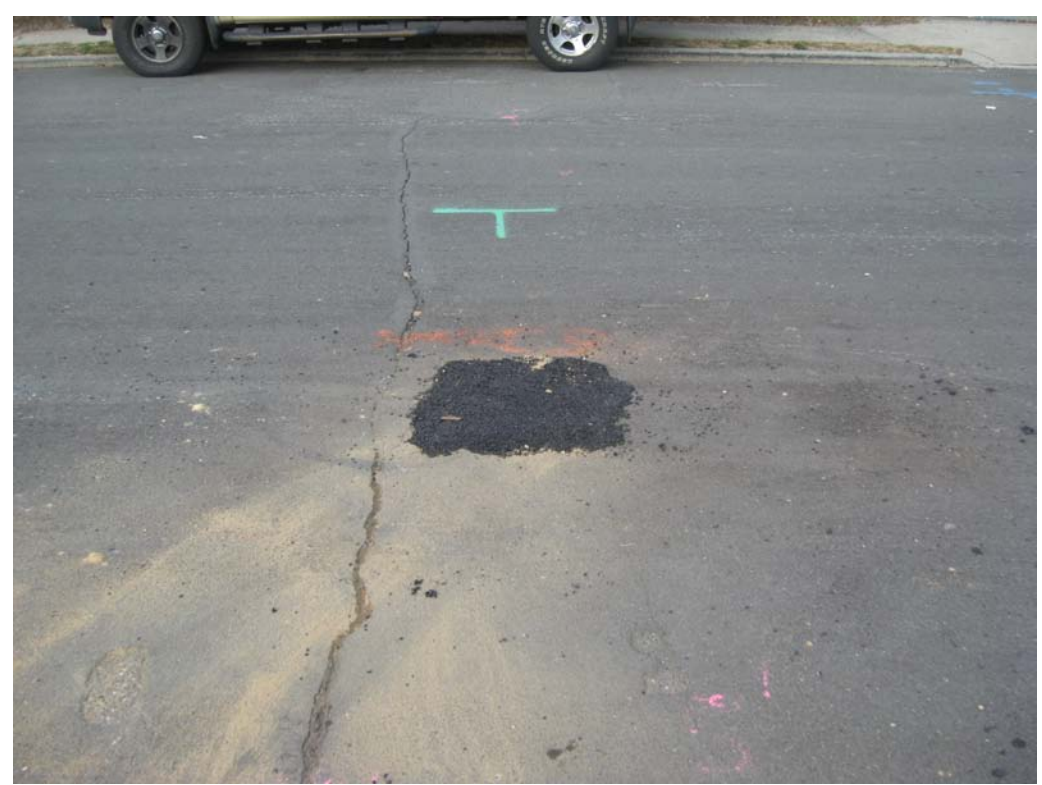
View of repaired test hole (asphalt patch).