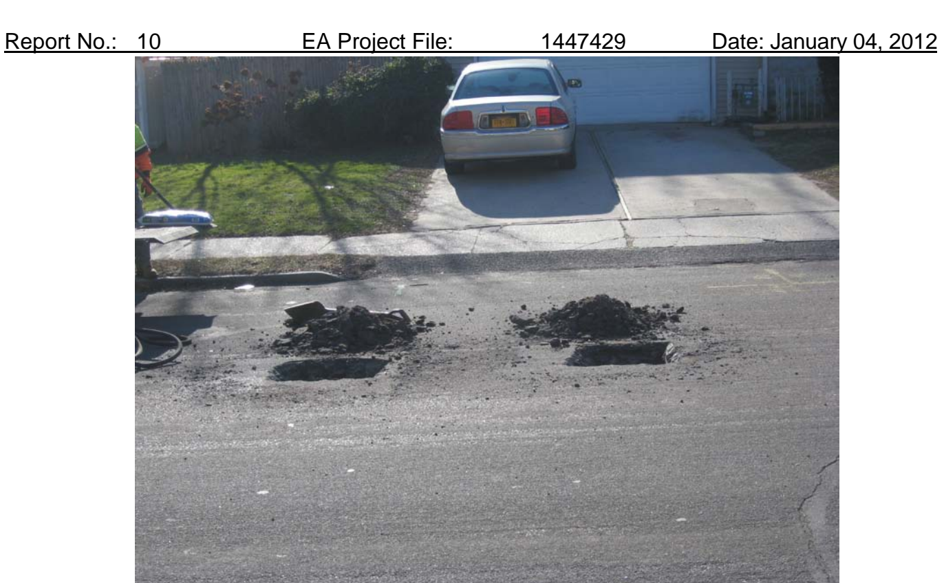
Asphalt removed from two test-hole locations via jack hammer.