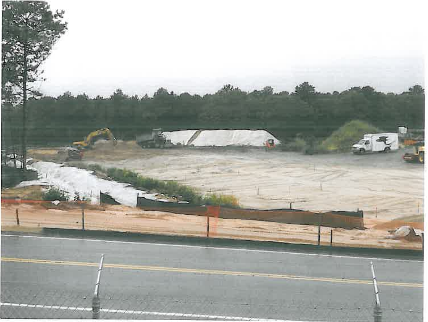
Photograph 4: View of Off-Site Backfilling

NOTE: All photographs were taken between September 15 and October 14, 2011.