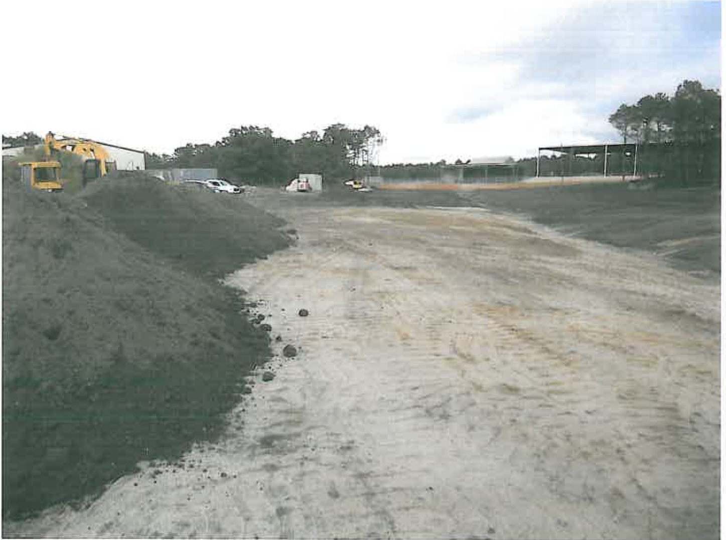
Photograph 6: Installing Top Soil on Off-Site Property

NOTE: All photographs were taken between September 15 and October 14, 2011.