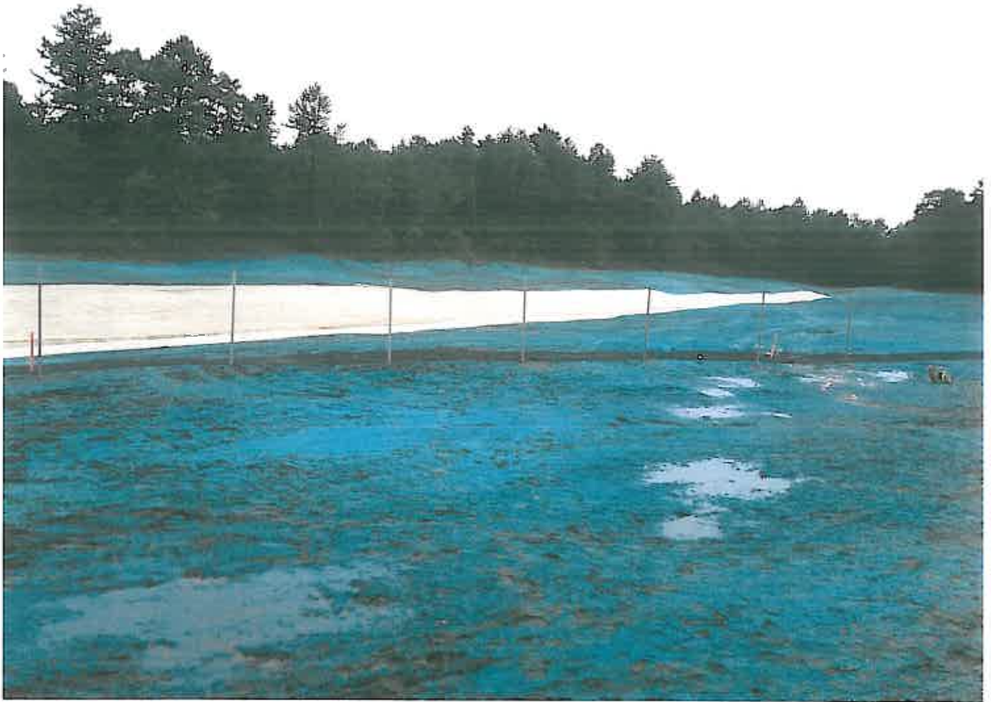
Photograph 8: Hydroseed and Erosion Blanket

NOTE: All photographs were taken between September 15 and October 14, 2011.