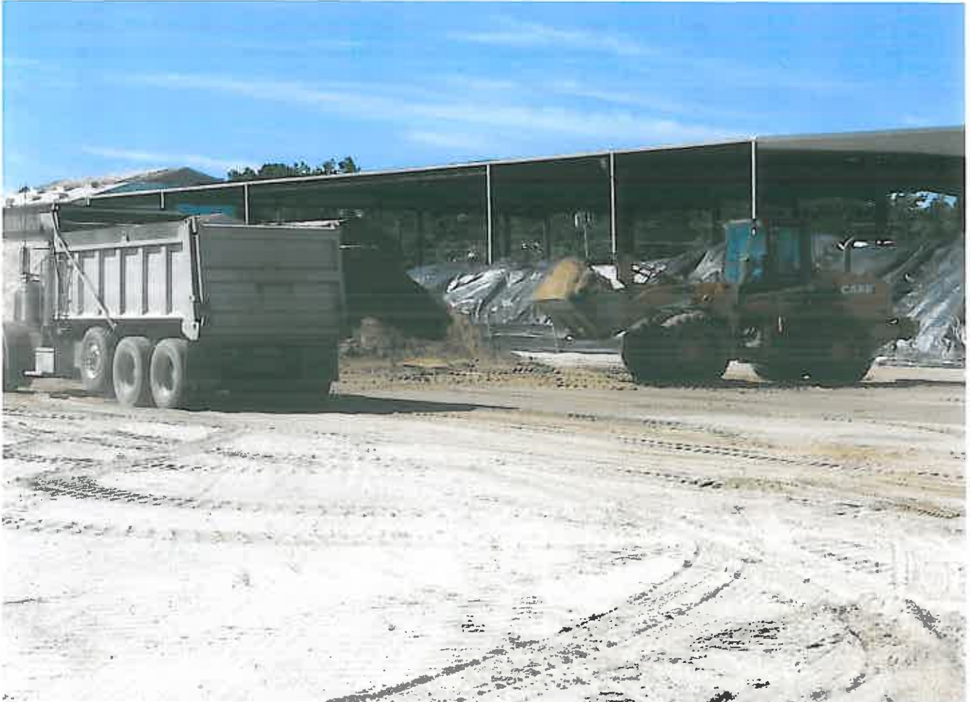
Photograph 1: Loading Fill From Stockpiles on East Property

NOTE: All photographs were taken between September 15 and October 14, 2011.