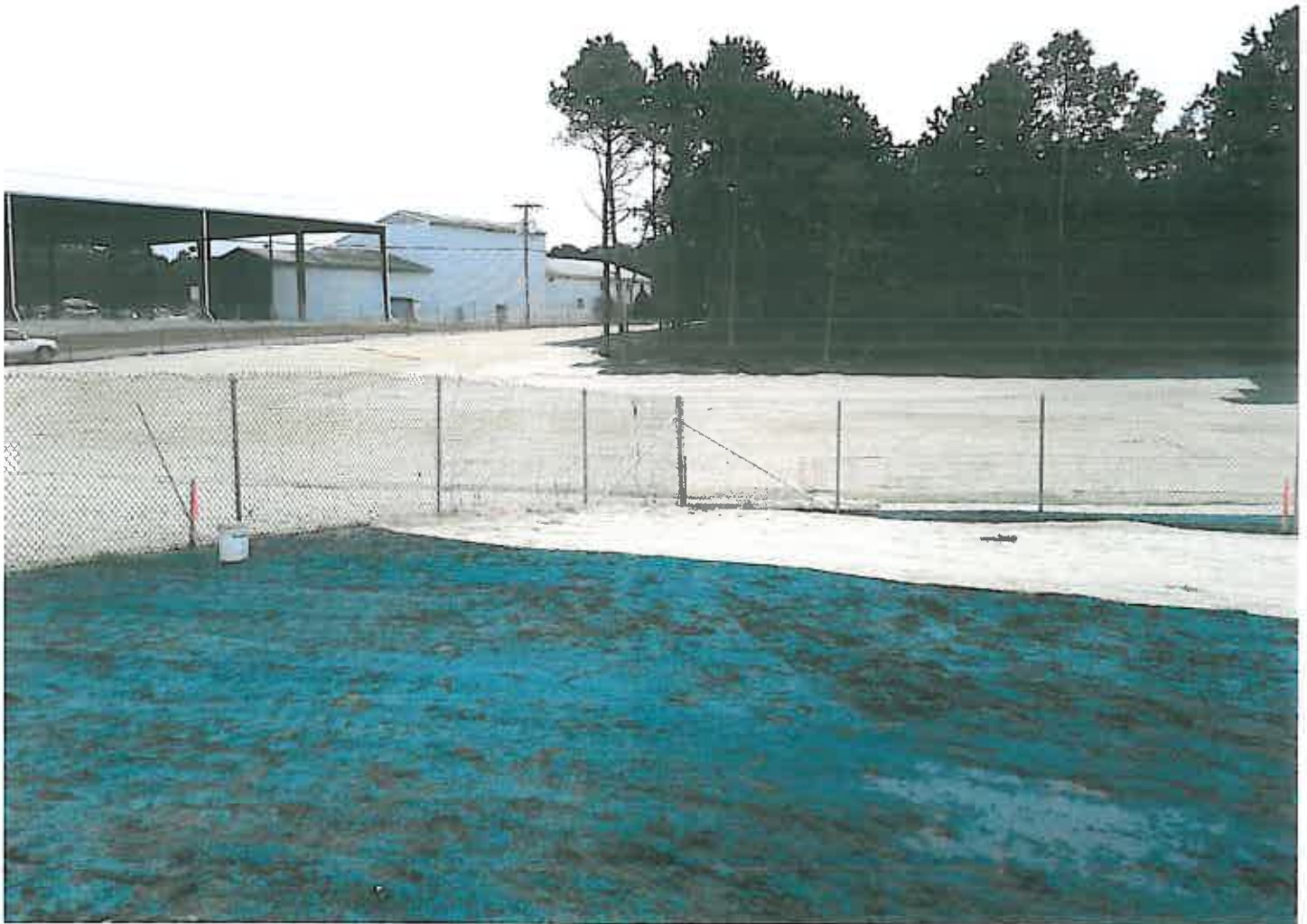
Photograph 7: Hydroseed and Erosion Blanket

NOTE: All photographs were taken between September 15 and October 14, 2011.