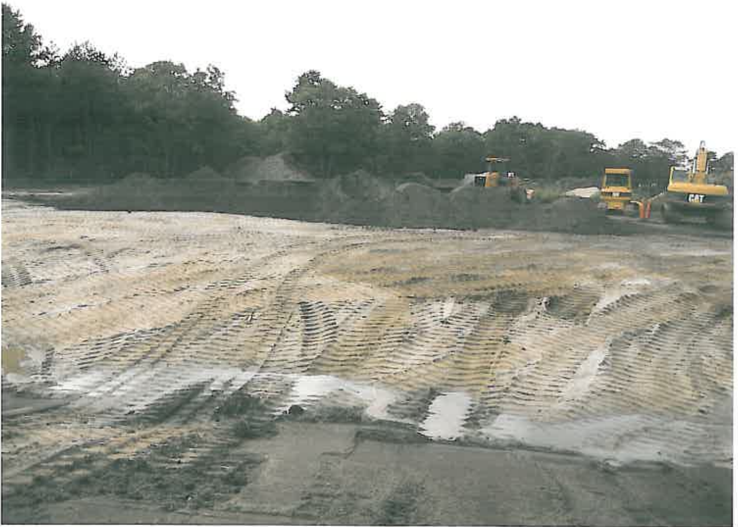
Photograph 5: Installing Top Soil on the Off-Site Property

NOTE: All photographs were taken between September 15 and October 14, 2011.