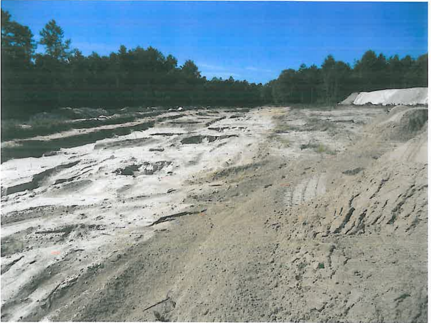
Photograph 2: View of Off-Site Property Prior to Backfilling

NOTE: All photographs were taken between September 15 and October 14, 2011.