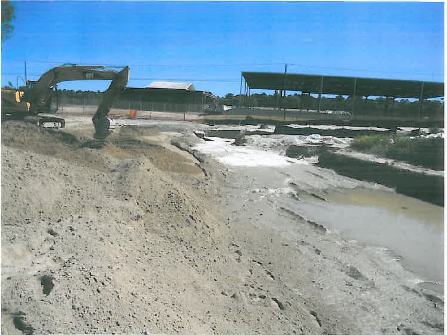
Photograph 3: Backfilling of Off-Site Property

NOTE: All photographs were taken between September 15 and October 14, 2011.