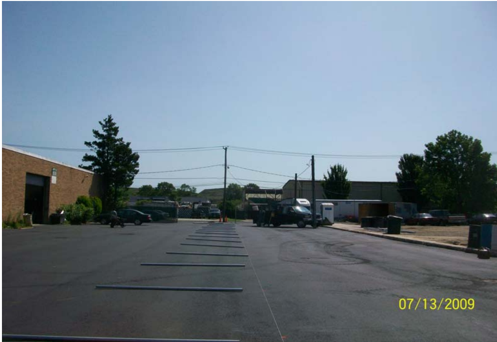
100_0953.jpg - Setting up fence posts between 50 and 60 Dale St.