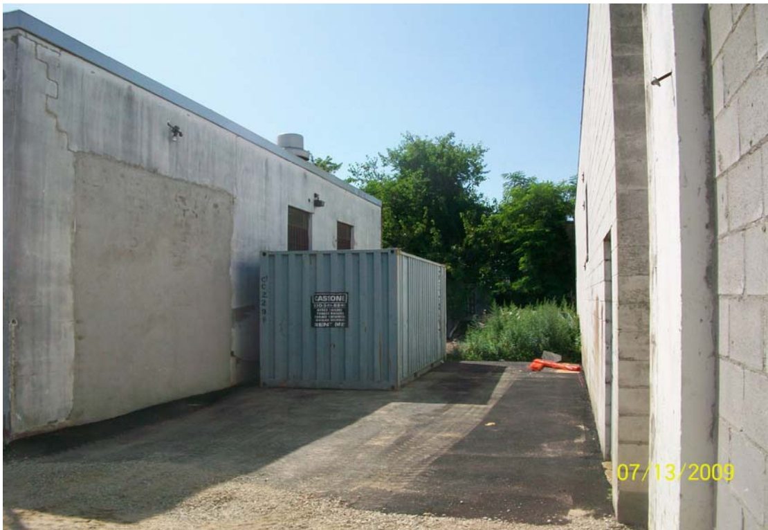
100_0954.jpg - 40 Dale St. container moved back to its original location in the south alley