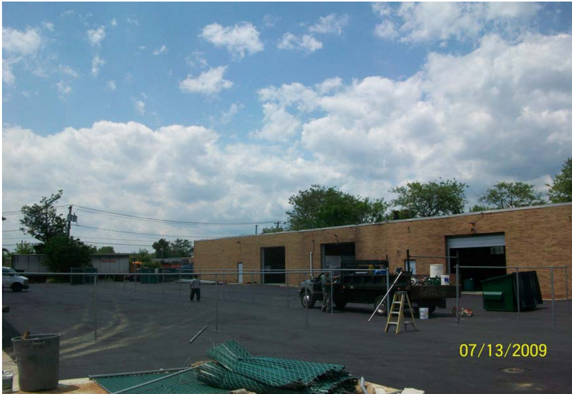
100_0955.jpg - Fence post and top rails being installed, 61 Cabot St. in background