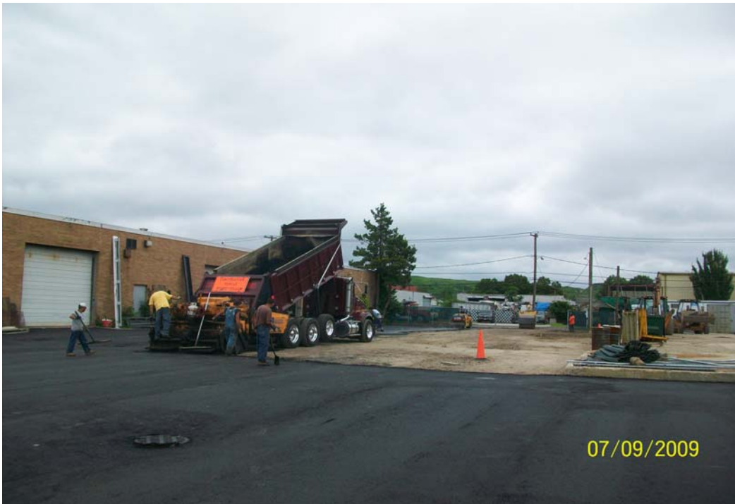
100_0945.jpg - Accurate Blacktop starting to pave the 2" binder course at 60 Dale St.