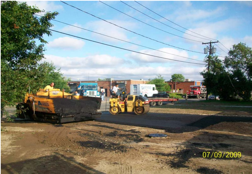
100_0942.jpg - Accurate Blacktop starting to pave the 2' binder course at 61 Cabot St.