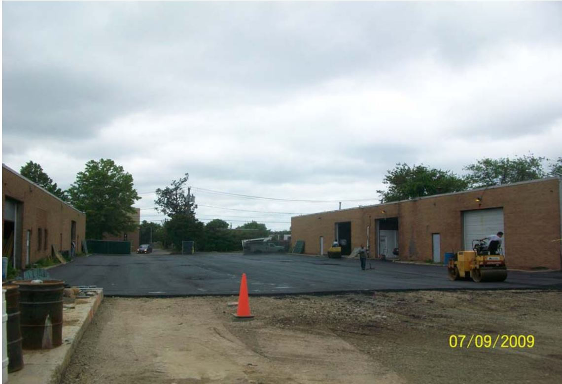
100_0944.jpg - Accurate Blacktop finished paving the 2" binder course at 51 and 61 Cabot St.