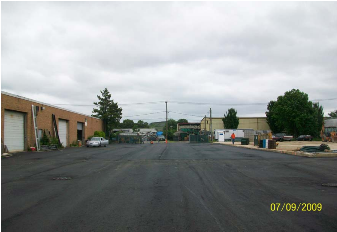
100_0947.jpg - Accurate finished paving the binder course, looking east