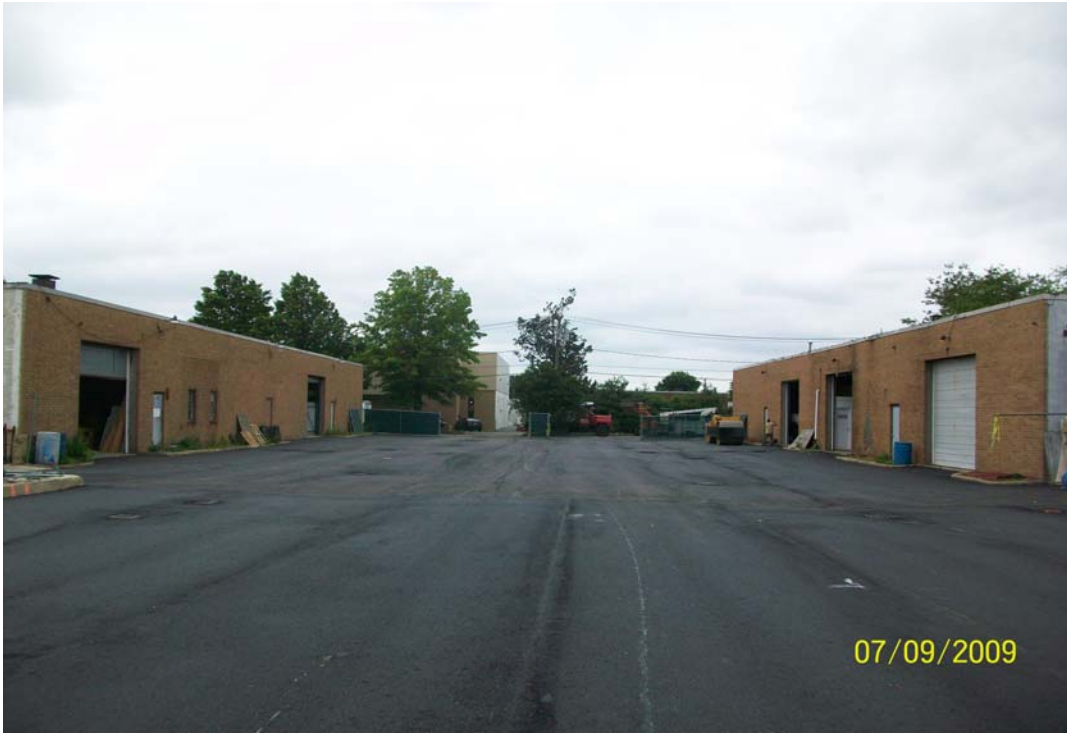
100_0946.jpg - Accurate Blacktop finished paving the 2" course, looking west