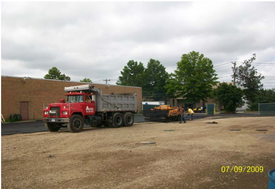
100_0943.jpg - Accurate Blacktop paving the 2" binder course at 51 Cabot St.