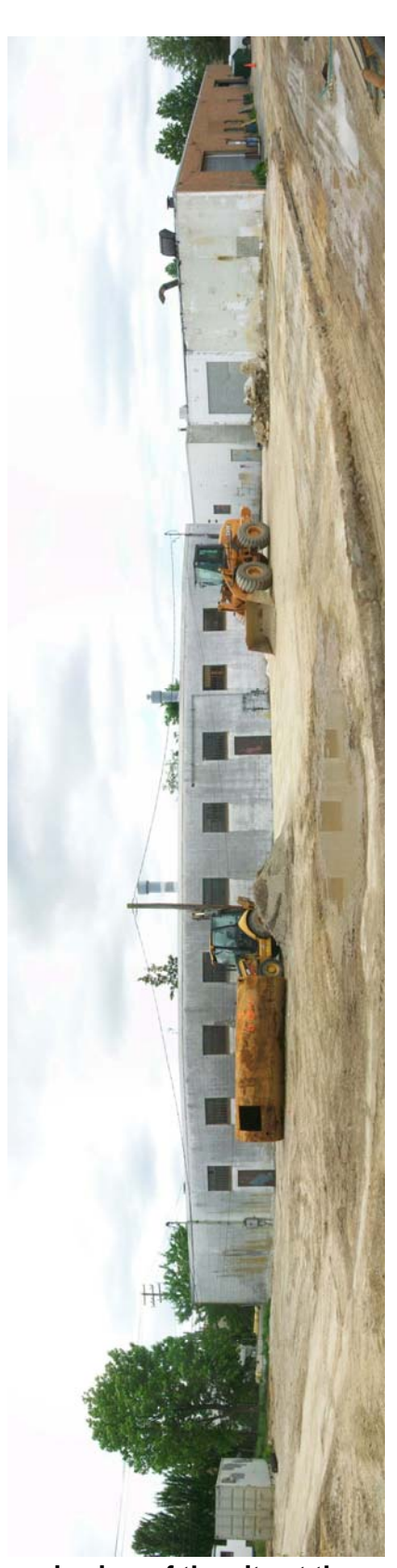
100 0857.jpg-Panoramic view of the site at the end of the day, looking south