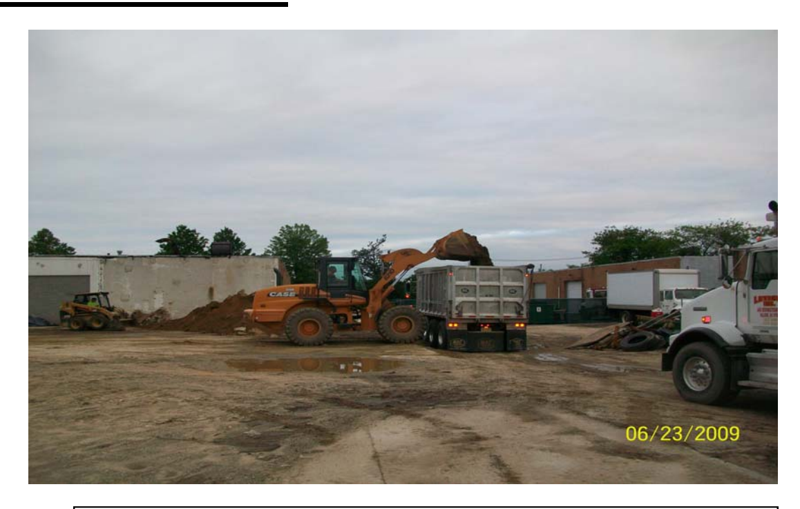
100_0853.jpg - Loading hazardous waste soil into Leticia dump truck