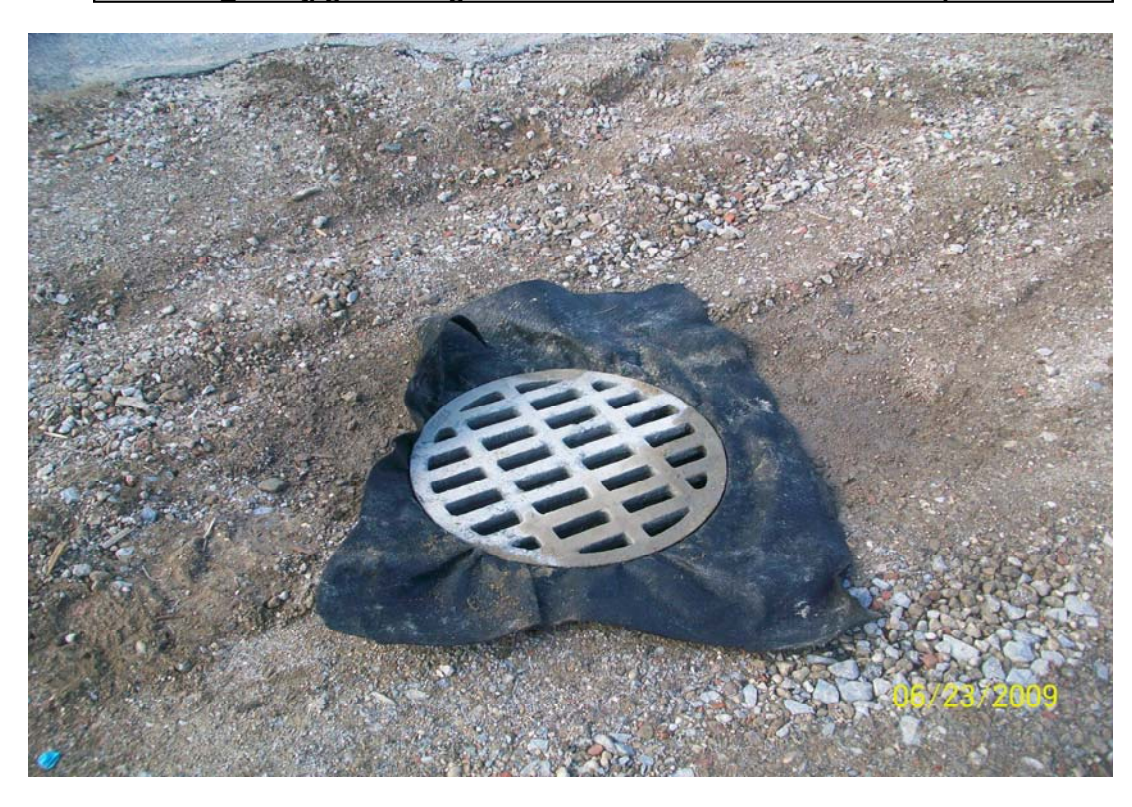
100 0854.jpg - New filter fabric installed on new drainage structure cover