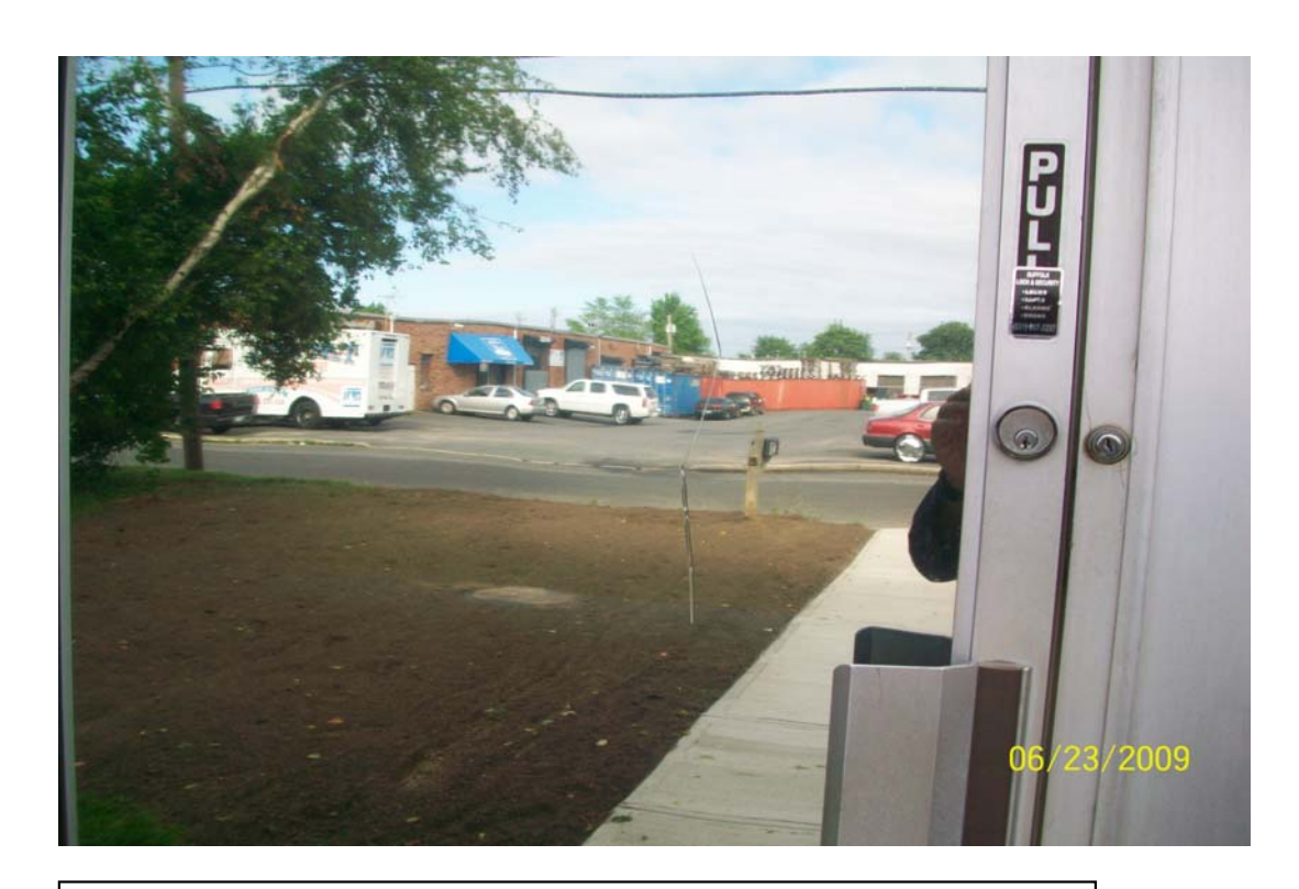
100_0855.jpg - Cracked glass on front door of 61 Cabot St.