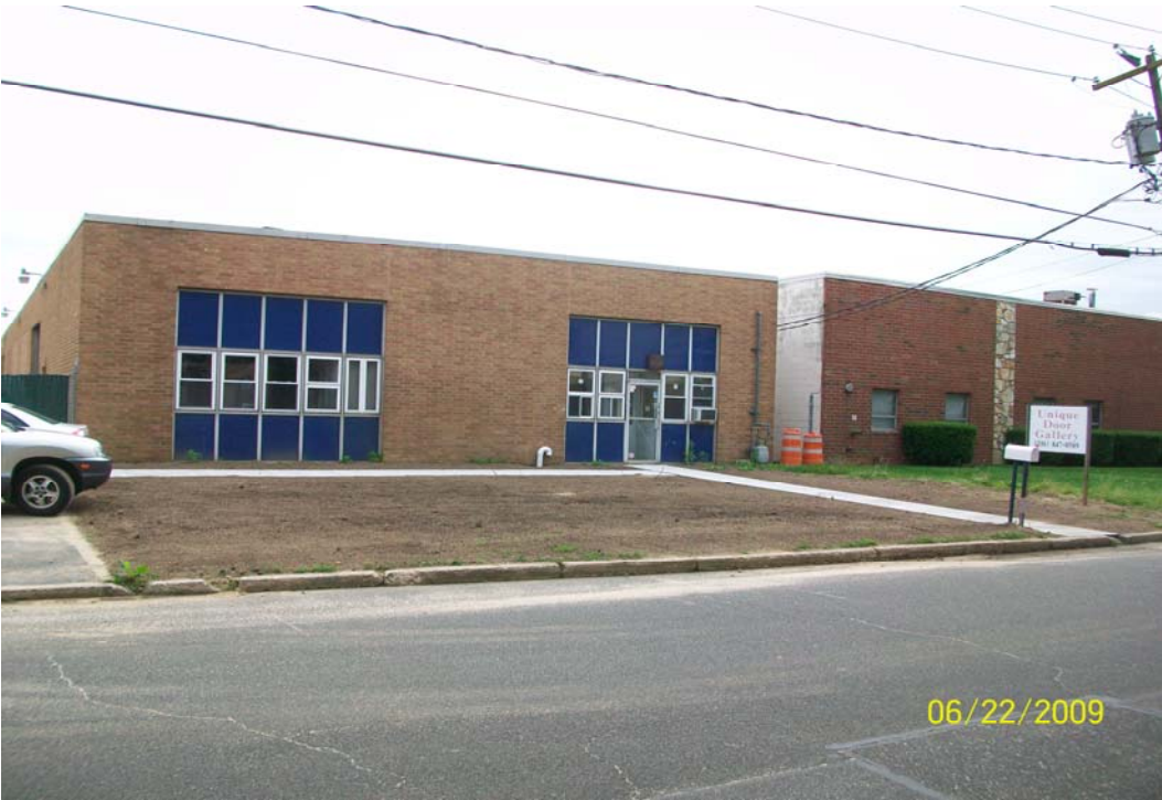
100_0850.jpg - Finished site restoration in front of 51 Cabot St.