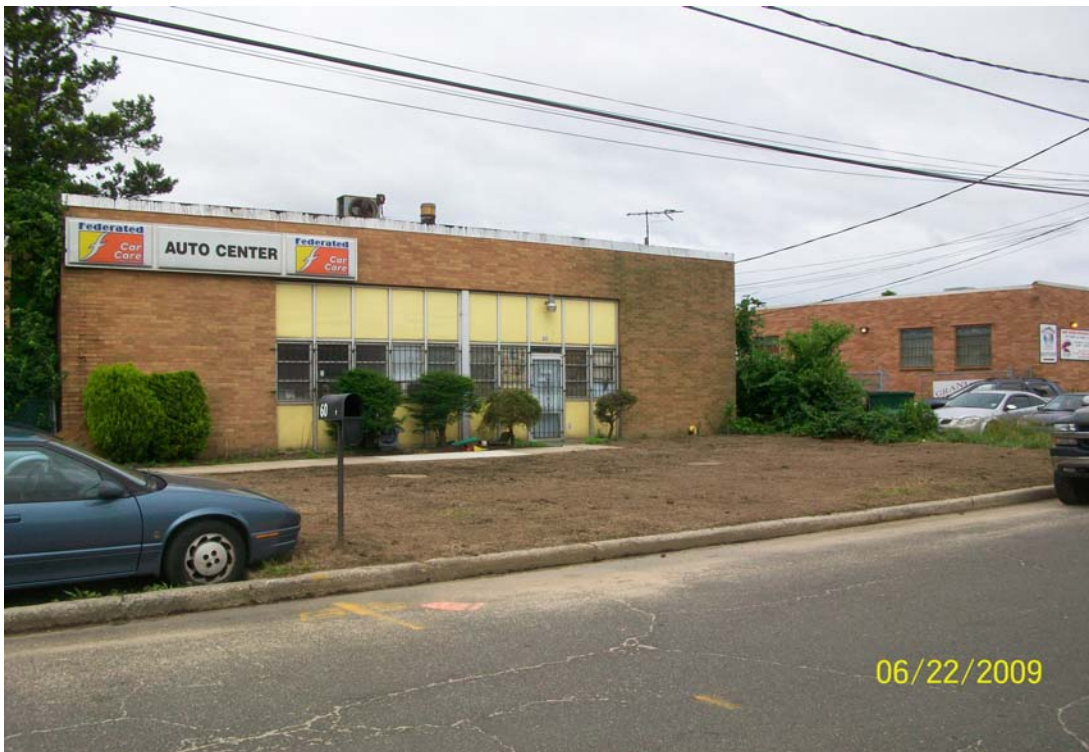
100_0852.jpg - Finished site restoration in front of 60 Dale St.