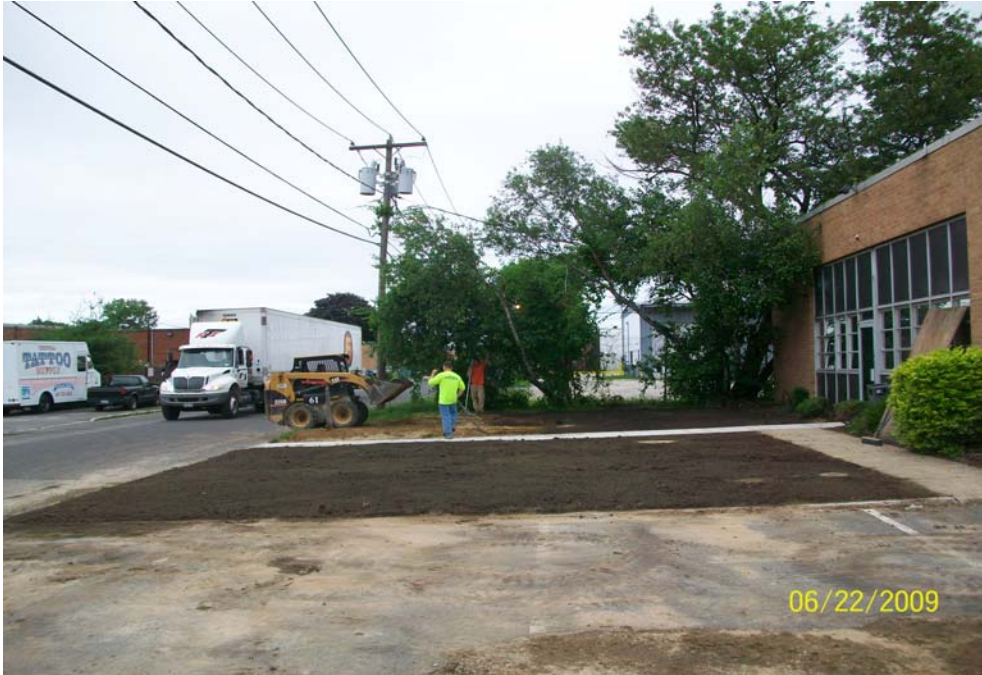
100_0847.jpg - Spreading topsoil in front of 61 Cabot St.