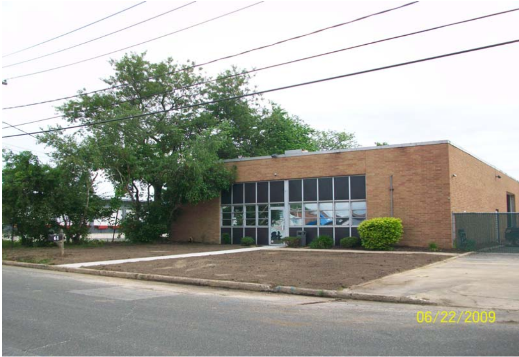
100_0851.jpg - Finished site restoration in front of 61 Cabot St.