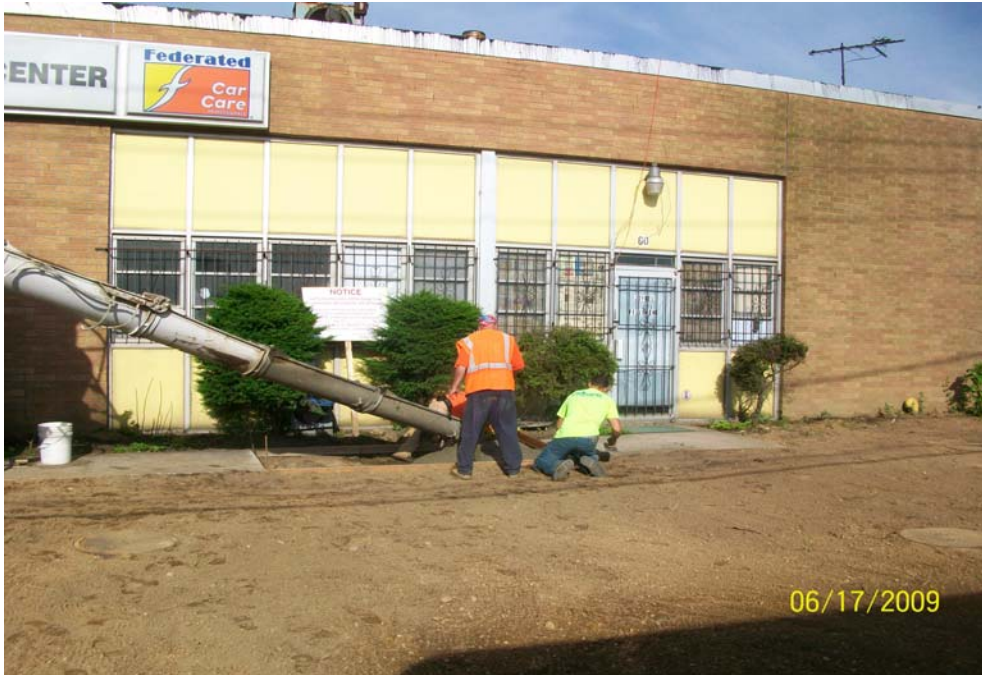
100_0837.jpg - Pouring concrete for replacement sidewalk in front of 60 Dale St.