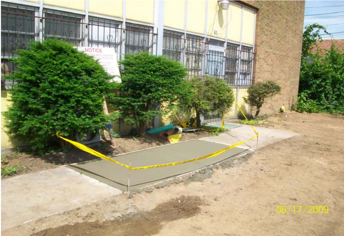
100_0839.jpg - Finished replacement sidewalk in front of 60 Dale St.