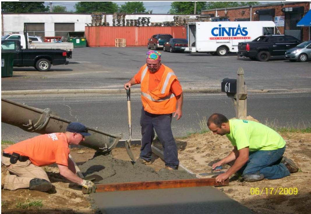
100_0838.jpg - Pouring concrete for replacement sidewalk in front of 61 Cabot St.