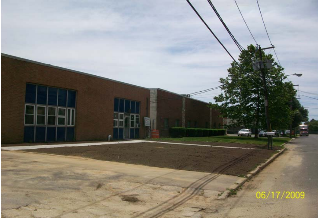
100-0841.jpg - Finished applying topsoil (but not seed) to the front of 51 Cabot St.