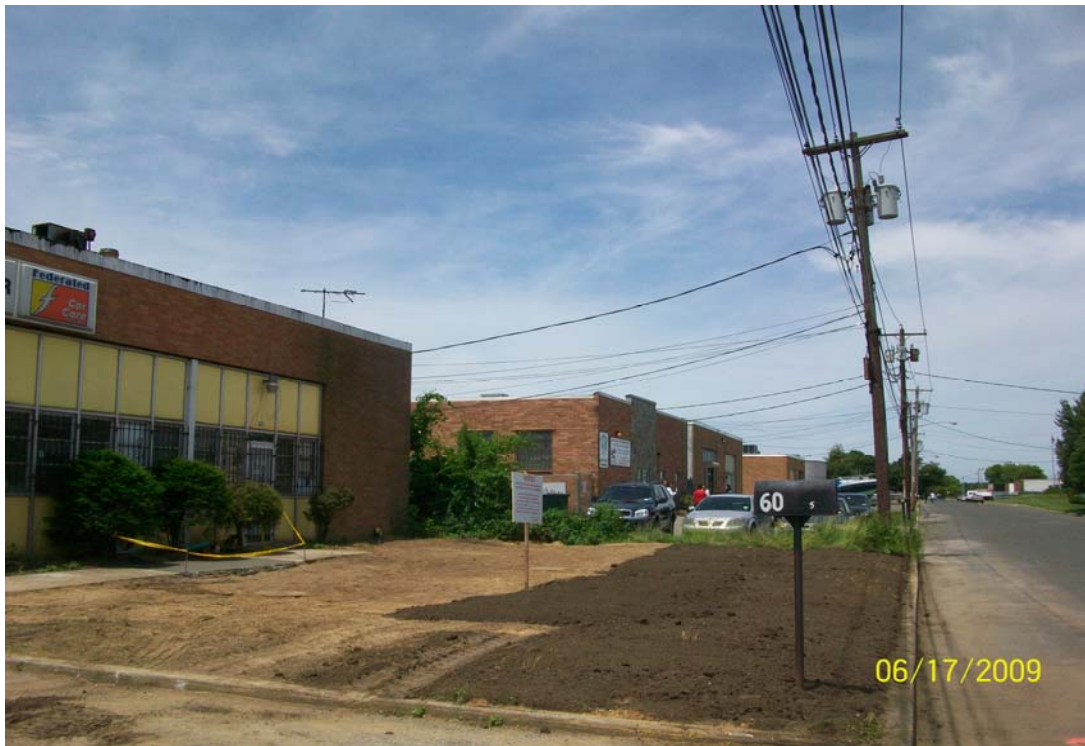
100_0842.jpg - Partially applied topsoil (but not seed) to the front of 60 Dale St.