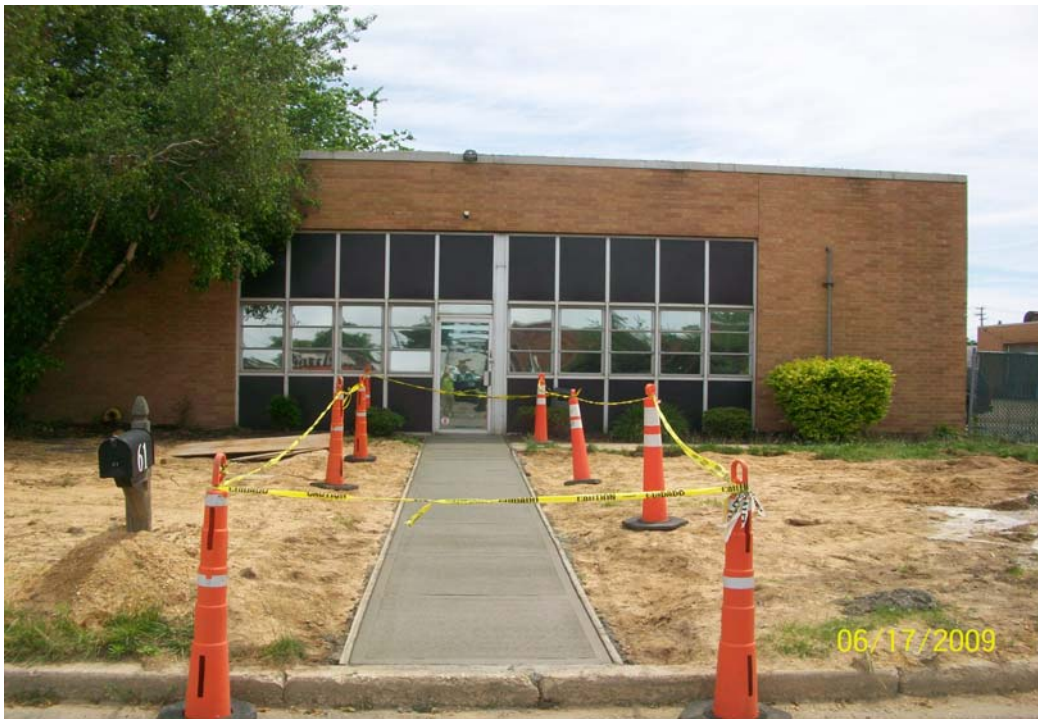
100_0840.jpg - Finished replacement sidewalk in front of 61 Cabot St.