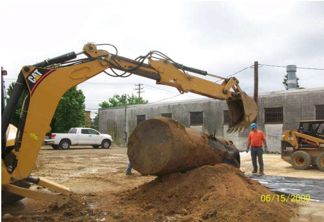
100_0821.jpg - UST-5 out of the excavation