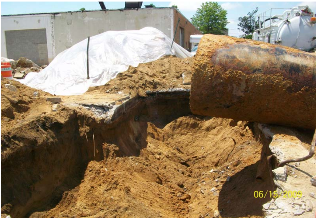
100_0825.jpg - UST-9 out of the excavation