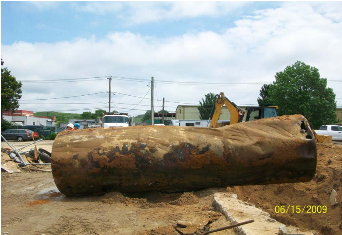
UST-9 out of the excavation