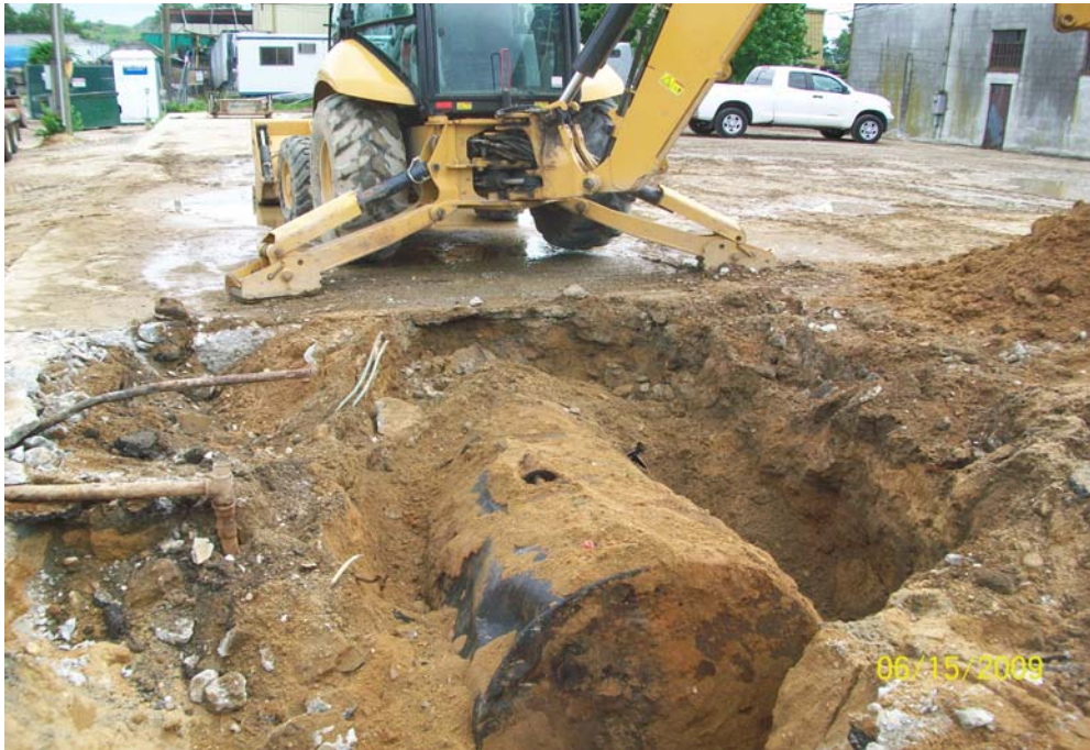
100_0820.jpg - Removing UST-5 from the excavation