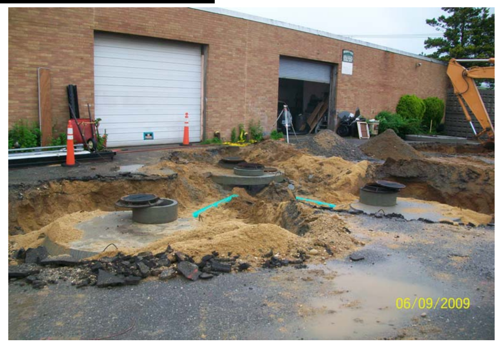
100_0781.jpg - Septic system #5, 60 Dale St., ready for inspection