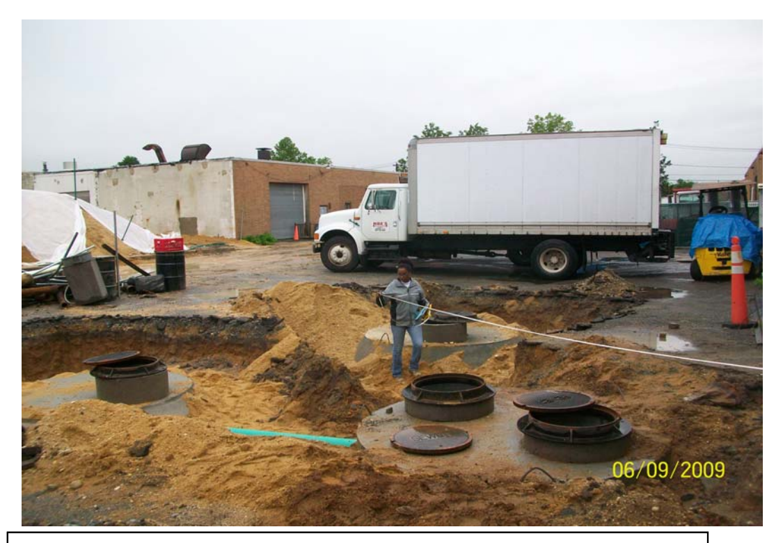
100_0783.jpg - M.Perez (SCDHS) inspecting septic system #5, 60 Dale St.