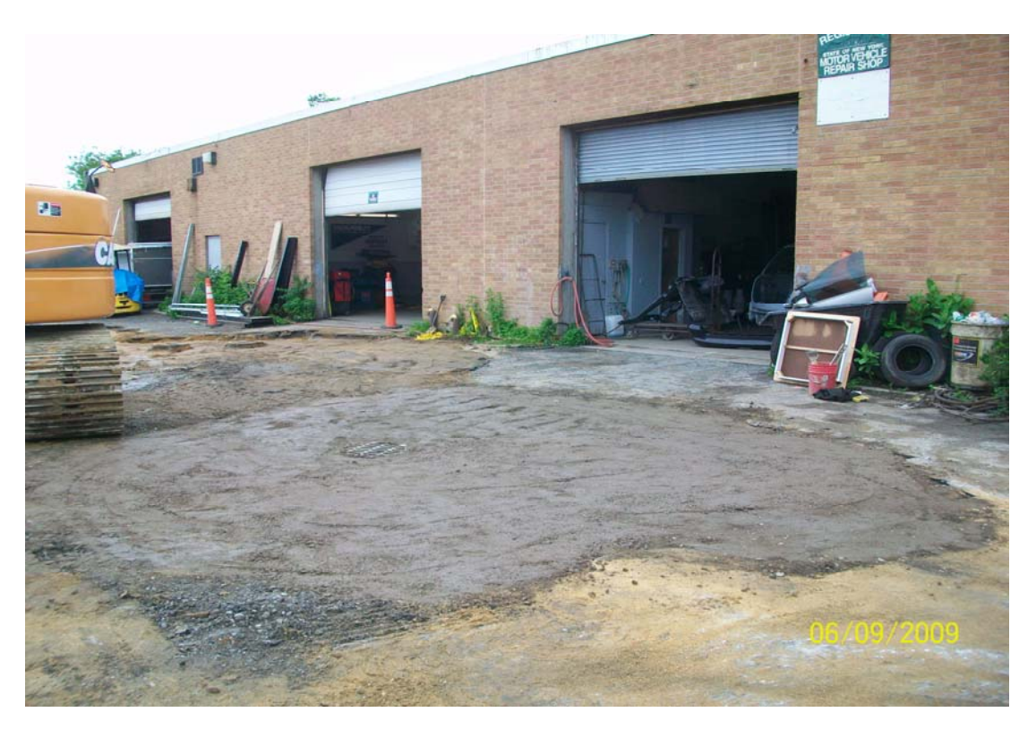
100_0786.jpg - PDS-9, 60 Dale St., completely backfilled