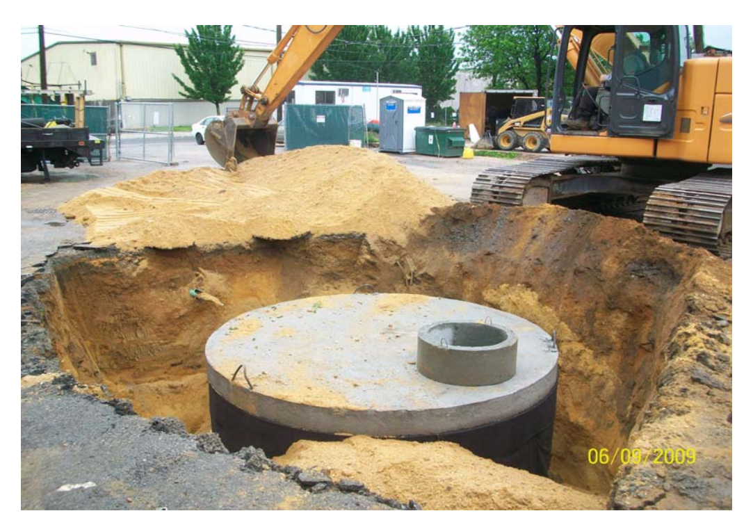
100_0785.jpg - PDS-9, 60 Dale St., being backfilled