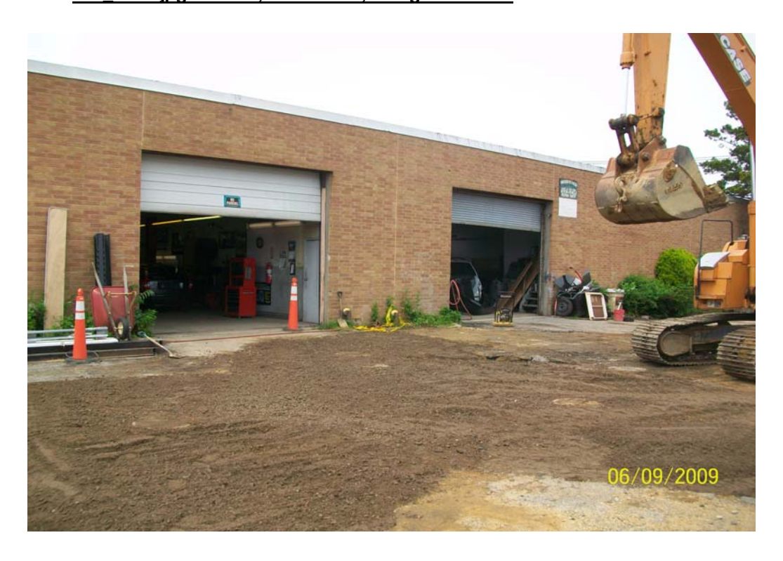
100 0787.jpg - Septic system #5, 60 Dale St., completely backfilled