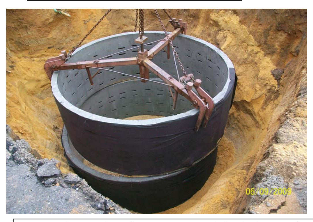
100_0782.jpg - Installing PDS-9 structures wrapped in filter fabric, 60 Dale St.