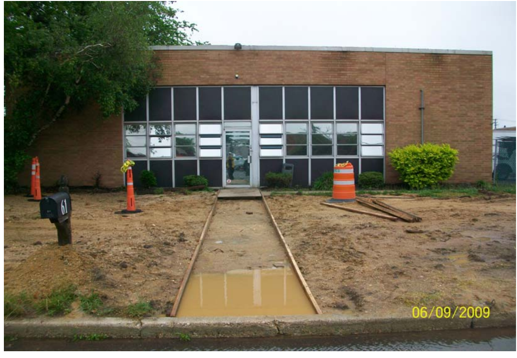
100_0784.jpg - Forms installed for replacement sidewalk in front of 61 Cabot St.