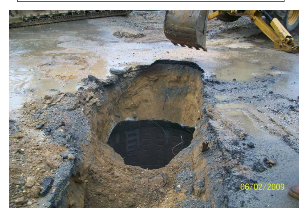
004.jpg - DS-6 partially abandoned, 61 Cabot St.