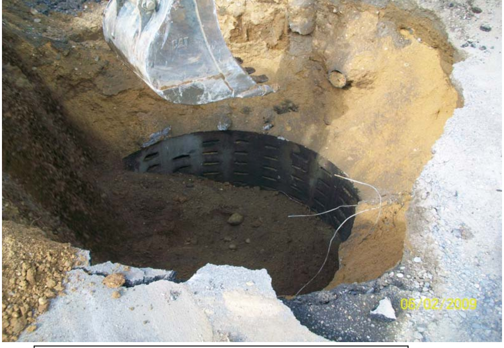
001.jpg - DS-3 partially abandoned, 51 Cabot St.