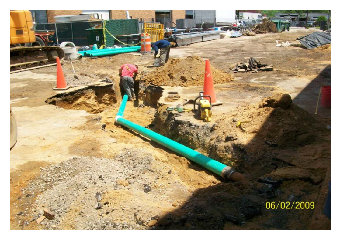
006.jpg - Roof drain #4, 51 Cabot St., connected to PDS-6