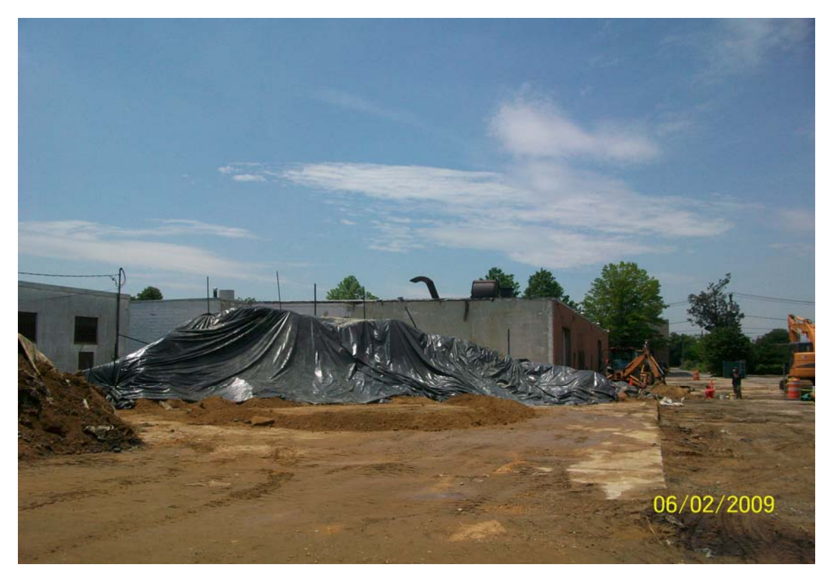
007.jpg - View of Mt. Spectrum at the end of the day