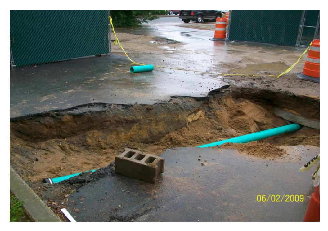
005.jpg - Roof drain #1, 51 Cabot St., connected to PDS-4