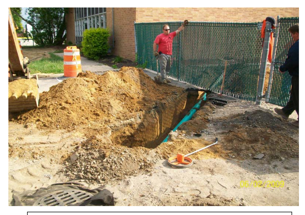
003.jpg - Roof drain #1, 61 Cabot St., connected to PDS-3 in foreground