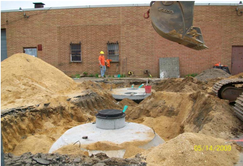
100_00609.jpg - PCP-3A in foreground with PST-3 in background