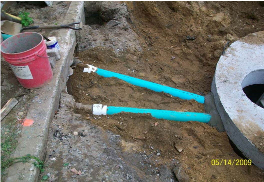
100_00607.jpg - Piping installed to PST-3