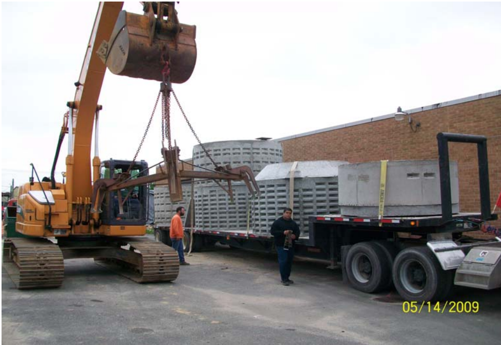
100_00601.jpg - Delivery of structures