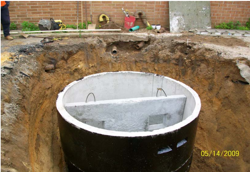
100_00605.jpg - PST-3 in place, 51 Cabot St.