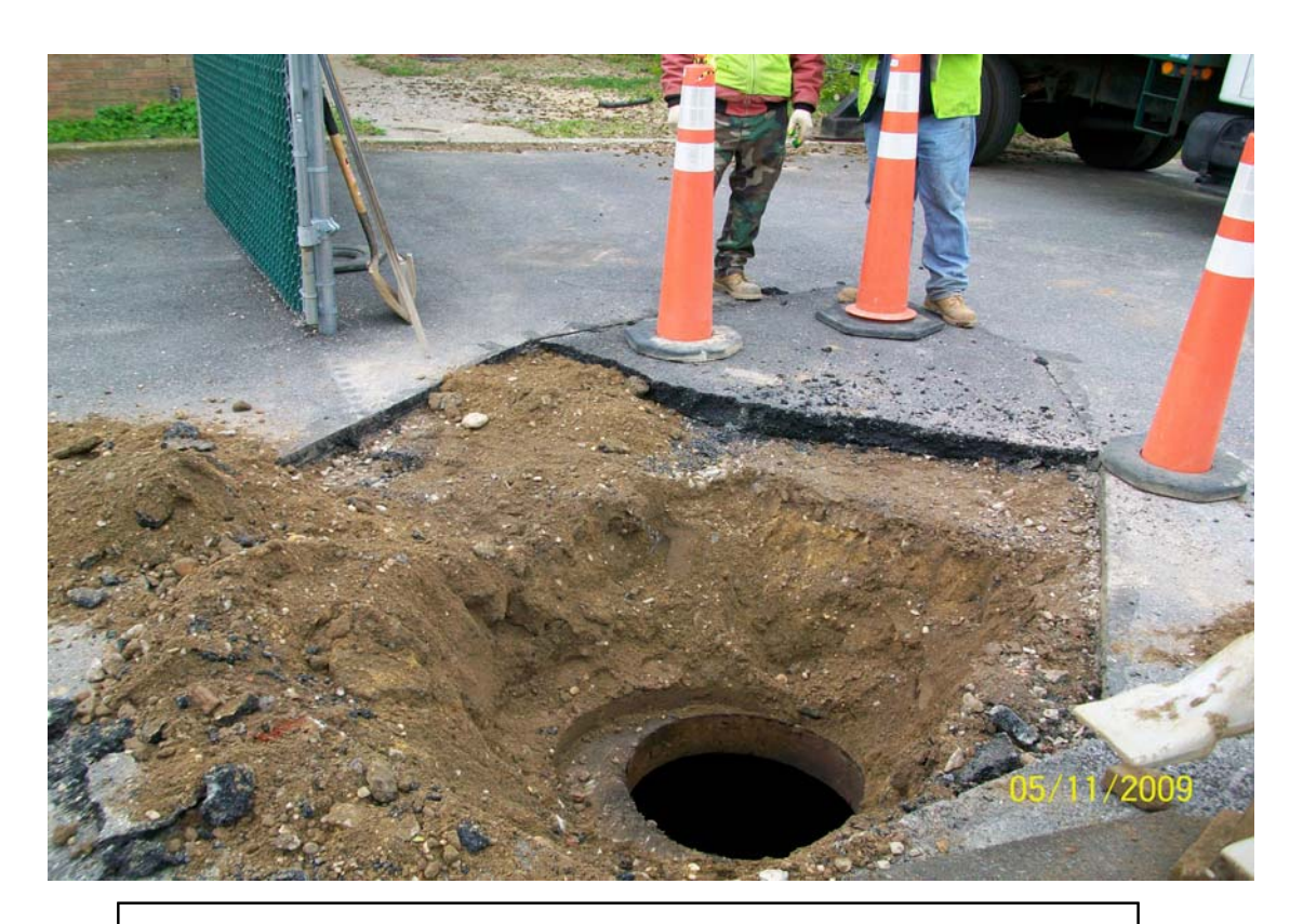
100_00583.jpg - CP-1 tank top exposed, 51 Cabot St.