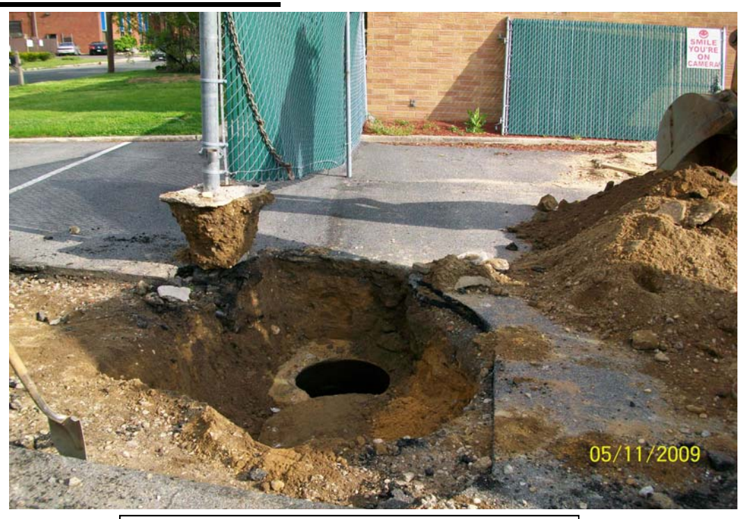
100_00580.jpg - CP-2 tank top exposed, 61 Cabot. St.