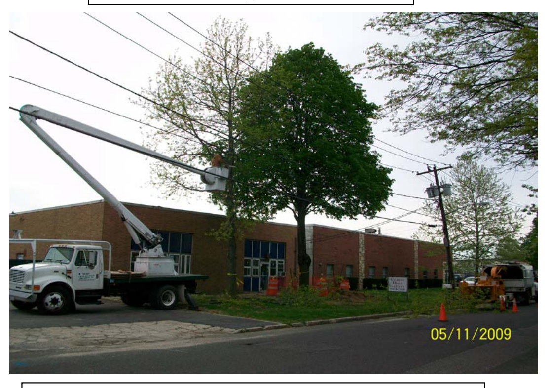
100_00582.jpg - Removing the 2 trees in front of 51 Cabot St,