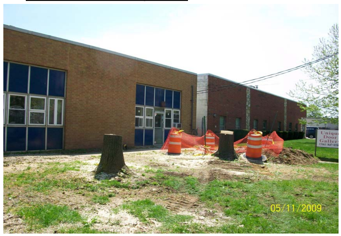
100_00588.jpg - Both trees in front of 51 Cabot St. removed.