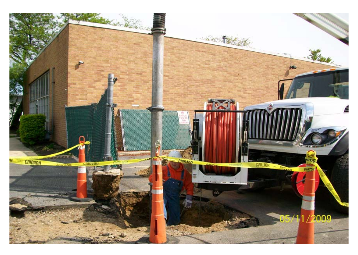
100_00586 - AARCO cleaning out CP-2.