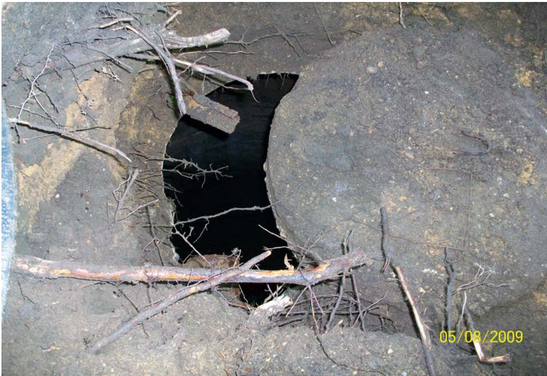
100_00574.jpg - CP-5, in front of 51 Cabot St.