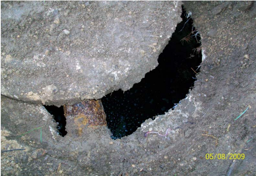
100_00572.jpg - CP-13, in front of 61 Cabot St.