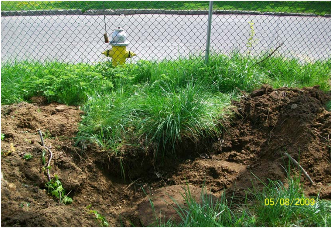
100_00578 - CP-3, in front of 50 Dale St.