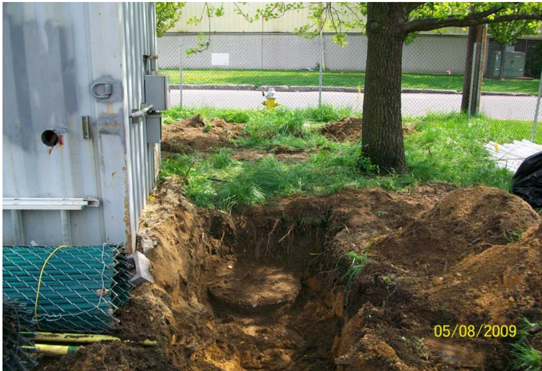
100_00577.jpg - CP-4, in front of 50 Dale St.