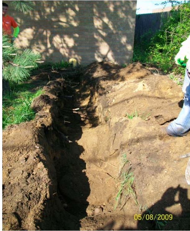
100_00575.jpg - CP-12, in front of 60 Dale St.