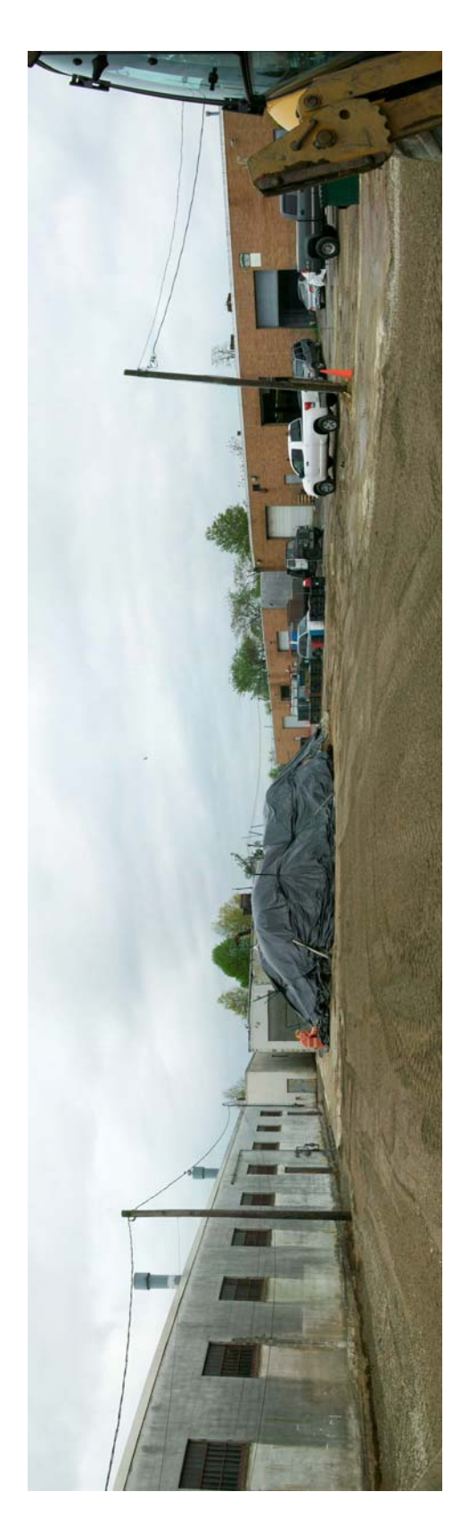
100_00571.jpg - Site at the end of the day, looking west