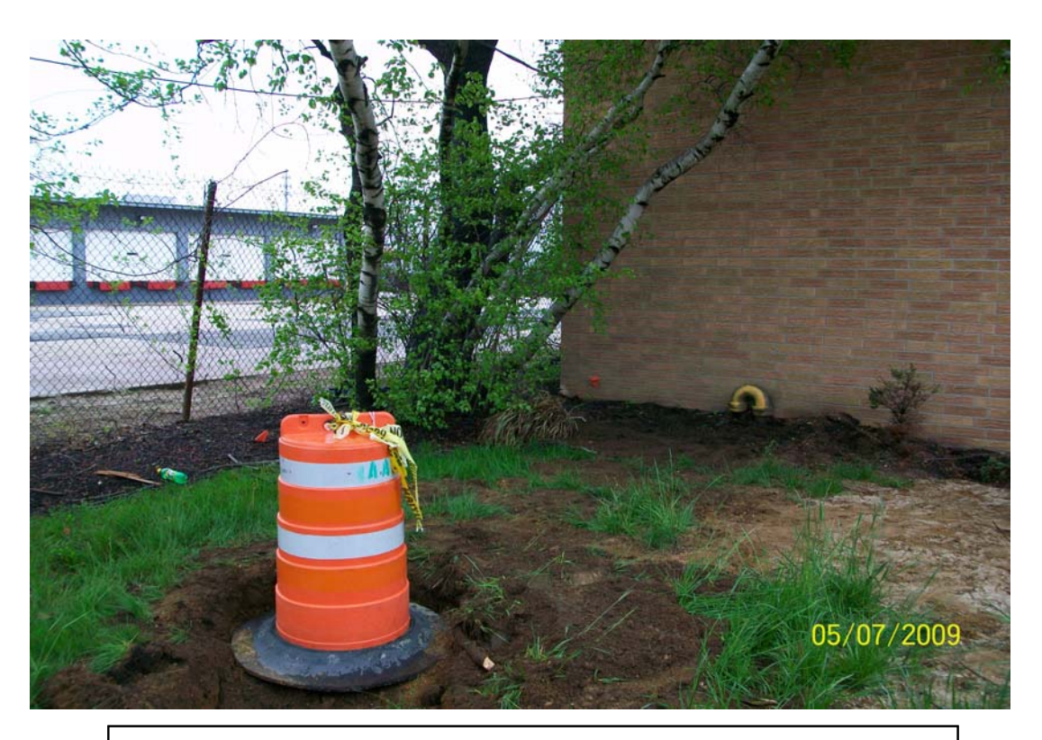
100_00569.jpg - CP-13 (61 Cabot St.) tank top