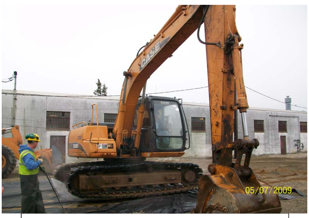
100_00563.jpg - Decontaminating excavator