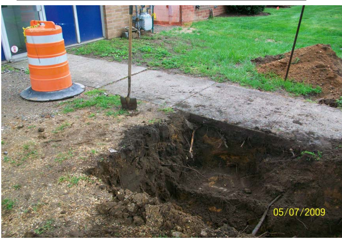
100_00570.jpg - CP-5 (51 Cabot St.) tank top