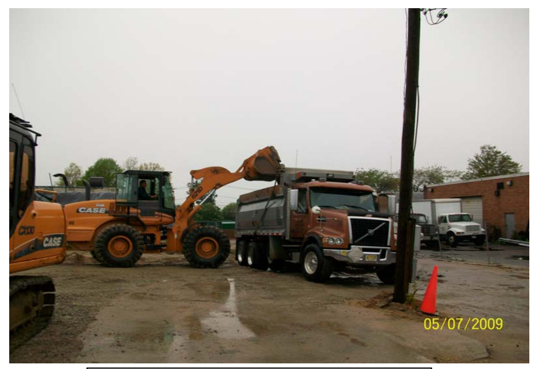
100_00560.jpg - Loading concrete into a dump truck for disposal