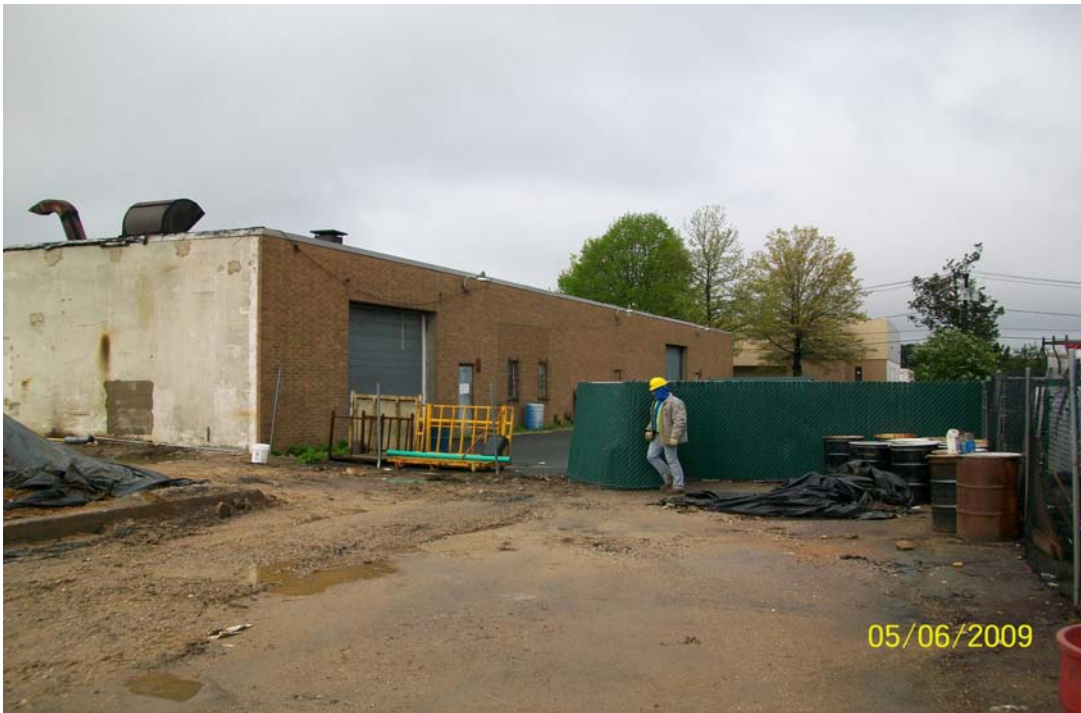
100_00558.jpg - Removing fence between 50 Dale St. and 51 Cabot St.