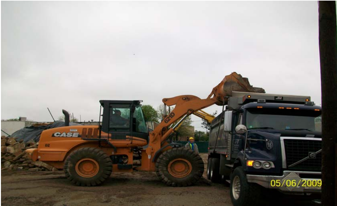
100_00556.jpg - Loading concrete into a dump truck for disposal