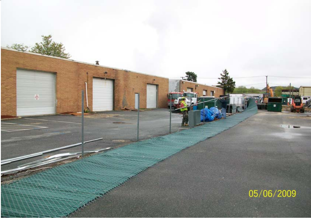
100_00559.jpg - Removing fence between 51 and 61 Cabot St.