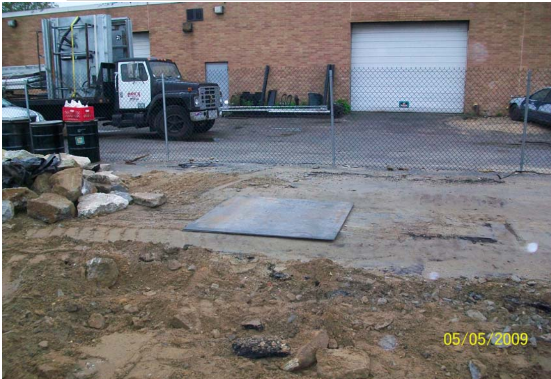
100_00553.jpg - Steel plate covering CP-8 opening