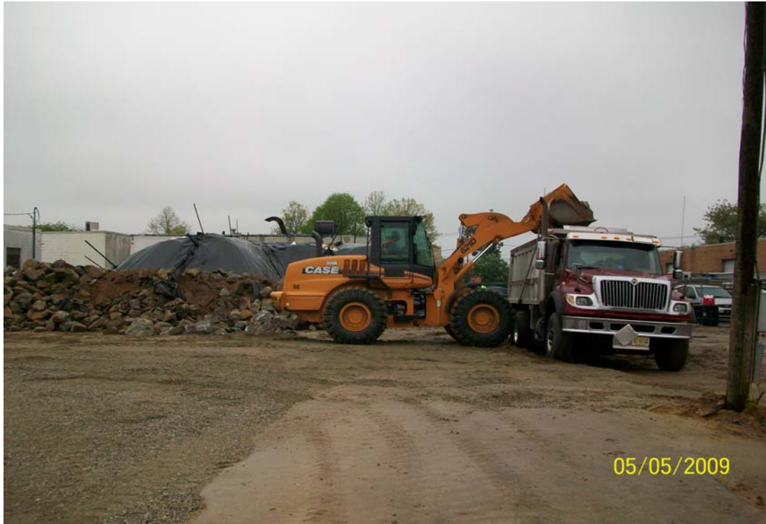
100_00554.jpg - Loading concrete into a dump truck for disposal