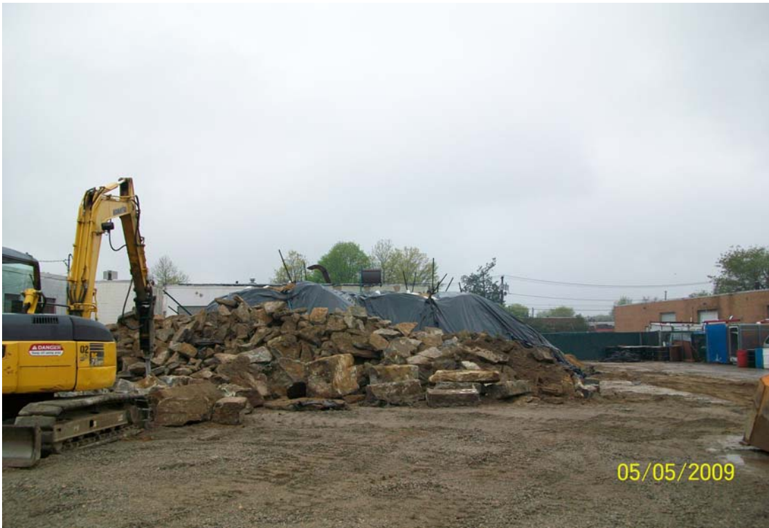
100_00555.jpg - Site at the end of the day with broken up concrete awaiting disposal.