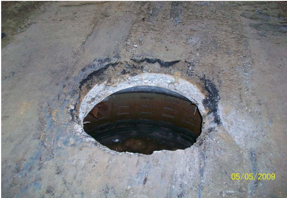
100_00550.jpg - CP-8 cover that fell in