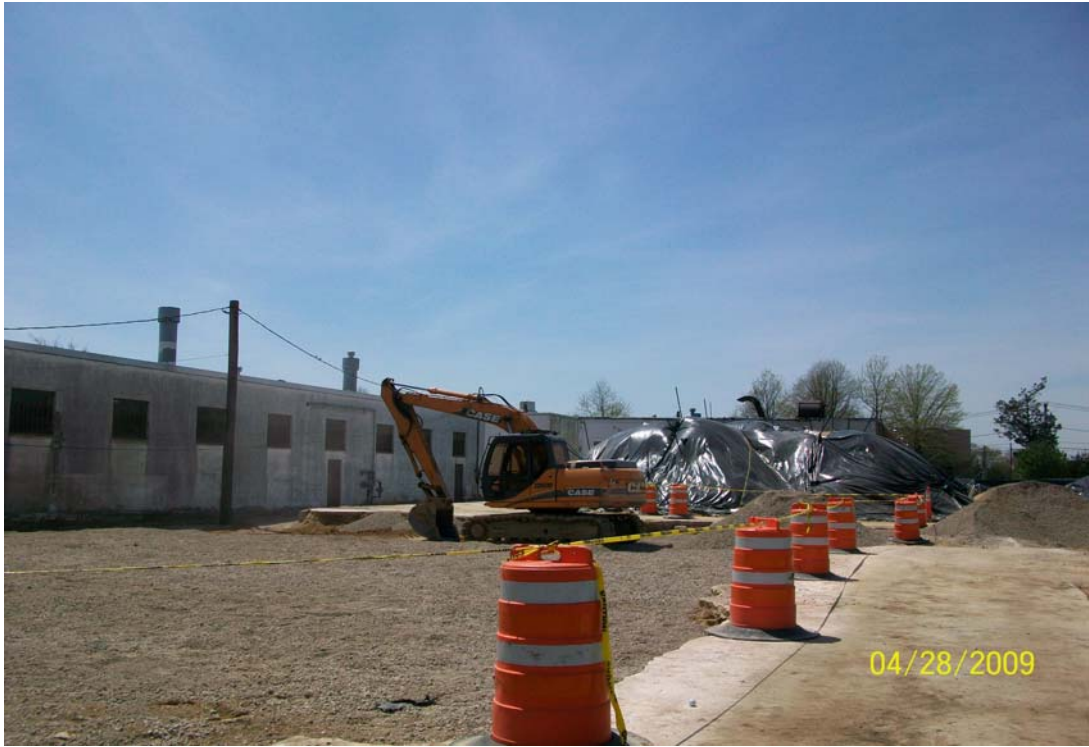
100_00522.jpg - East alleyway at the end of the day, looking SW