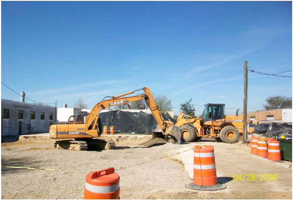
100_00520.jpg - Spreading RCA on the excavation