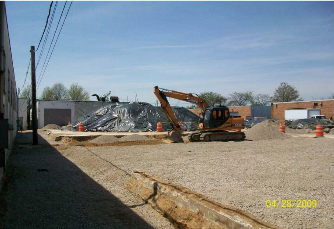
100_00521.jpg - Excavation at the end of the day, looking west