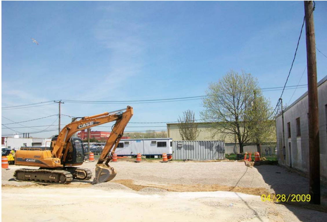
100_00523.jpg - East alley at the end of the day, looking east.