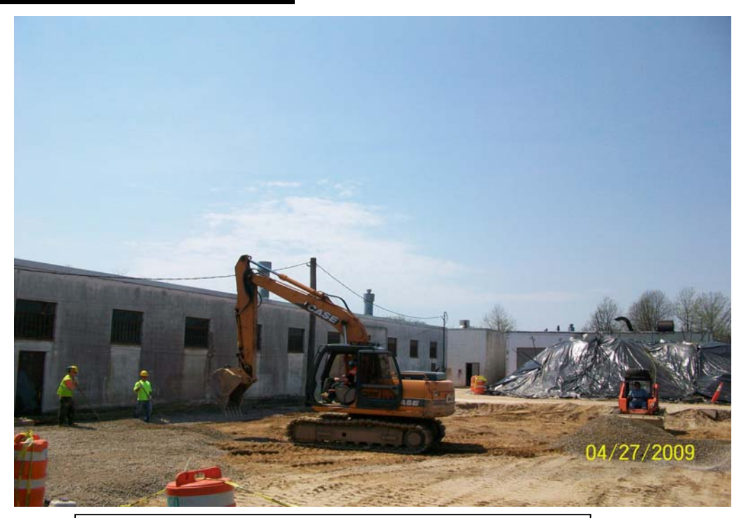
100_00510.jpg - Spreading RCA in excavation