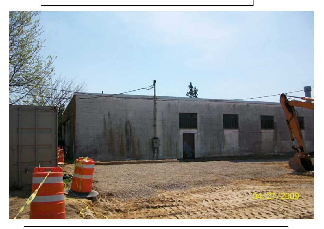
100_00517.jpg - Excavation at the end of the day, looking south