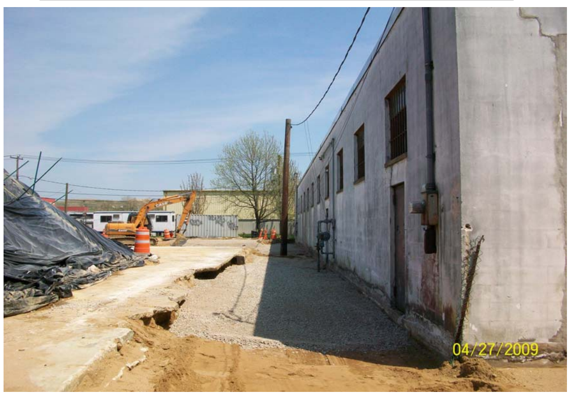
100_00519.jpg - East alley at the end of the day, looking east.