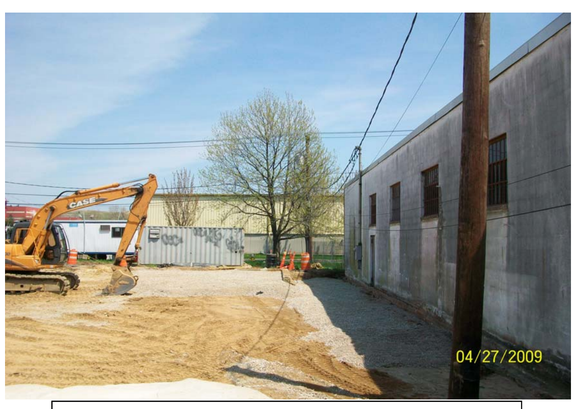
100_00518.jpg - East alleyway at the end of the day, looking east.