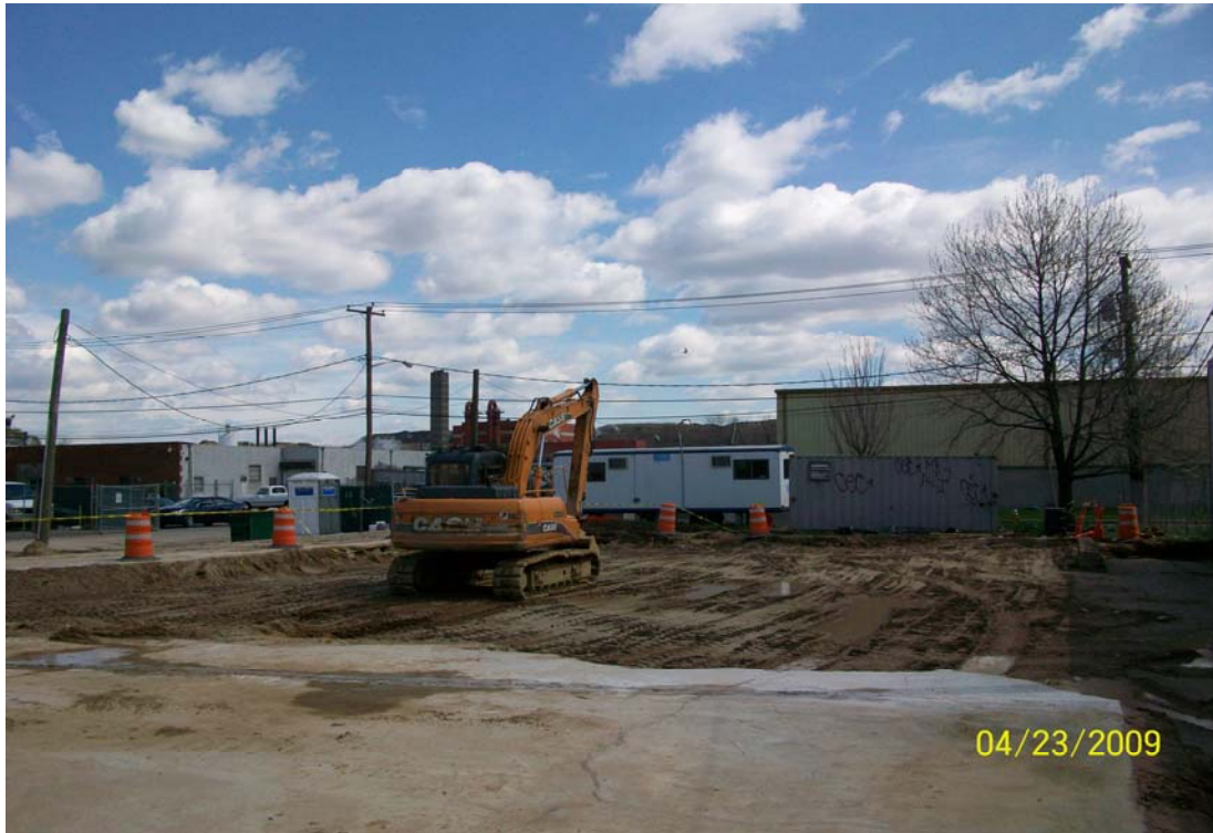
100_00459.jpg - Excavation at the end of the day, looking east