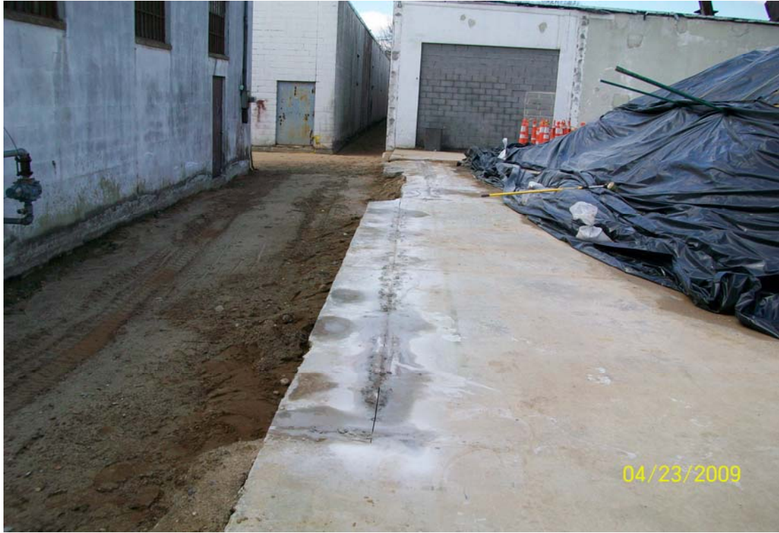
100_00457.jpg - Finished saw cutting south side of concrete slab