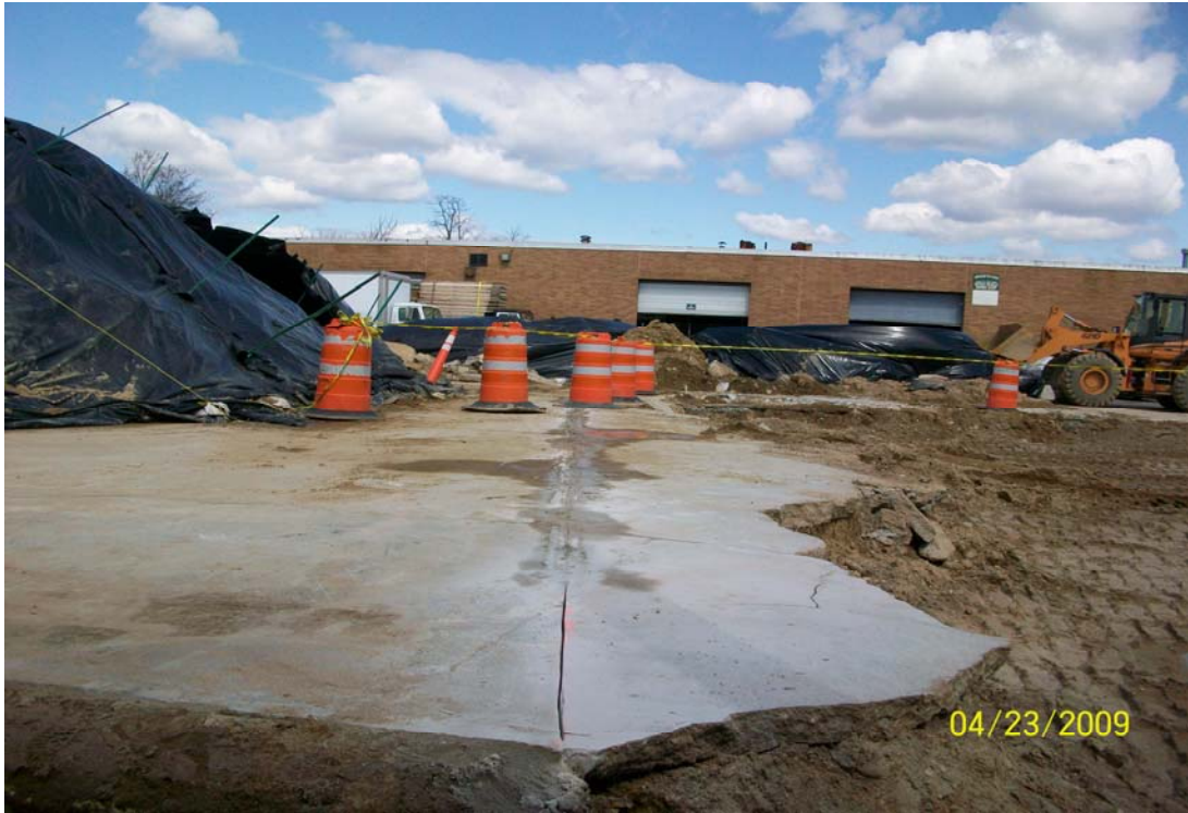
100_00458.jpg - Finished saw cutting west side of concrete slab