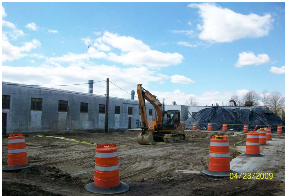
100_00460.jpg - Excavation at the end of the day, looking west