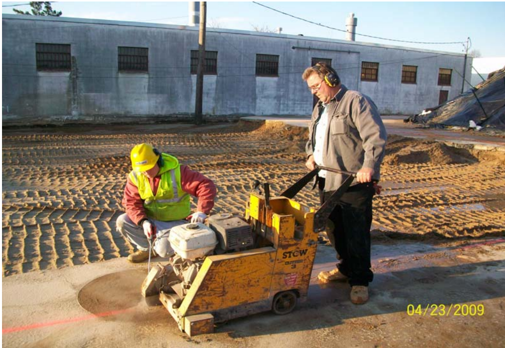
100_00455.jpg - Saw cutting concrete slab