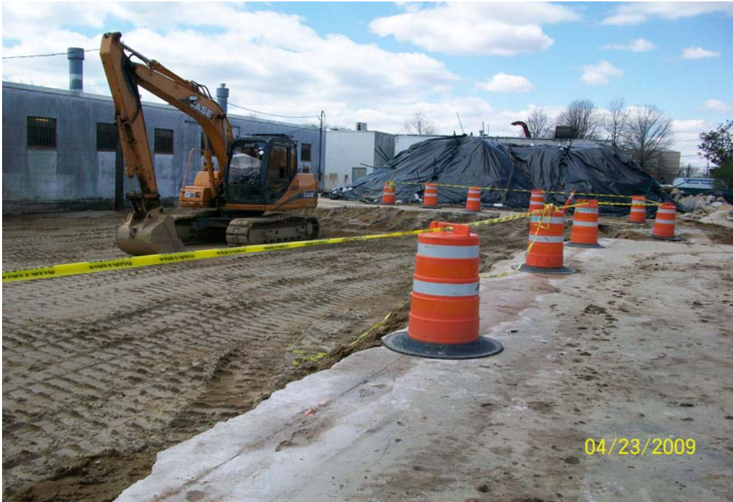
100_00456.jpg - Finished saw cutting north side of concrete slab