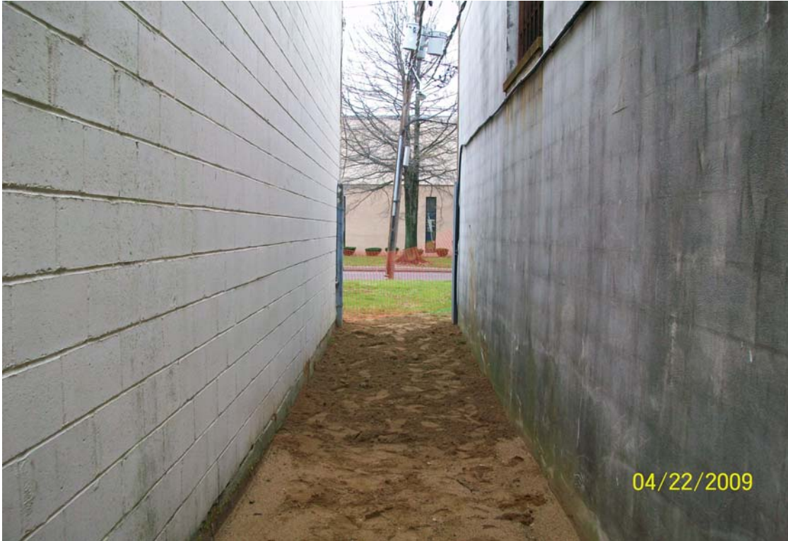
100_00450.jpg - Finished backfilling and compacting the last 10' of the west alleyway, looking west.