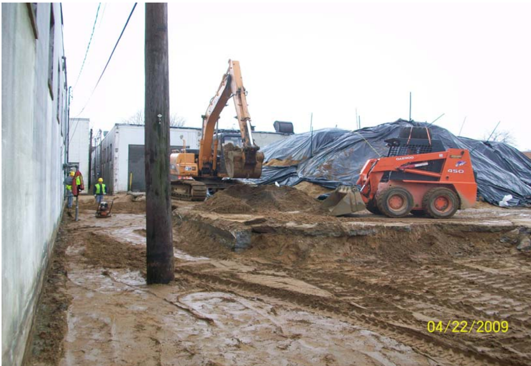
100_00449.jpg - Backfilling and compacting east alleyway, looking west