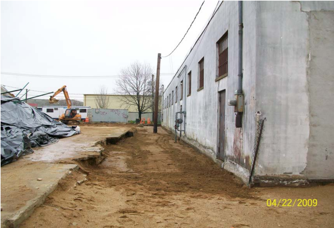
100_00451.jpg - Finished backfilling and compacting the east alleyway, looking east