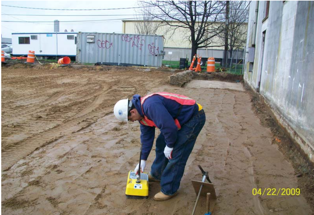
100_00446.jpg - Soil Mechanics technician conducting compaction testing in east alleyway