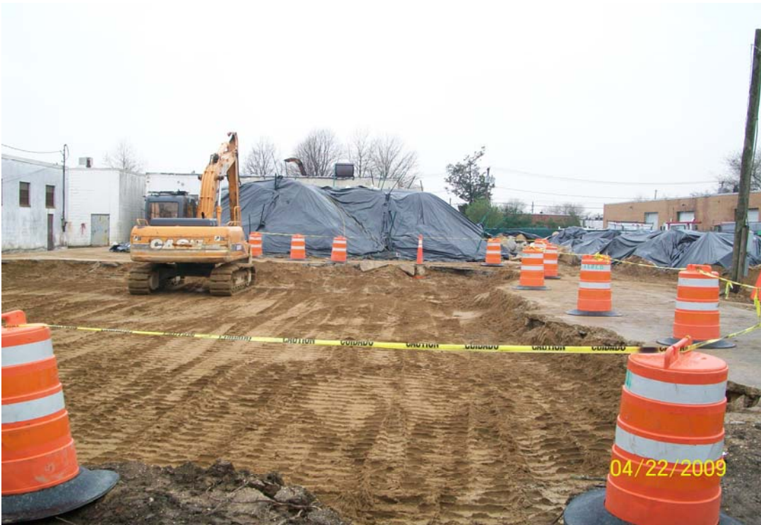
100_00453.jpg - Excavation at the end of the day, looking west