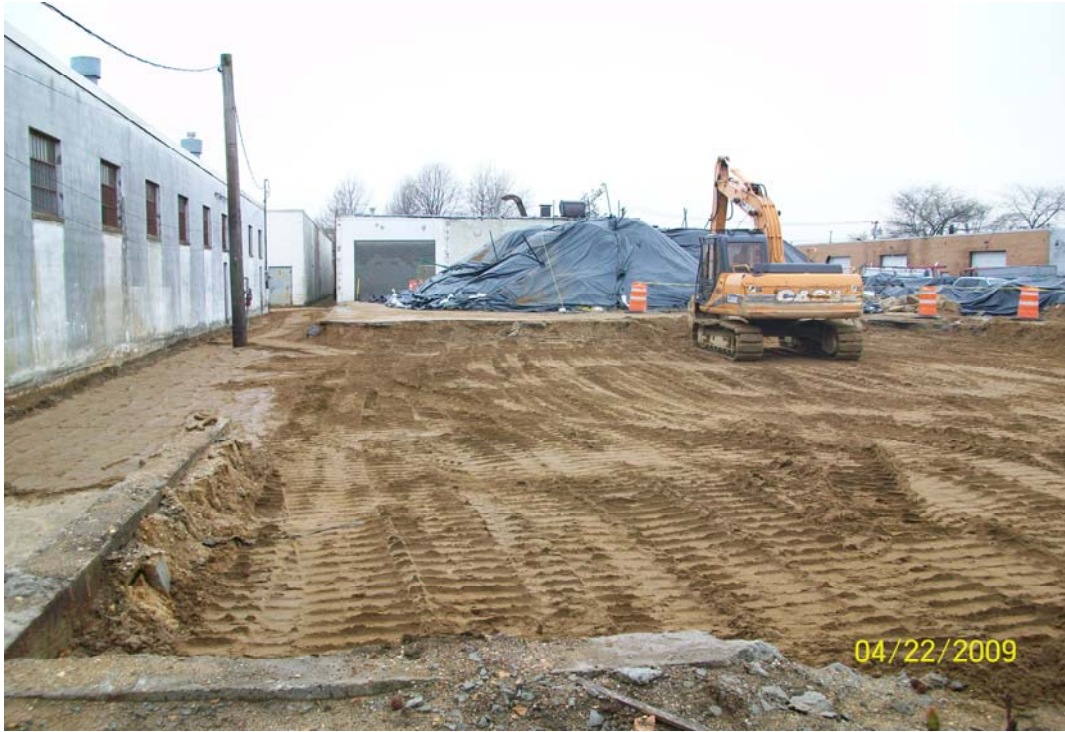
100_00452.jpg - Excavation at the end of the day, looking west