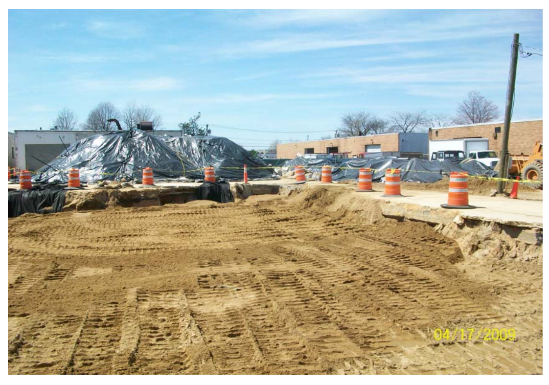
100_00382.jpg - Excavation at the end of the day, looking NW