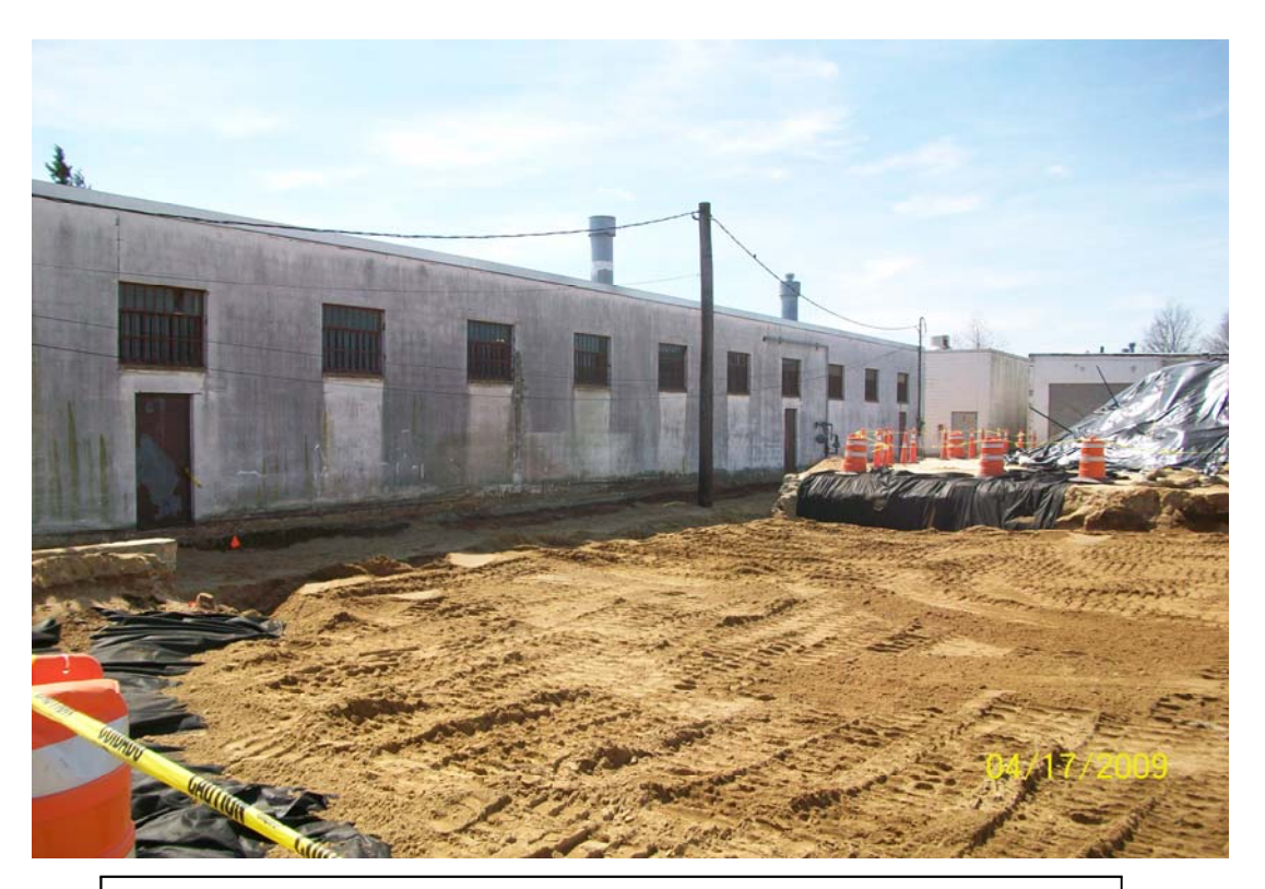
100_00381.jpg - Excavation at the end of the day, looking SW