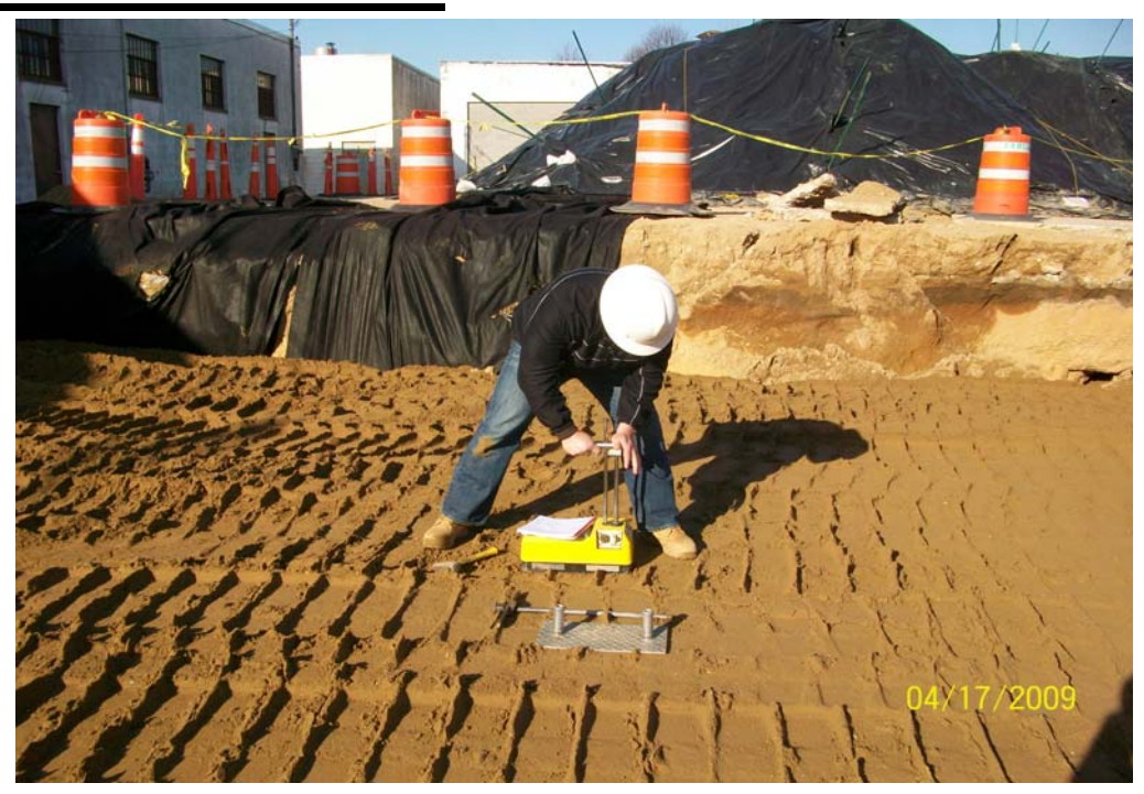
100_00377.jpg - Soil Mechanics technician collecting compaction test data.