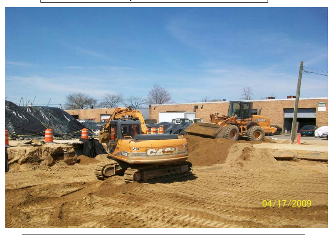
100_00379.jpg - Backfilling excavation