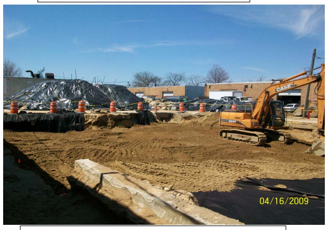
100_00375.jpg - Excavation at the end of the day, looking NW.