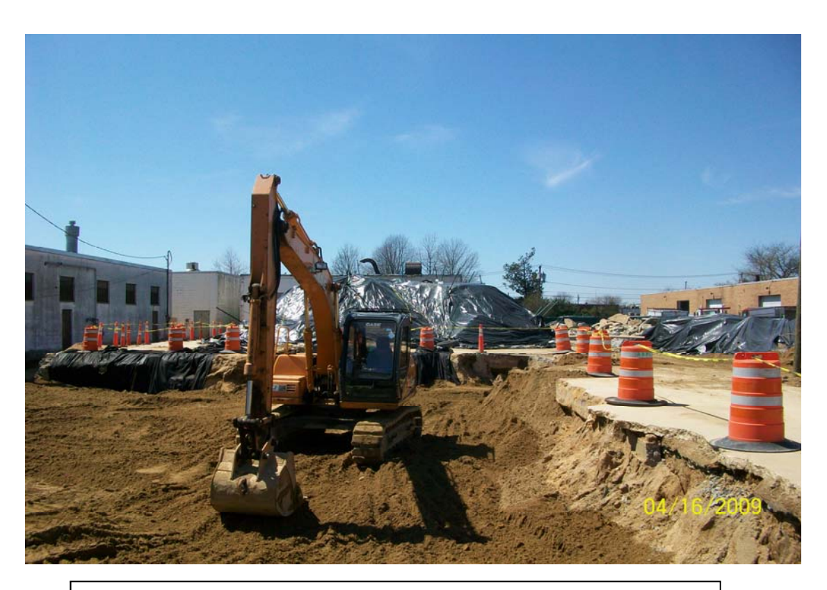
100_00376.jpg - Excavation at the end of the day, looking west.