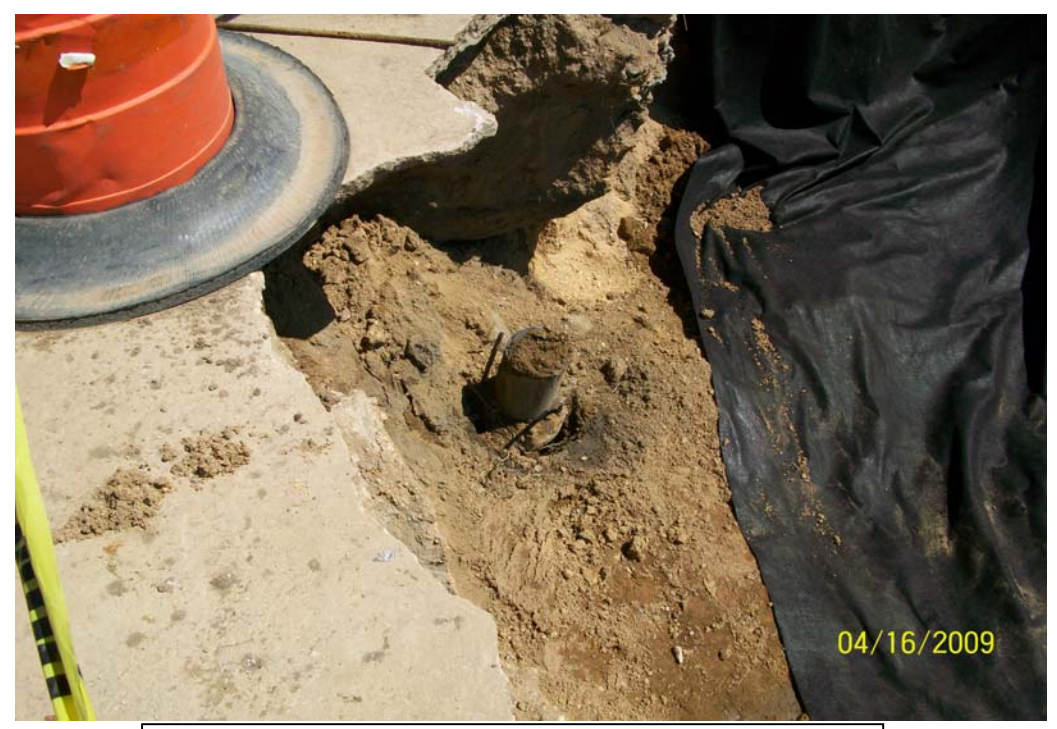
100_00373.jpg - Fire main pipe cut down below grade.