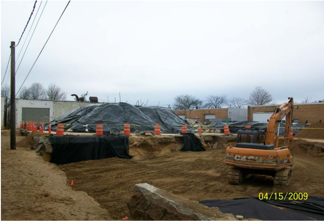
100_00363.jpg - Excavation at the end of the day, looking NW