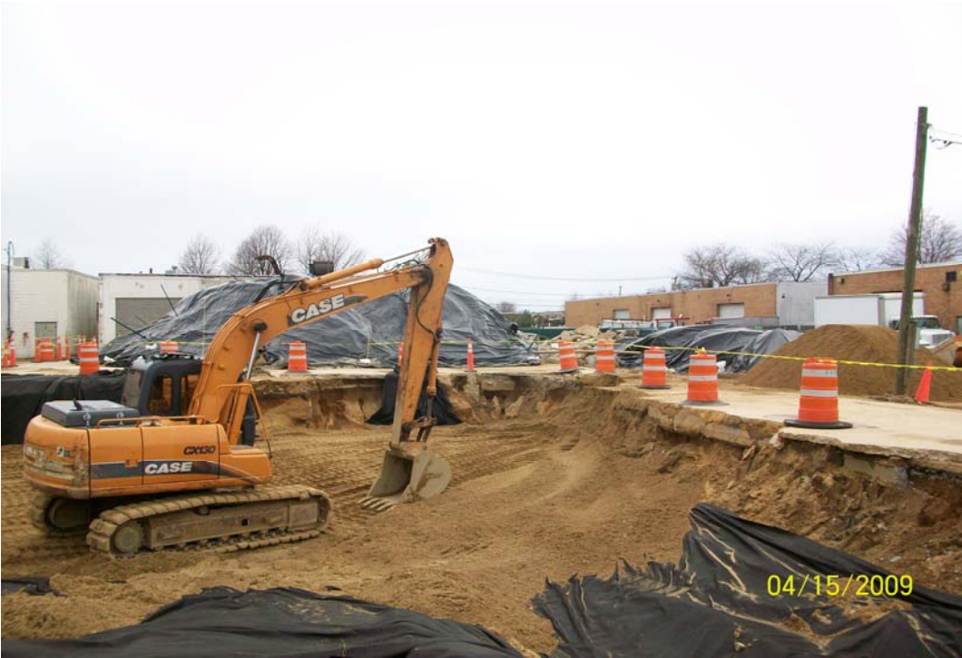
100_00364.jpg - Excavation at the end of the day, looking west