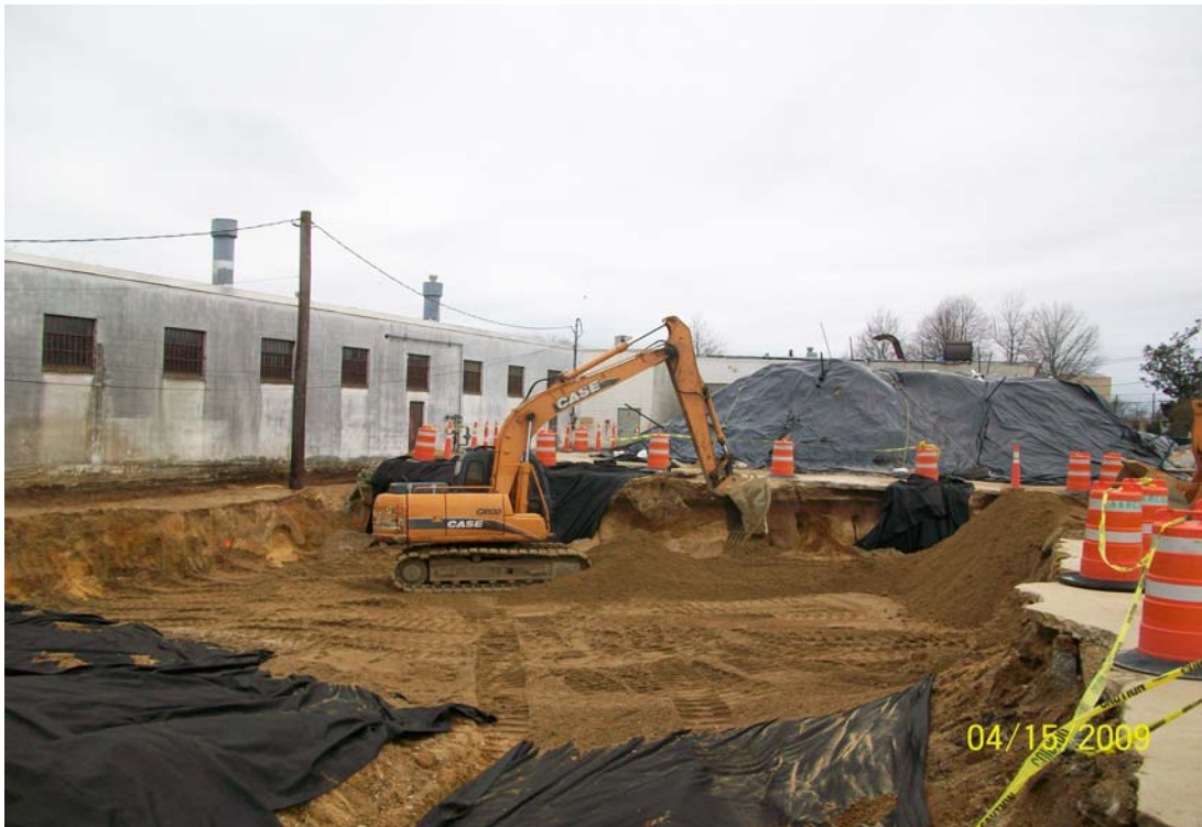
100_00362.jpg - Excavator backfilling the excavation