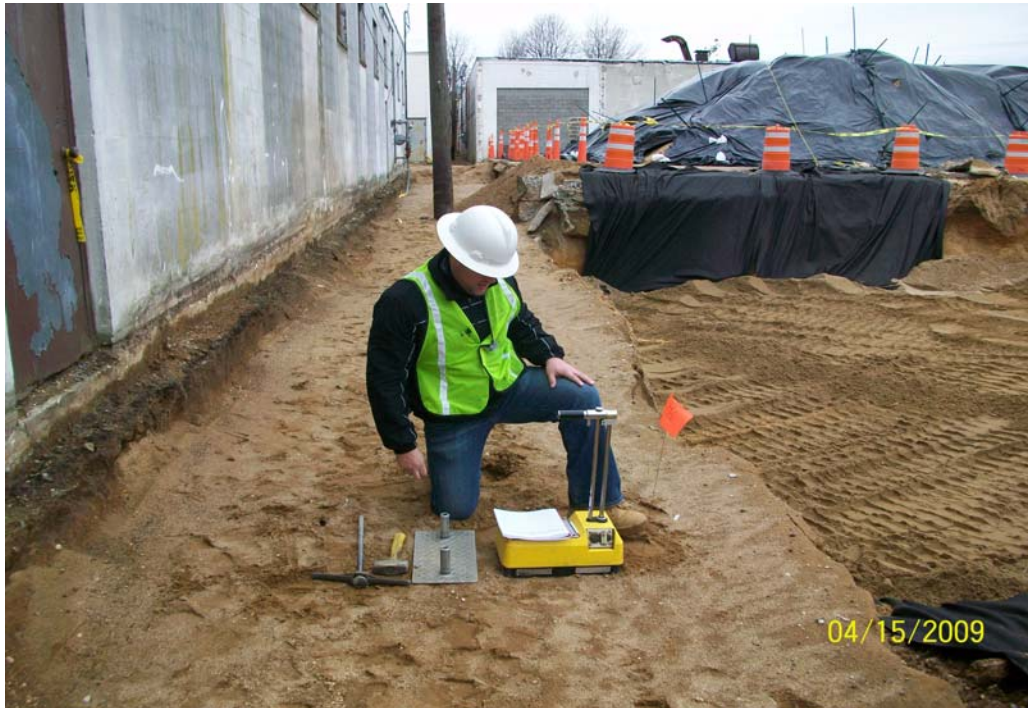
100_00361.jpg - Soil Mechanics technician collecting compaction data in east alleyway