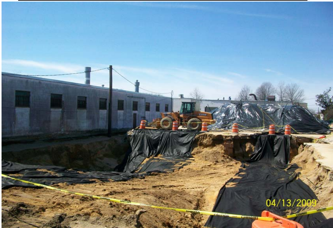
100_00353.jpg - Excavation at the end of the day with the geotextile fabric installed.