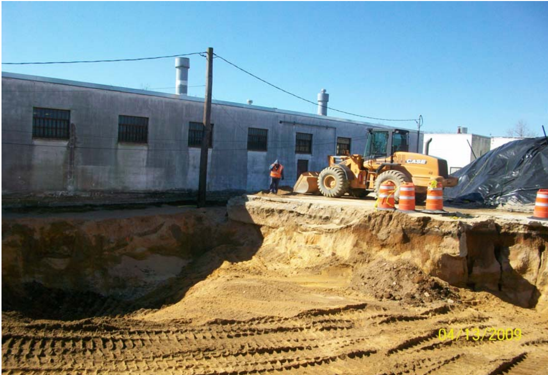
100_00350.jpg - Finished filling up sump-3.