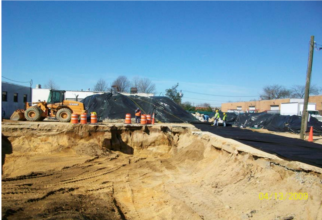
100_00351.jpg - Finished filling up sump-1.