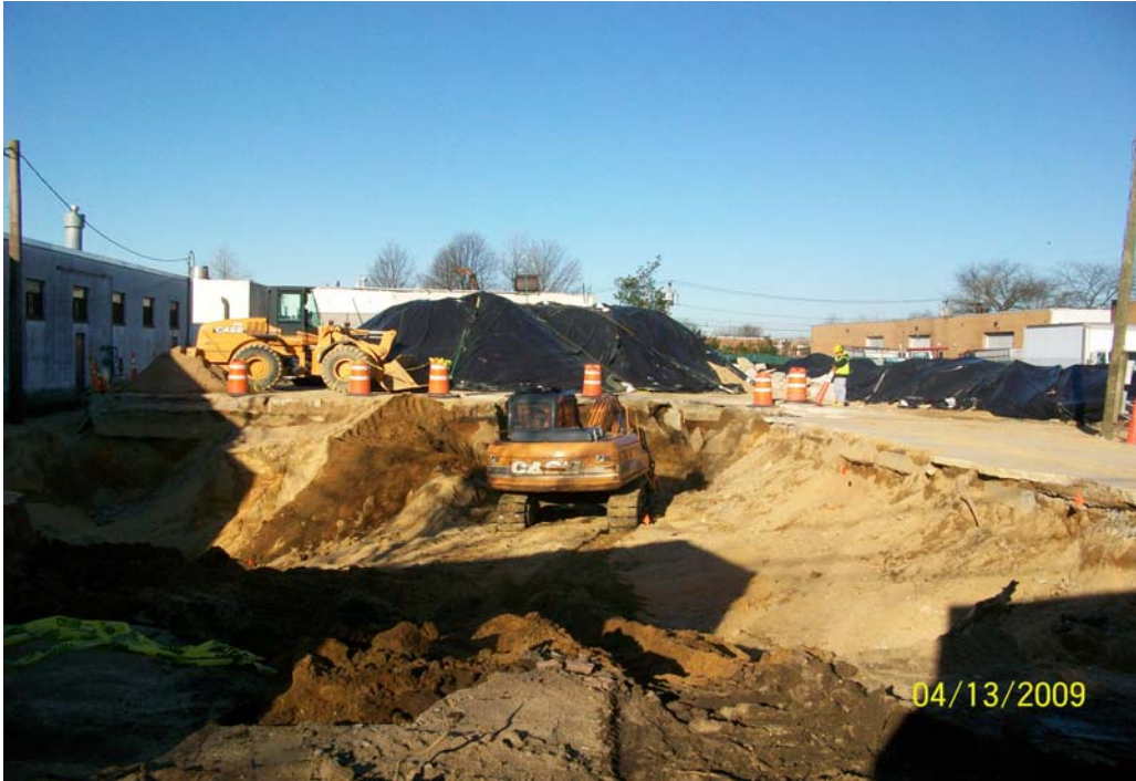
100_00348.jpg - Filling in sump-1 using material from squaring up excavation