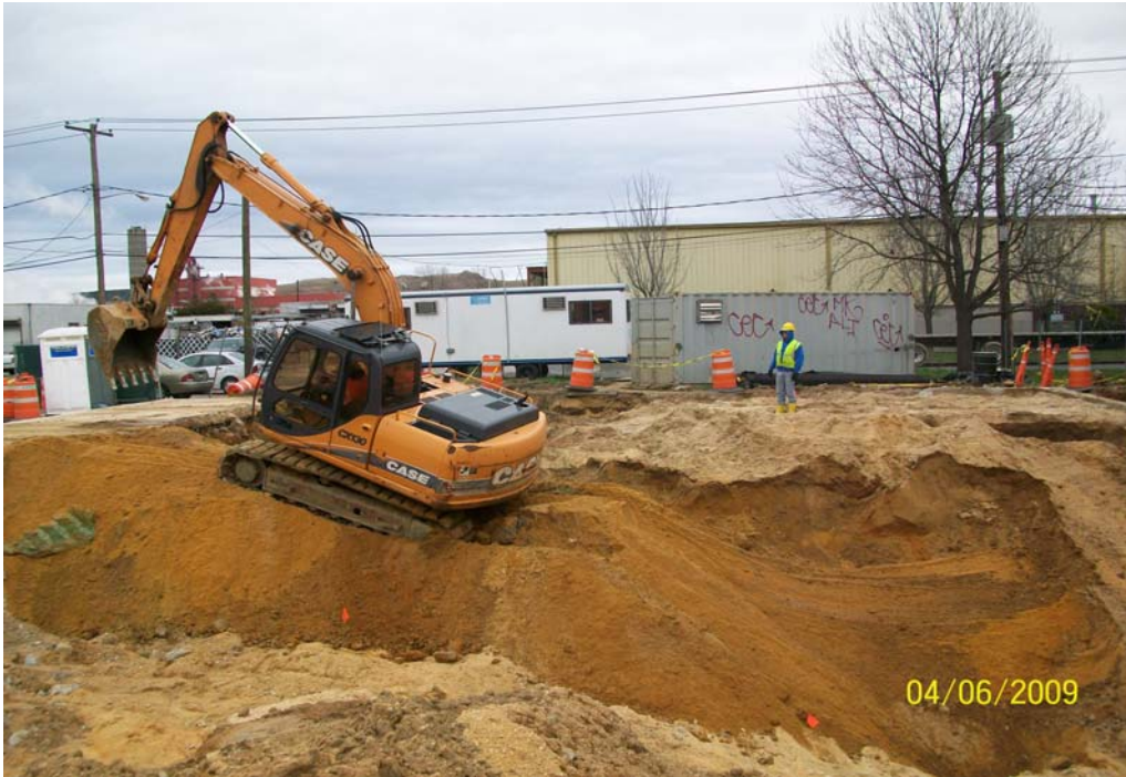
100_00330.jpg - Excavator excavating SEB-3/SES-5 area. Green chunk from NE corner.