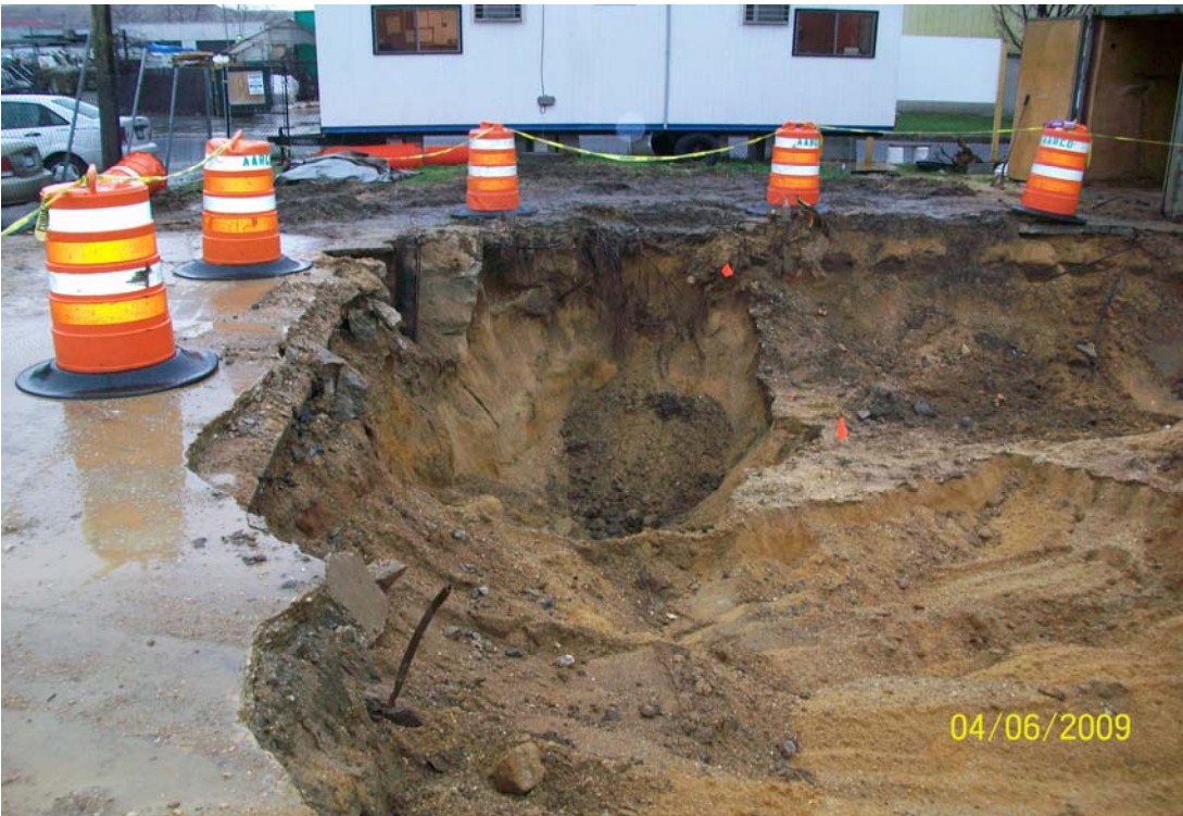
100_00331.jpg - NE corner excavated, found more green soil/chunks.