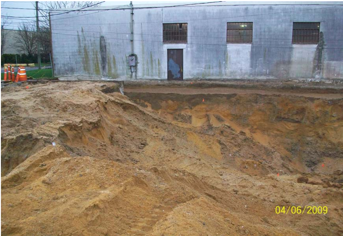
100_00332.jpg - End of day, excavated area around SEB-3/SES-5.