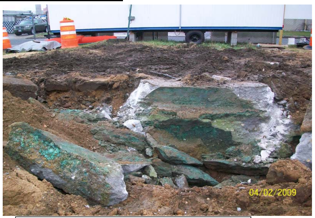
100_00314.jpg - Green contaminated concrete on east foundation wall, looking east