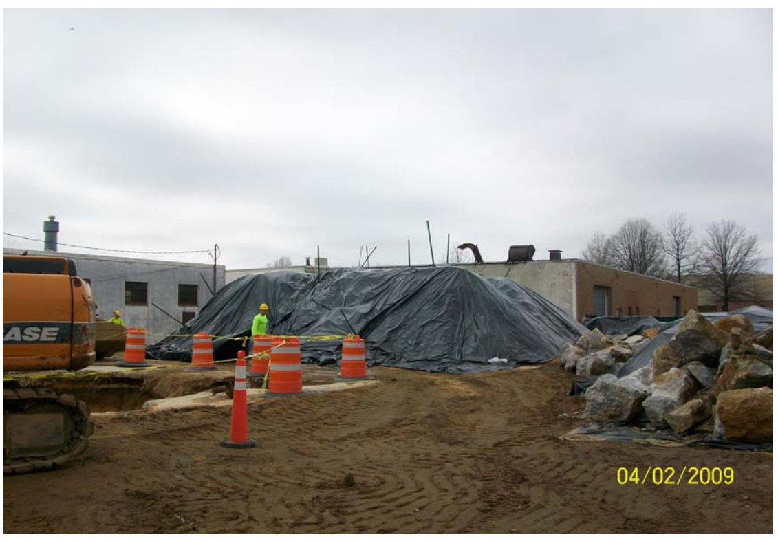
100_00321.jpg - Mt. Spectrum at the end of the day.