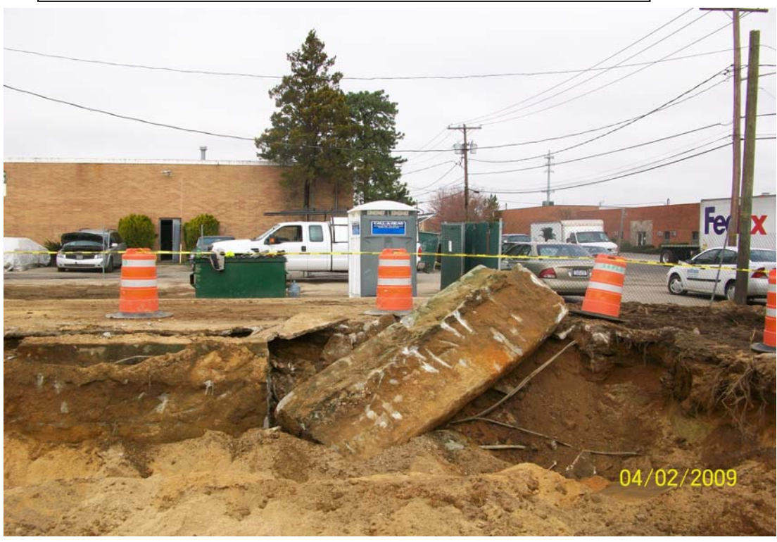
100_00318.jpg - Excavation at the end of the day, looking north