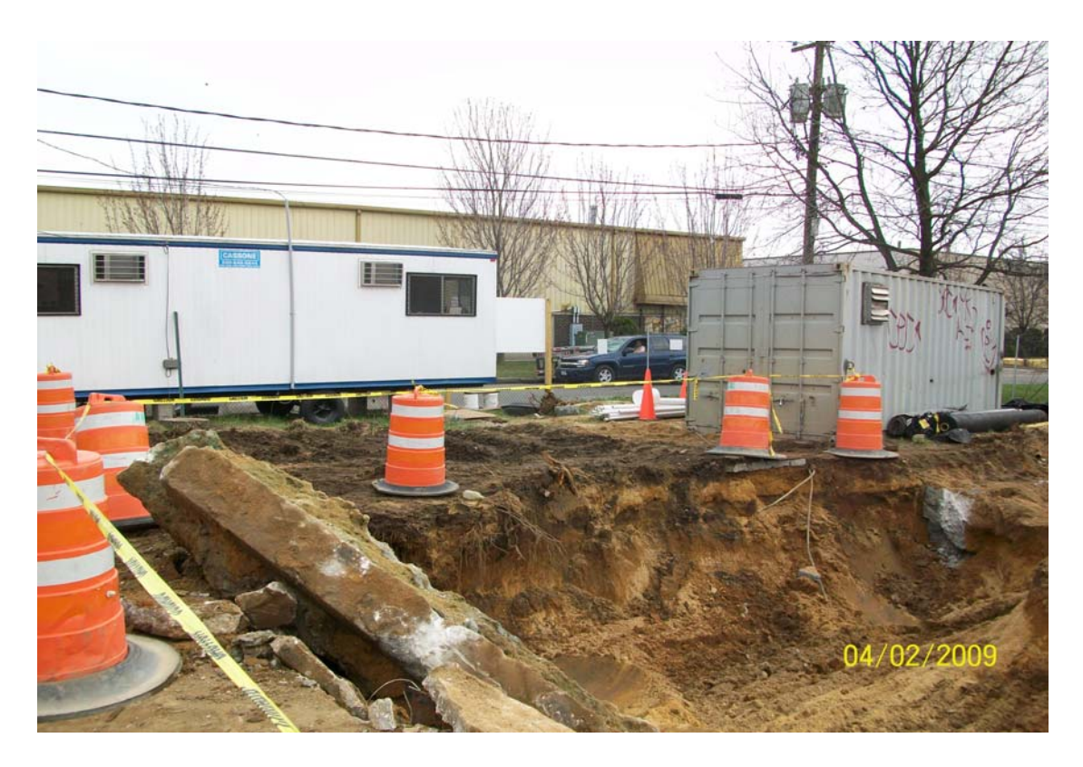
100_00320.jpg - Excavation at the end of the day looking SE