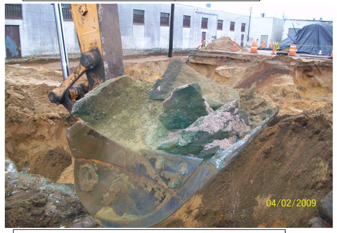
100_00315.jpg - Green contaminated soil/chunks taken from the NE corner