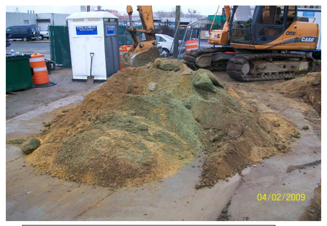
100_00316.jpg - Pile of green contaminated soil/chunks taken from the NE corner