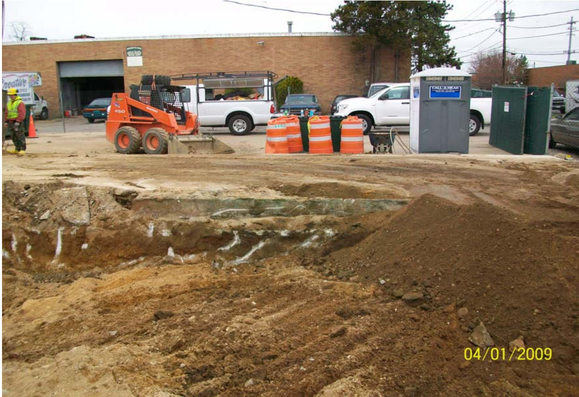
100_00311.jpg - Excavation at the end of the day looking North