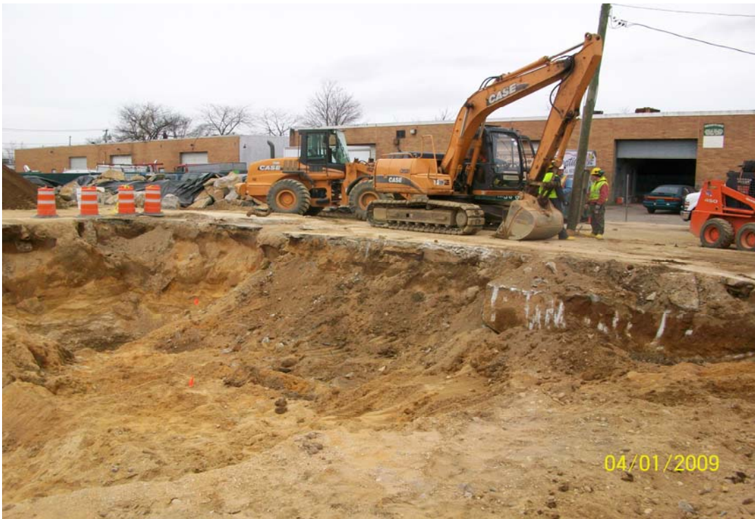
100_00312.jpg - Excavation at the end of the day looking NW