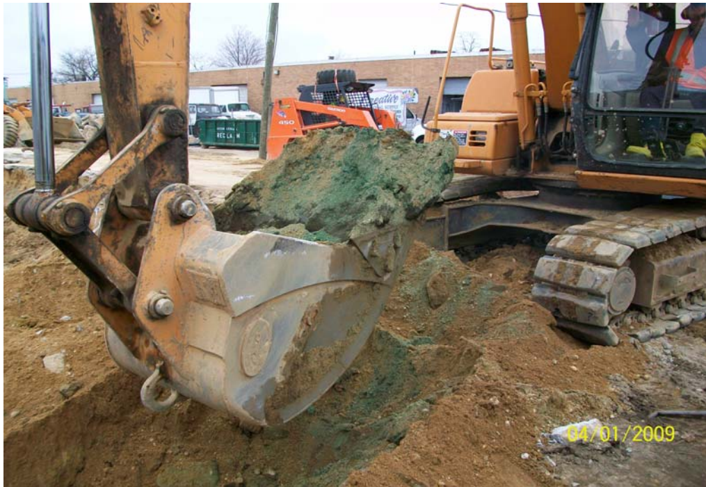
100_00302.jpg - Contaminated green chunk from NE corner in excavator bucket.