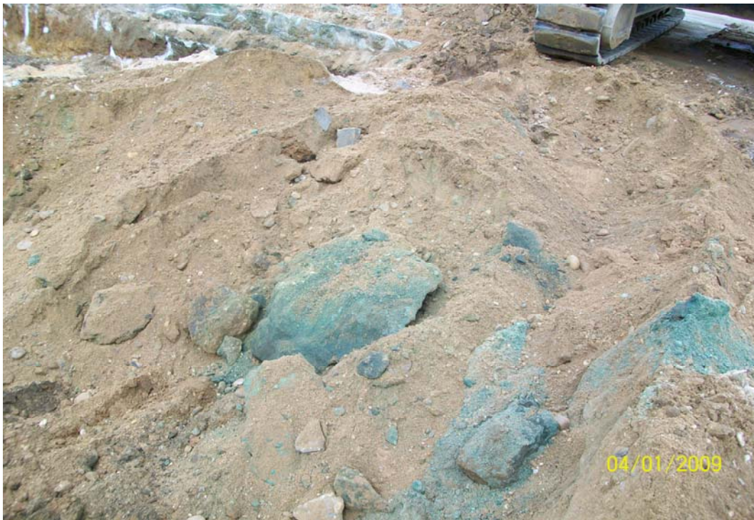
100_00306.jpg - Contaminated green soil/chunks from NE corner.