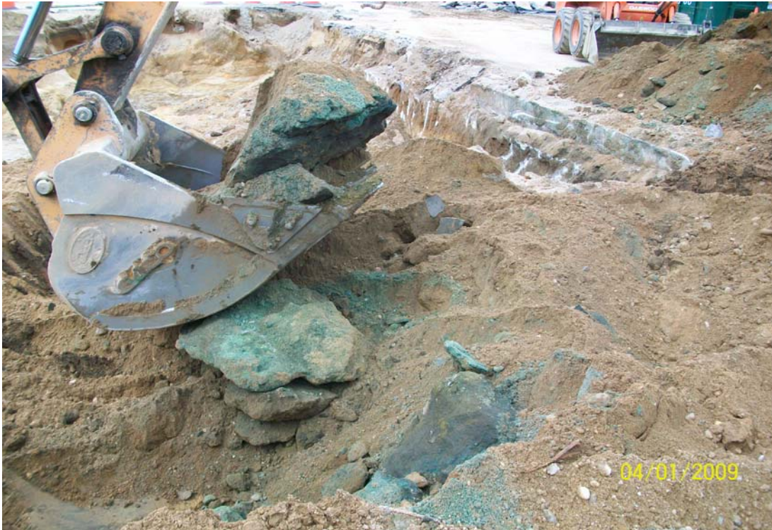
100_00307.jpg - Contaminated green soil/chunks in NE corner being removed by the excavator.