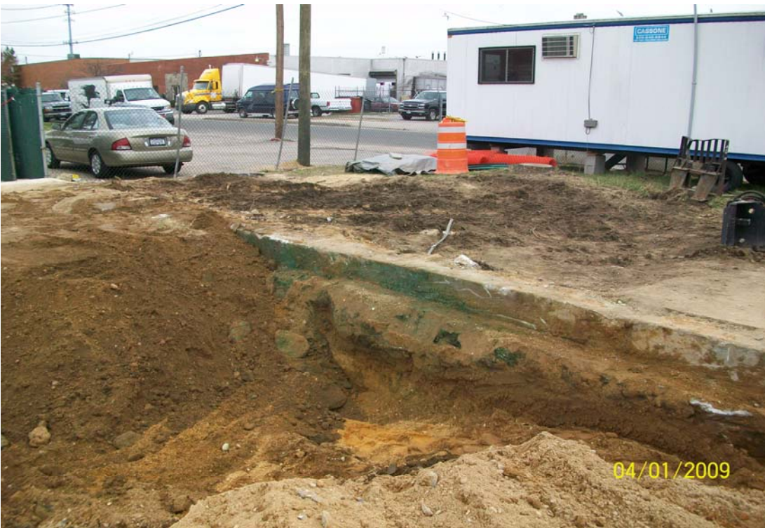
100_00310.jpg - Excavation at the end of the day looking NE.