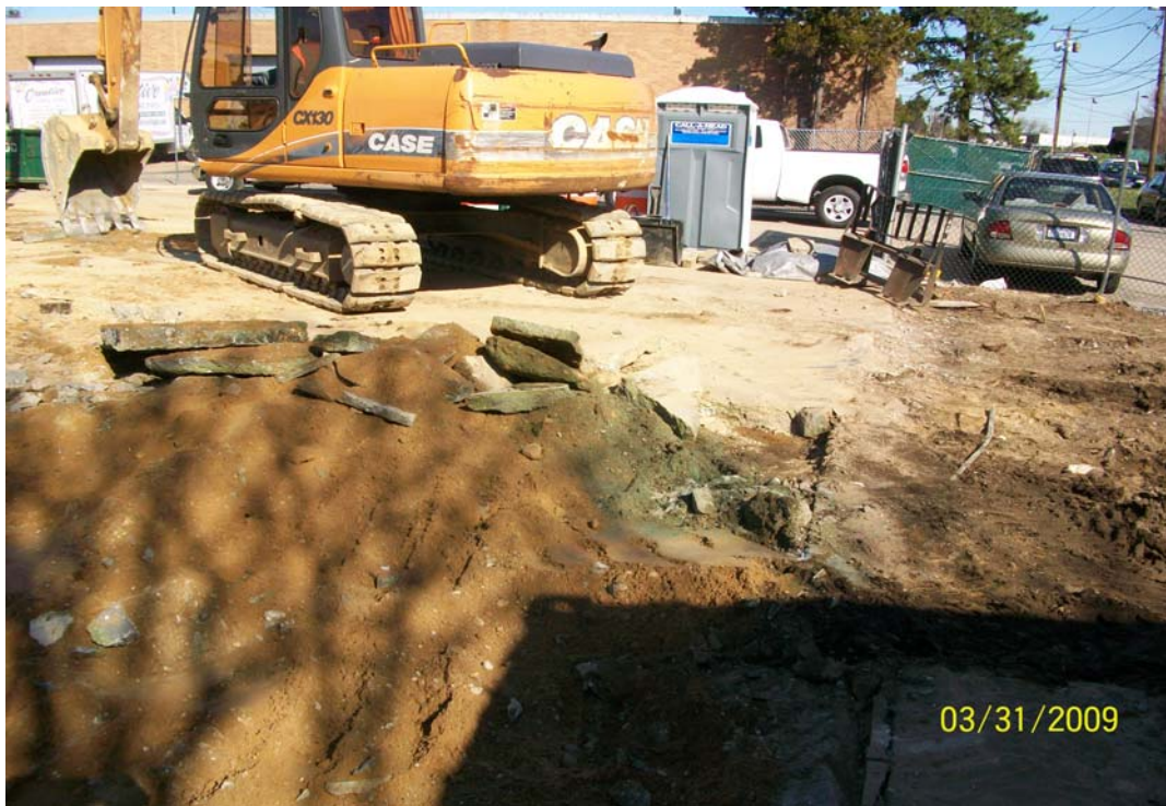
100_00292.jpg - Green stained soil and concrete, NW section of slab.