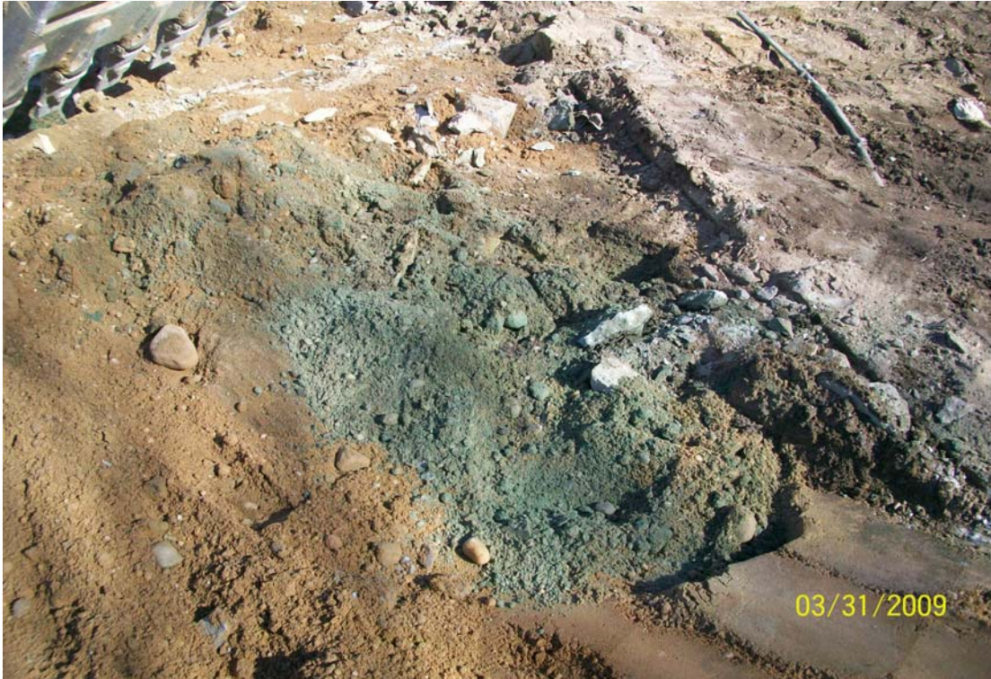
100_00293.jpg - Close-up of green stained soil, edge of NE slab.