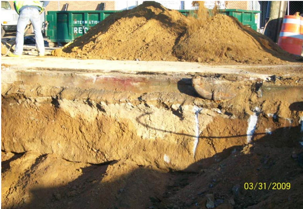
100_00289.jpg - Red stained concrete foundation wall, looking north.