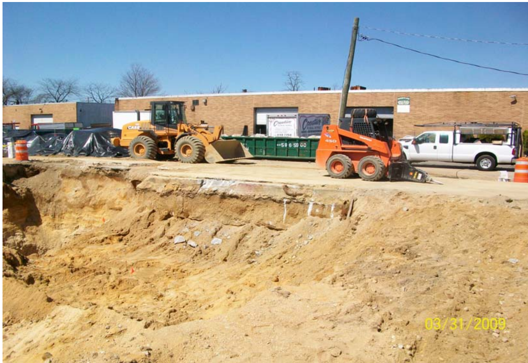
100_00294.jpg - Excavation at the end of the day, looking north.