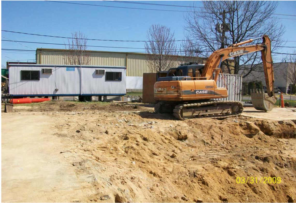
100_00295.jpg - Excavation at the end of the day, looking east