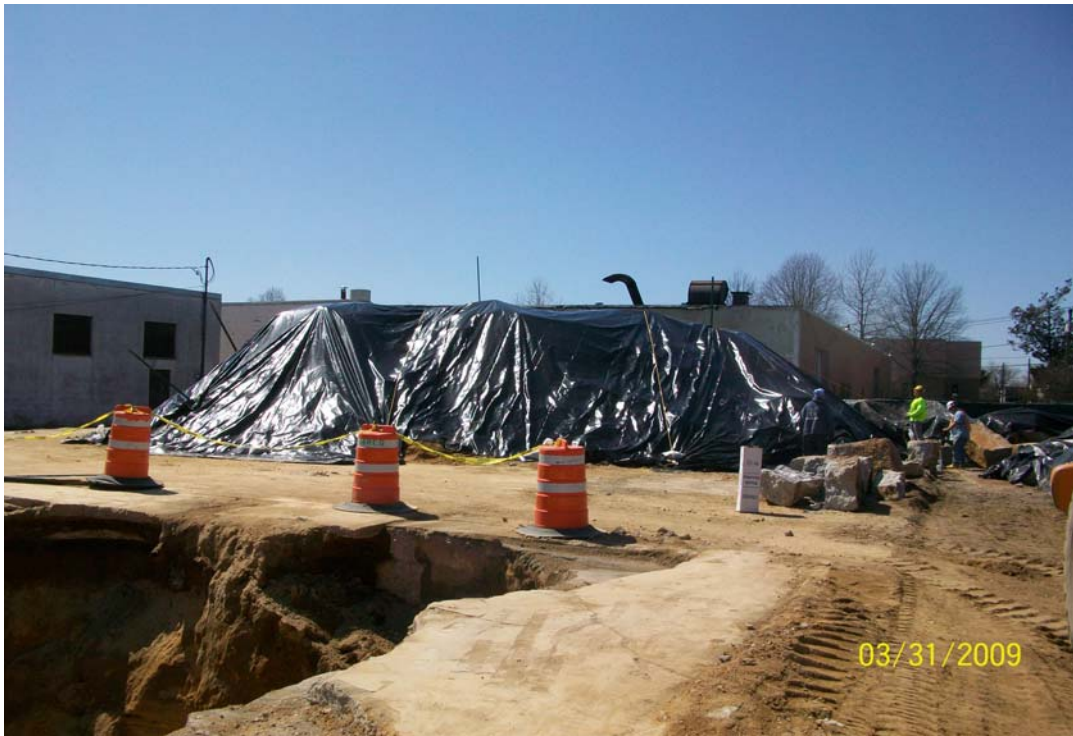
100_00296.jpg - Mt. Spectrum covered with poly.