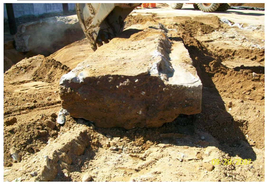
<u>100_00166.jpg - Red stained concrete foundation wall, stained completely</u> <u>through.</u>