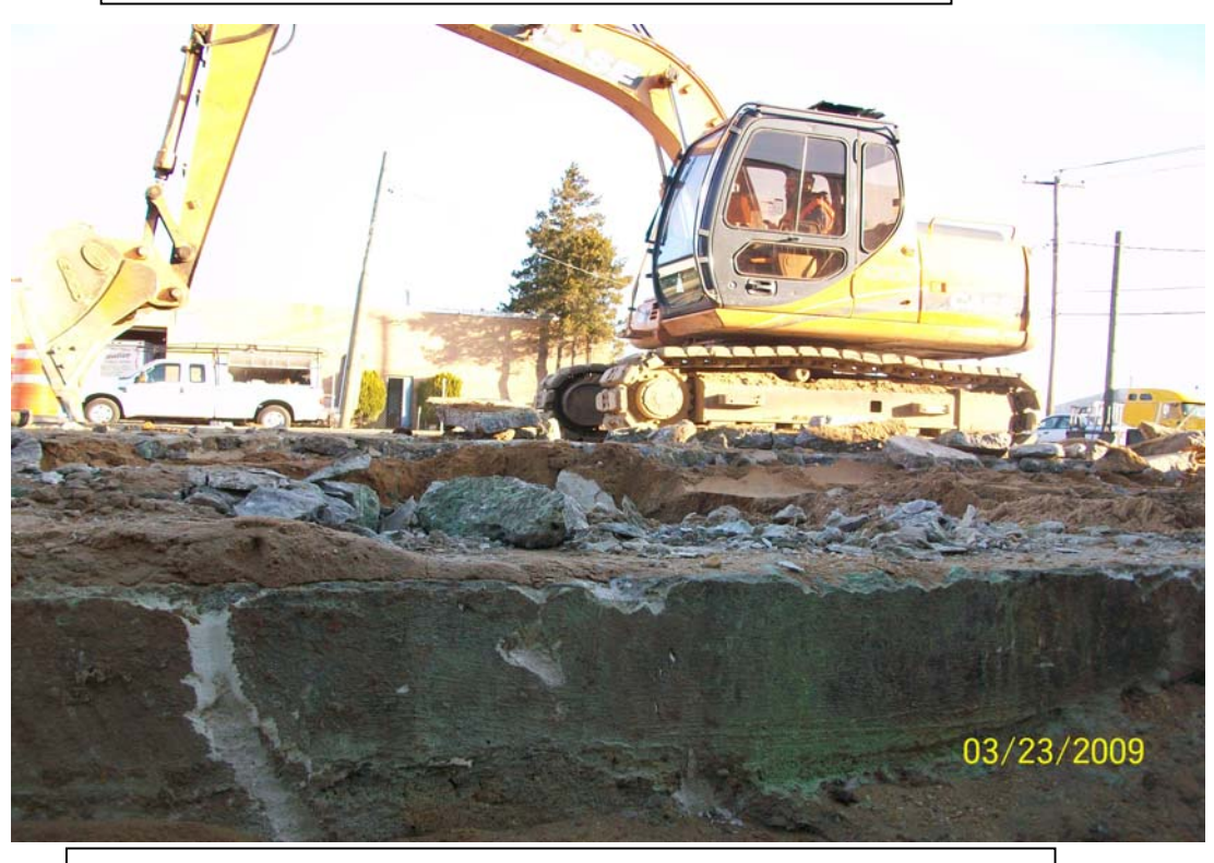
100_00149.jpg - Green staining on south foundation wall.