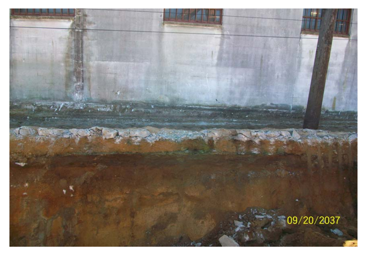
100_00159.jpg - Green/red stained soil by foundation wall.