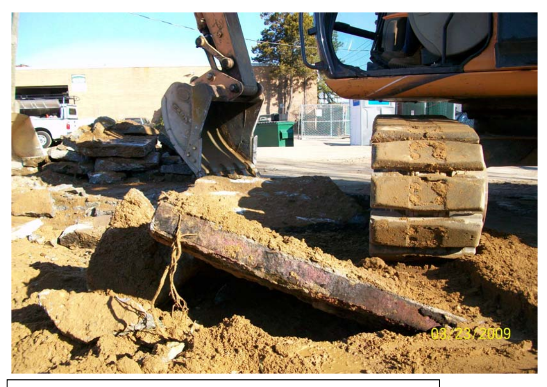
100_00155.jpg - Red stained concrete from around sump-2.