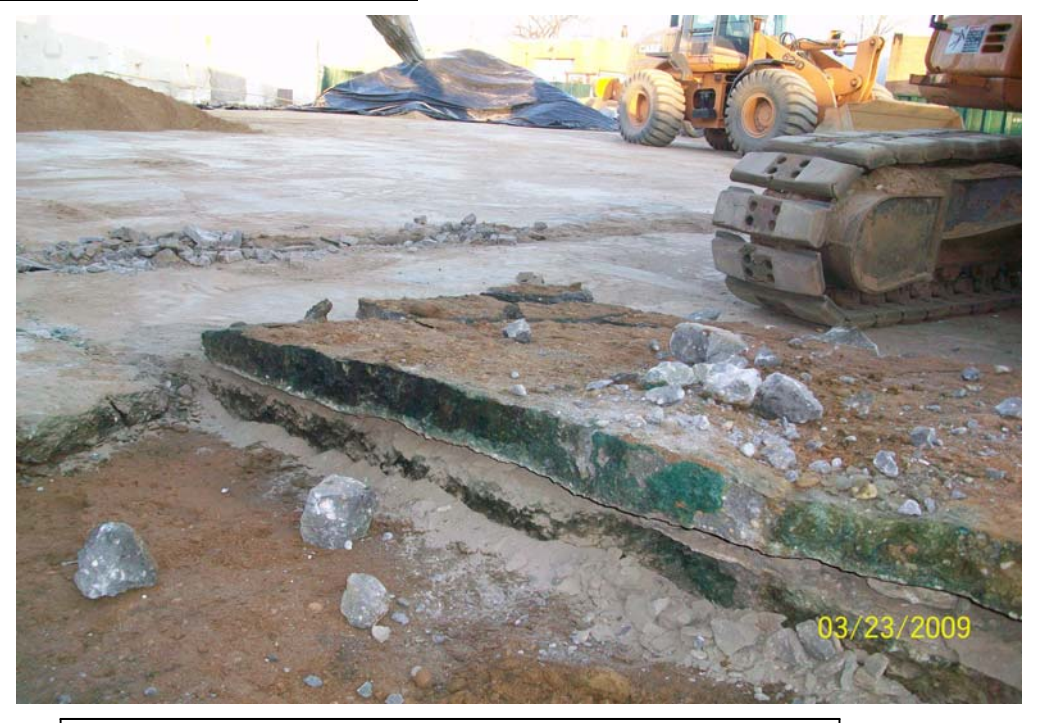
100_00144.jpg - Green stained concrete near sump-3.