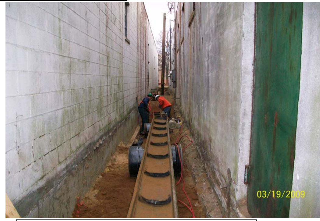
100_00134.jpg - Backfilling and compacting west alleyway using conveyor to move the material.