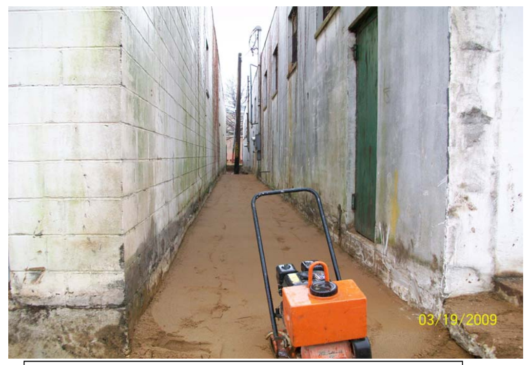
100_00136.jpg - Finished backfilling and compacting the west alleyway from the utility pole east.