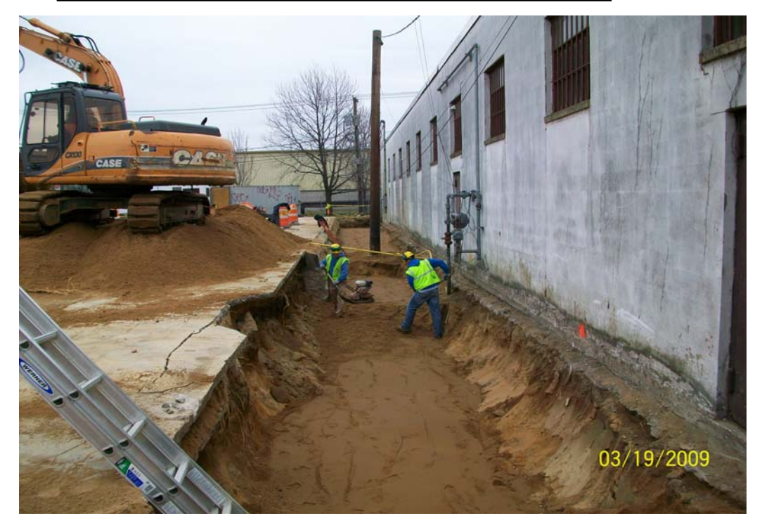
100_00135.jpg - Backfilling and compacting the east alleyway.