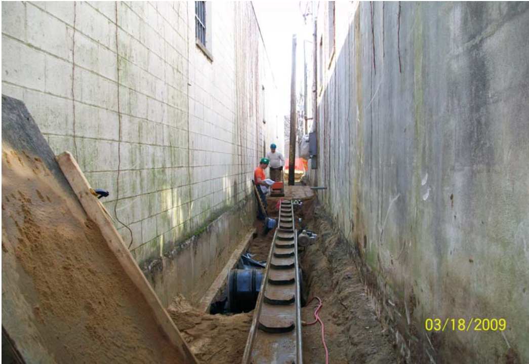
100_00133.jpg - Finishing compacting west alleyway for the day.