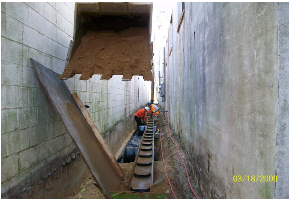
100_00132.jpg - Conveyor belt set in west alleyway.