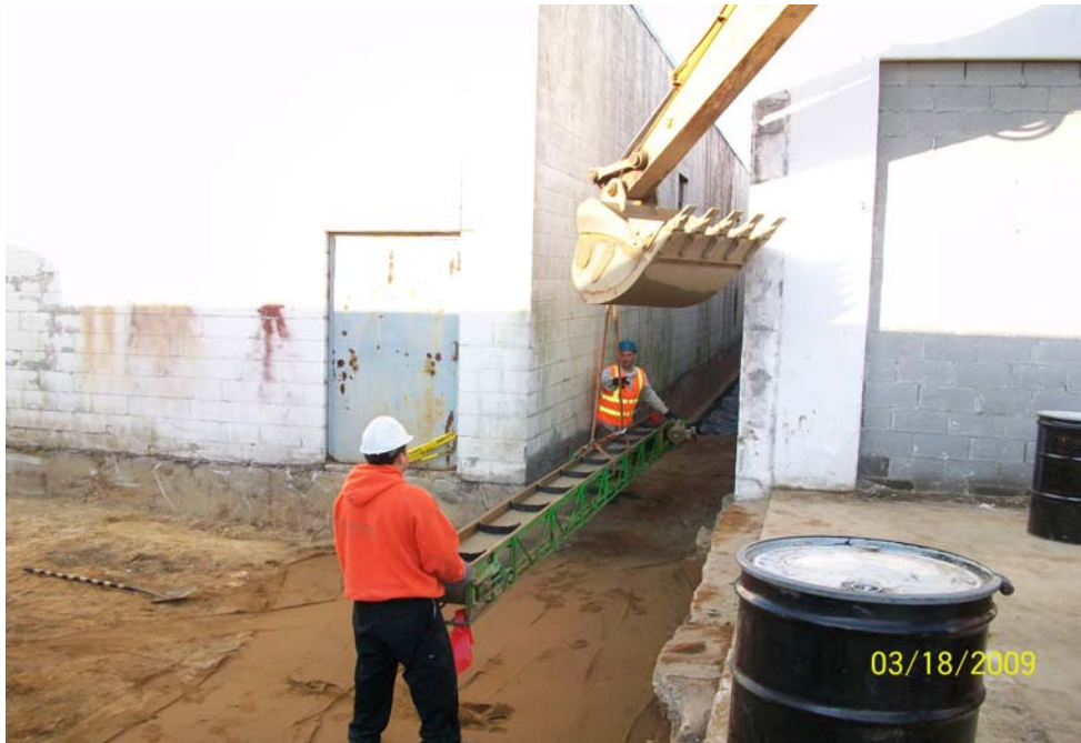
100_00131.jpg - Setting up conveyor belt to move backfill material in west alleyway.