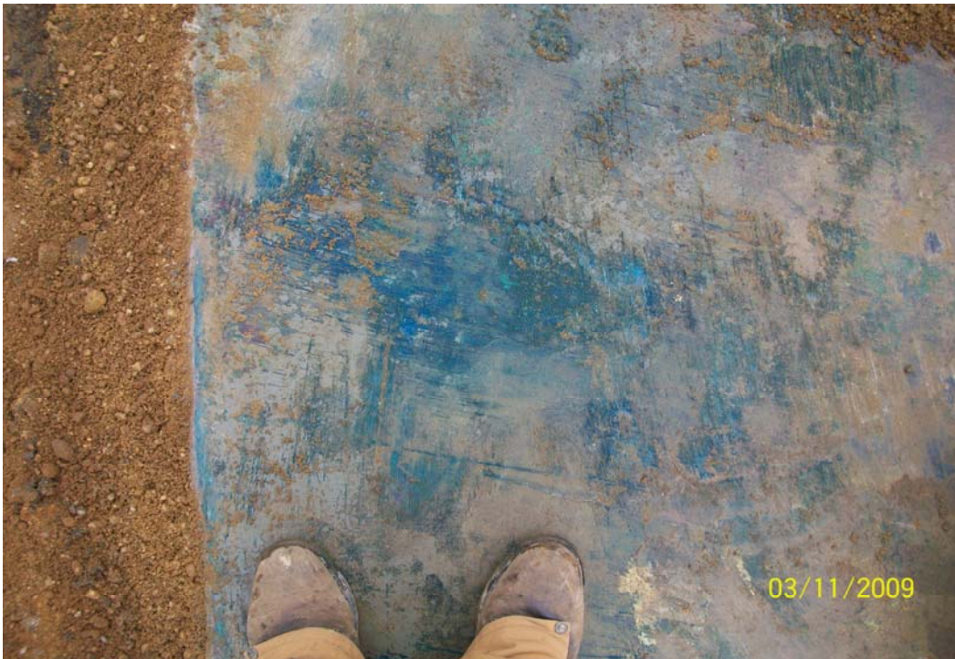
100_0102.jpg - Green staining on slab opposite gas meter.