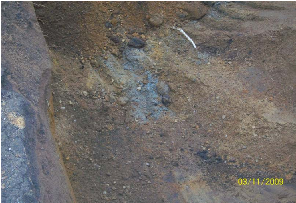
100_104.jpg - Green soil in east alleyway, ~20' west of gas meter.