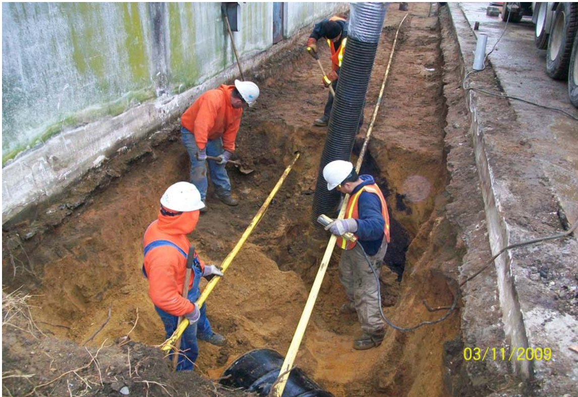
100_106.jpg - Excavating east end of east alleyway.