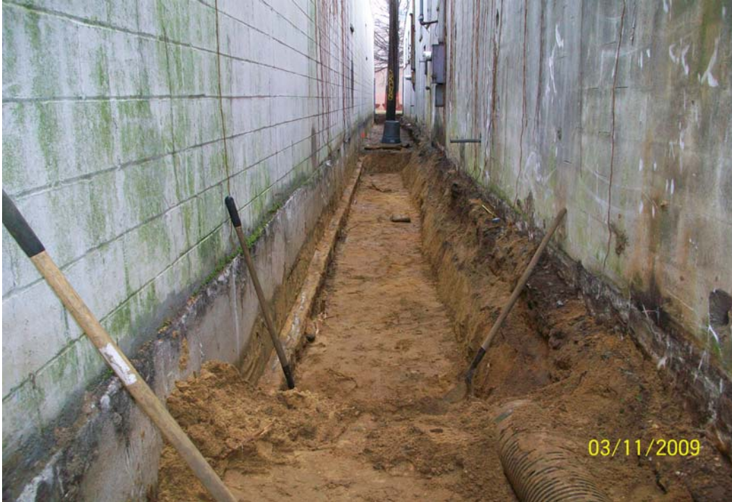
100_0103.jpg - Completed excavation in west alleyway.