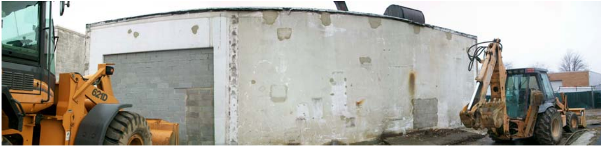
100_105.jpg - Completed repair of east wall of 51 Cabot Street