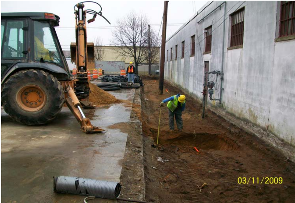
100_0098.jpg - Excavating east alleyway.