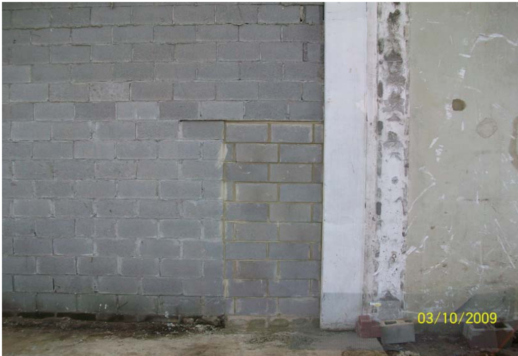
100_0095.jpg - Finishing closing up door opening on east wall of 51 Cabot Street.