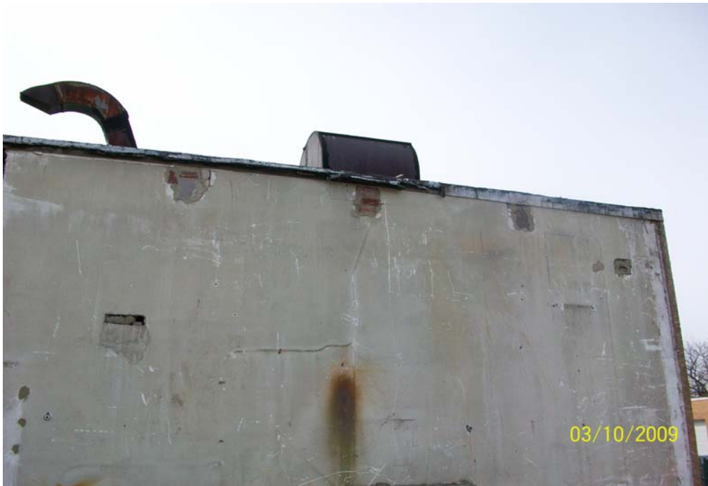
100_0096.jpg - Finished closing up top wall openings on east wall of 51 Cabot Street.