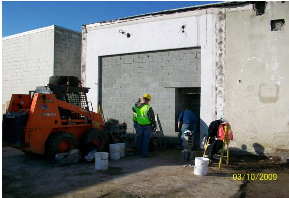
100_0094.jpg - Starting repair of door opening on east wall of 51 Cabot Street.