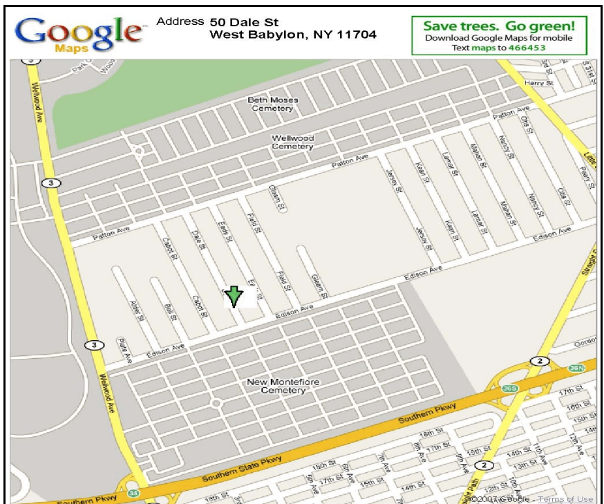
Figure 1- Site Location Map

Since potentially responsible parties were unable/unwilling to perform investigation work, the NYSDEC began a state-funded Remedial Investigation/Feasibility Study (RI/FS) to determine the extent of soil and groundwater contamination. Sampling activities were completed between June 1999 - May 2001. The RI revealed that the primary contaminant type in the subsurface soils are inorganics (metals). The metals contaminated areas are the cesspools and the drainage structures, the alleyway and the area within and surrounding the sump inside the building. The shallow groundwater underlying the site is contaminated by volatile organic compounds and metals.