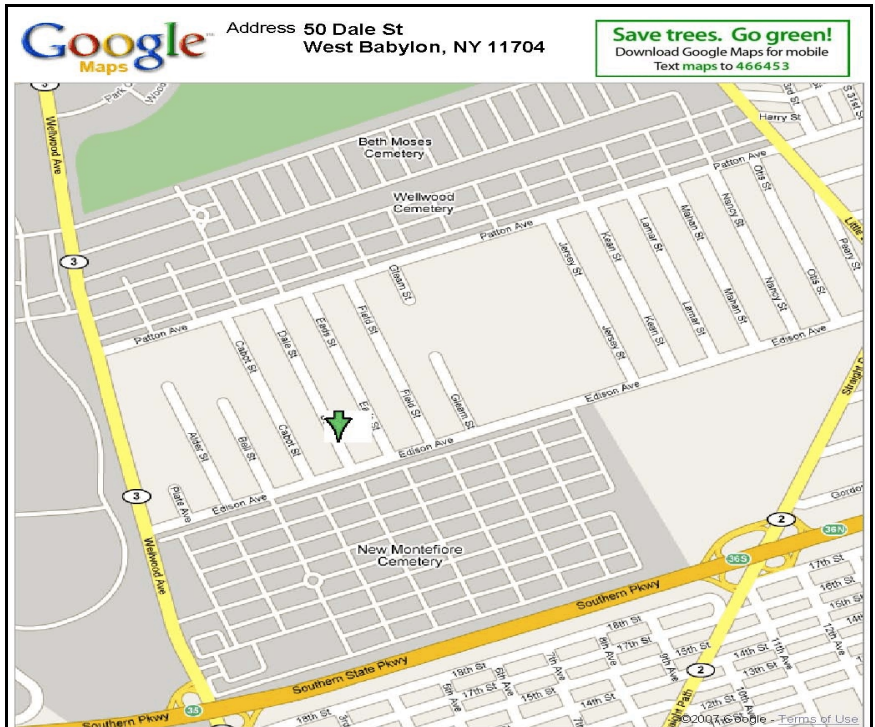
Figure 1- Site Location Map

Since potentially responsible parties were unable/unwilling to perform investigation work, the NYSDEC began a state-funded Remedial Investigation/Feasibility Study (RI/FS) to determine the extent of soil and groundwater contamination. Sampling activities were completed between June 1999 - May 2001. The RI revealed that the primary contaminant type in the subsurface soils are inorganics (metals). The metals contaminated areas are the cesspools and the drainage structures, the alleyway and the area within and surrounding the sump inside the building. The overburden groundwater underlying the site is contaminated by volatile organic compounds and metals.