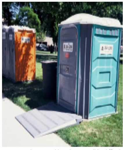
This accessible toilet unit will be difficult for many people with mobility disabilities to enter because they must open the door while on the slope of the ramp. A level landing should be provided.

"ADA Compliant" in a catalog actually complies with the ADA Standards for Design. Truly accessible units have a 5 foot turning space. Accessible portable toilets have the same features found in any other accessible toilet stall, including, but not limited to: an accessible door that has at least 32 inches of clear width and accessible hardware, side and rear grab bars that can support at least 250 pounds of force, clear space next to the toilet that is necessary for transferring to/from a mobility device and the toilet, and maneuvering space within the unit. For information about the specific ADA requirements for the design and placement of these features, as well as for shelves, dispensers or coat hooks in toileting units, visit www.ada.gov/2010ADAstandards_index.htm.