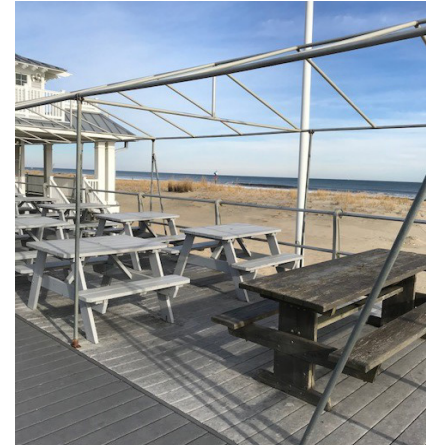
None of the picnic tables at this pavilion are accessible to visitors who use wheelchairs.

“A disability doesn’t have to be a social barrier. Good etiquette begins with inclusion...”