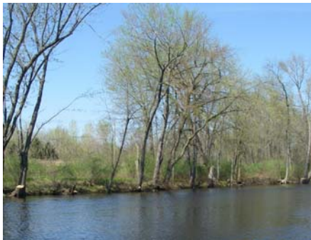
Figure 1 Results of shoreline tree trimming for dredging access. DEC’s review highlighted the importance of overhanging trees and improved understanding of the need to limit tree trimming.

Hudson River to remove PCB contaminated sediments on May 15, 2009. This project is expected to reduce the availability of PCBs in the river and lead to lower concentrations in fish and wildlife with corresponding benefits to their populations and to human use of these natural resources. Bureau of Habitat staff, in the Environmental Monitoring Section, have played a key role in planning, design and monitoring leading up to initiation of dredging and will continue to engage in this work while