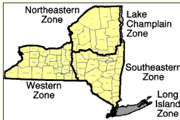
Migratory Waterfowl Hunting Zones (does not include Canada Goose Hunting Zones )

Get all available hunting dates by visiting the Hunting Seasons webpage