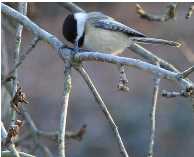
A black-capped chickadee enjoying a sunflower seed, a favorite food in winter