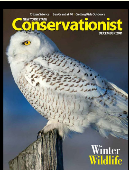
Cover image photo of snowy owl by Eric Dresser

And don't forget to order a gift subscription for someone on your holiday shopping list!