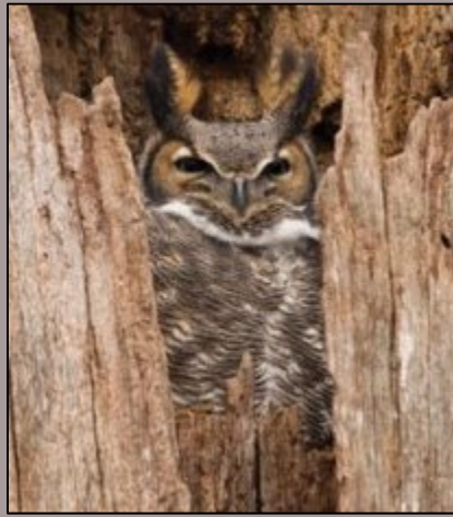
A great horned owl in the cavity of dead tree stump.

Read more fun facts about this fierce bird of prey.